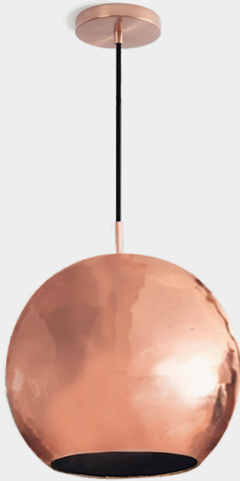
SHOWN IN COPPER

Mishal is highly versatile with its simple yet modern shape, the Mishal Pendant Light is a timeless light fixture designed to easily fit into a variety of interiors. This pendant light is ideal for use as a single light fixture or arranged in multiples of the same size or various sizes to create a compelling installation.