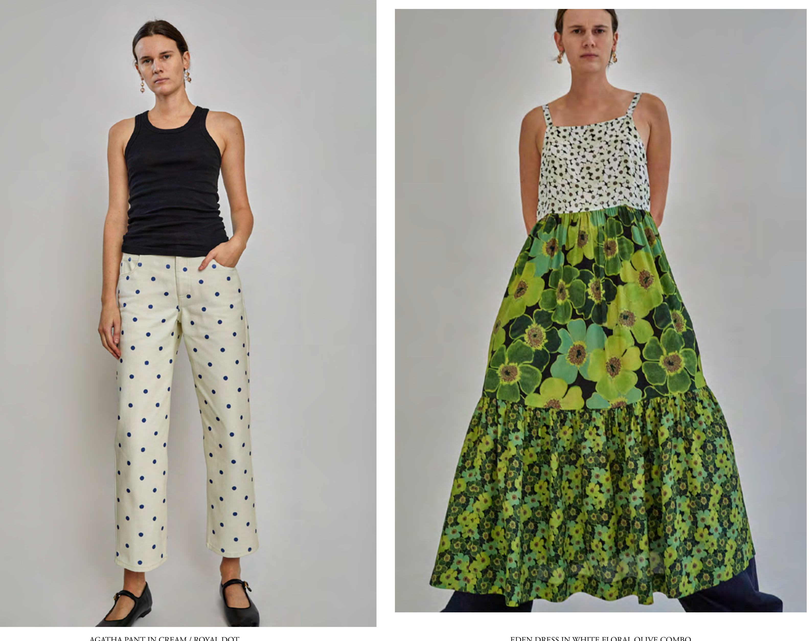
AGATHA PANT IN CREAM / ROYAL DOT