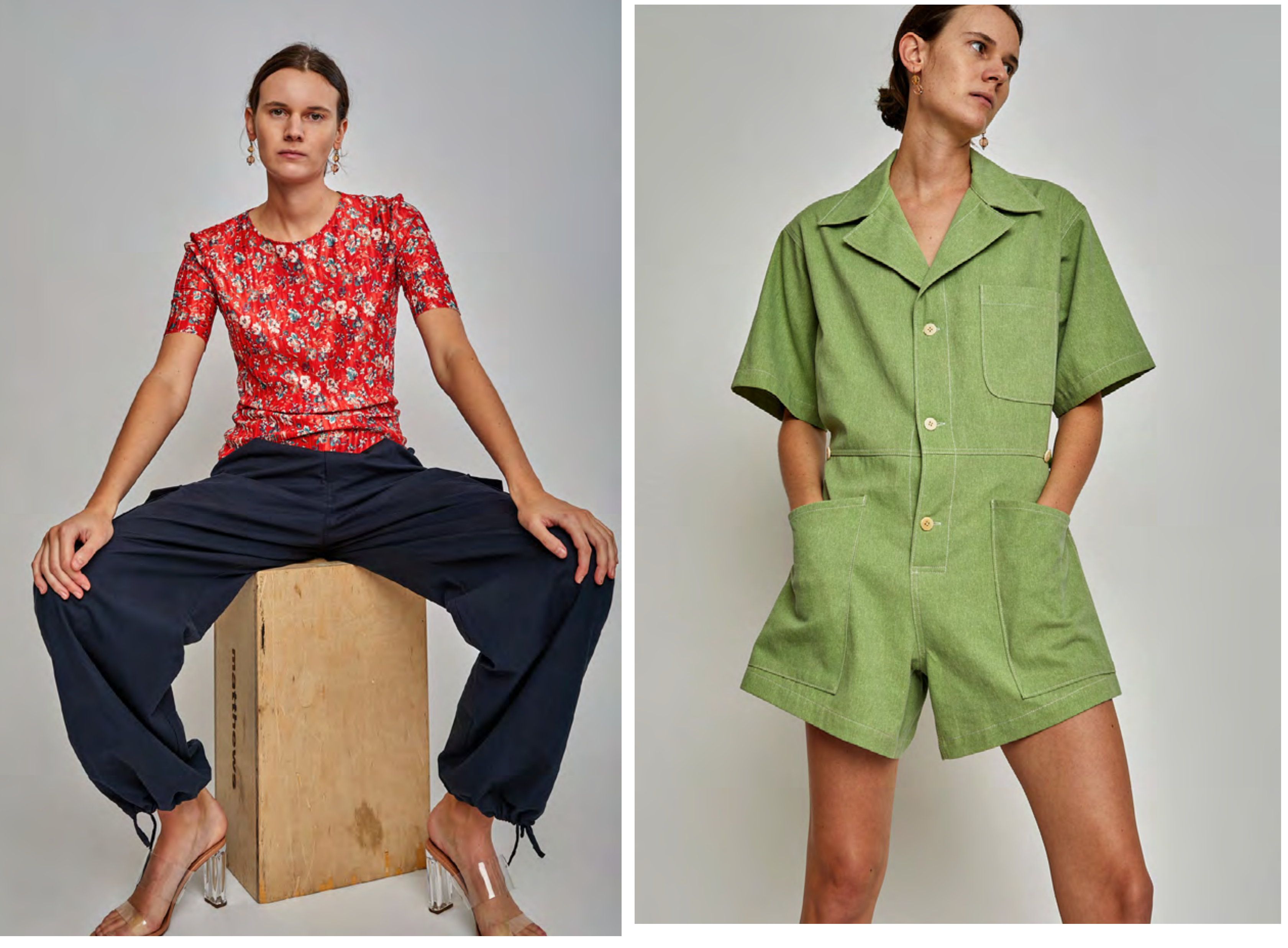
CARINE TOP IN RED WISTERIA