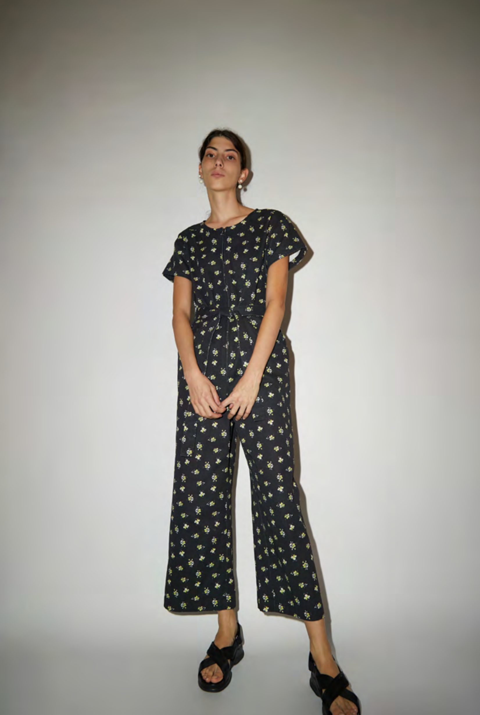
SLATE JUMPSUIT IN BLACK DITSY TWILL