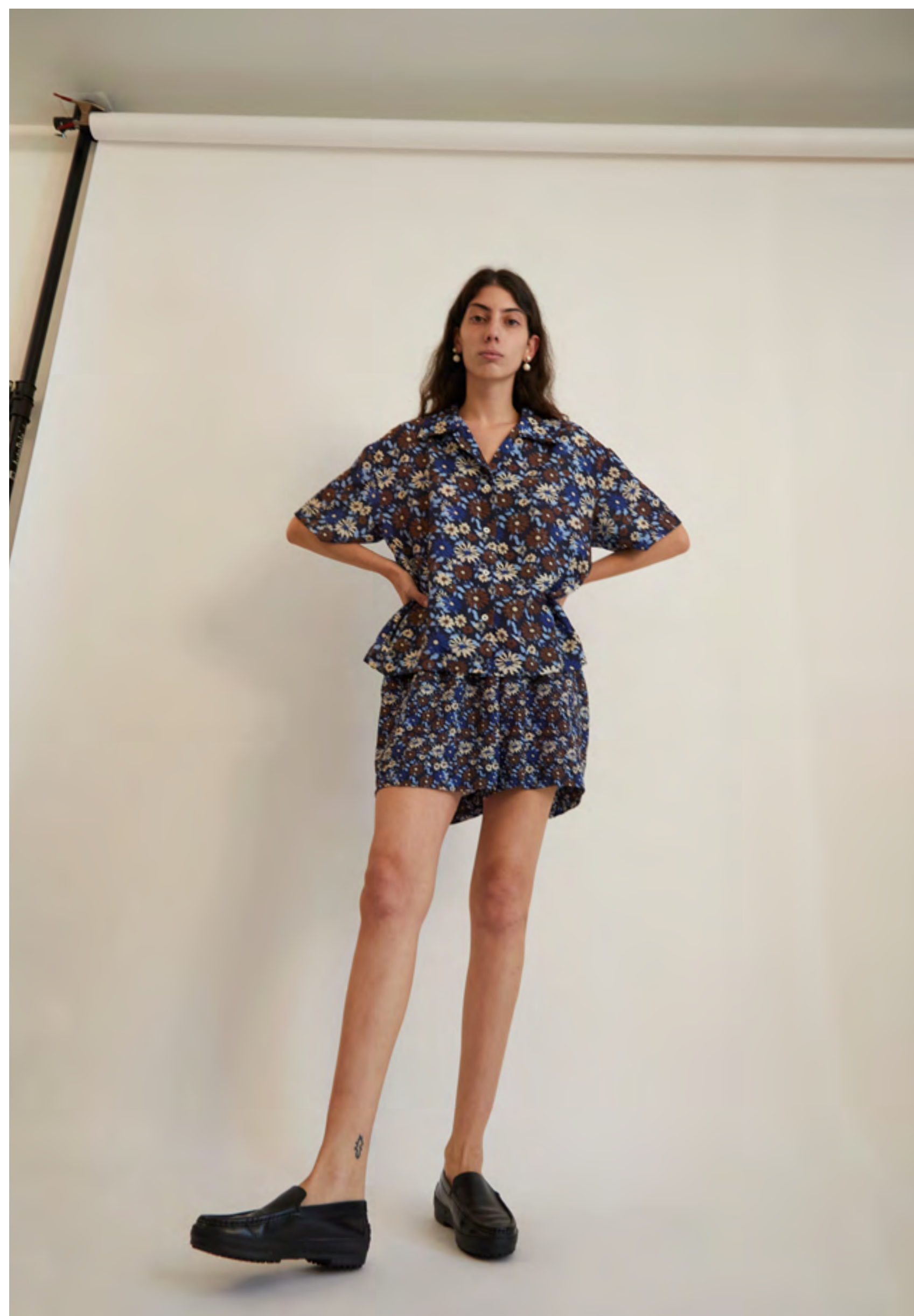
LEIGH SHIRT IN BLUE BROWN DAISIES / VICTOR SHORT IN BLUE BROWN DAISIES