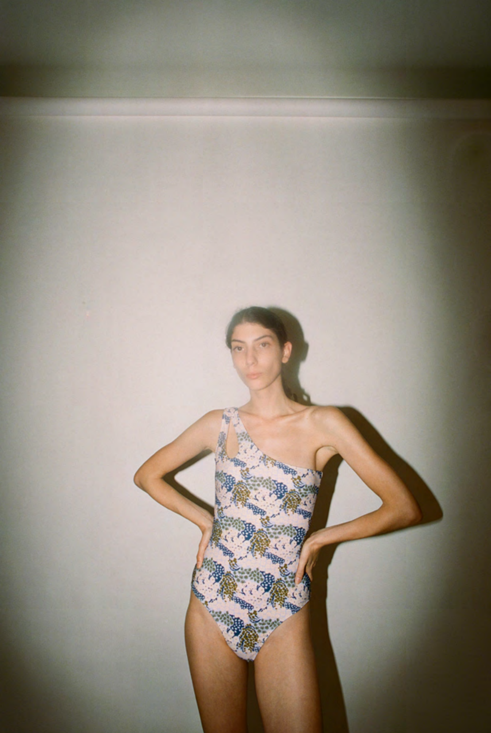
CLAUDIA SWIMSUIT IN CLOUD FLORAL CAMO