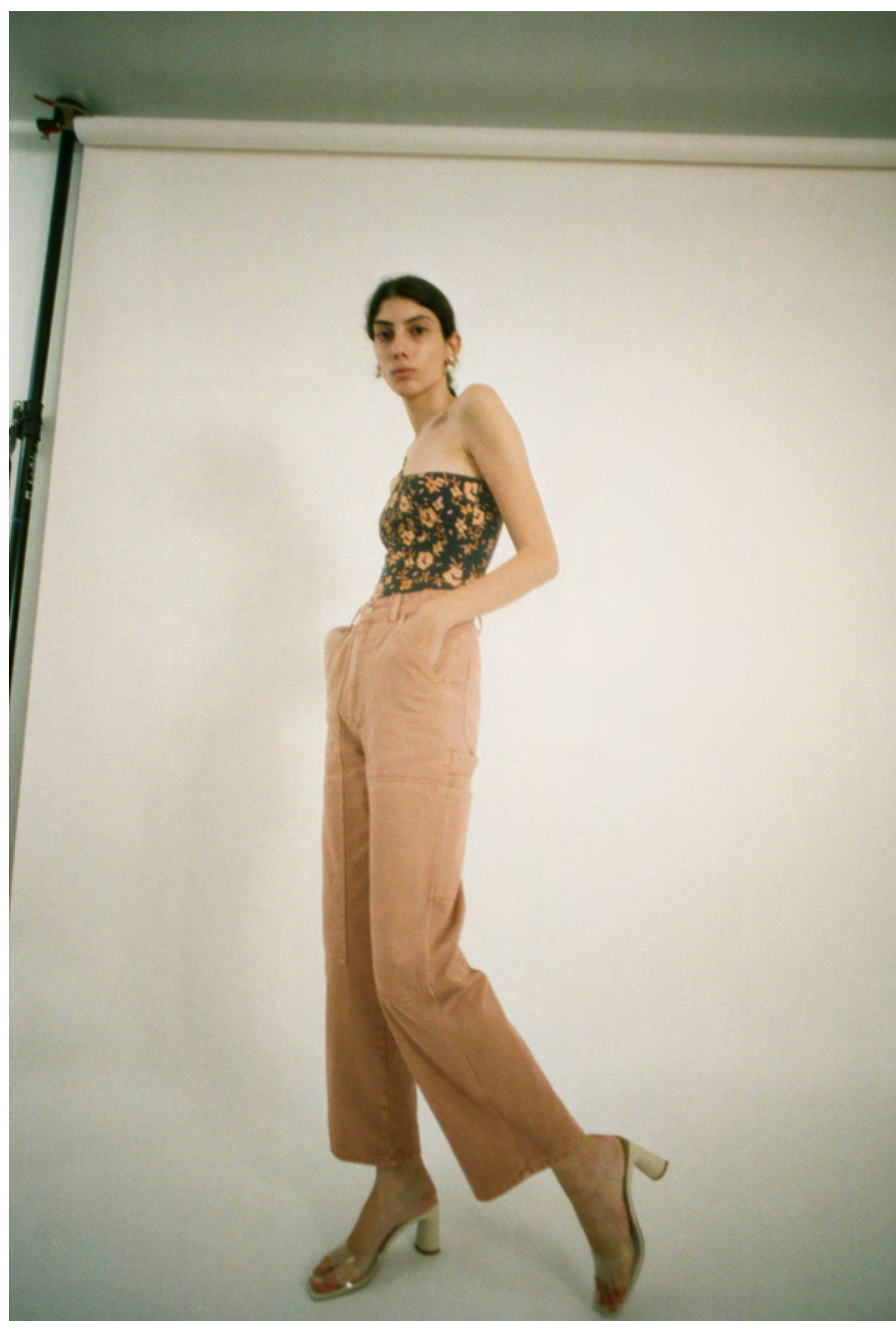
CLAUDIA SWIMSUIT IN BLACK GOLD TERRACOTTA / JACKSON PANT IN CHAI DENIM