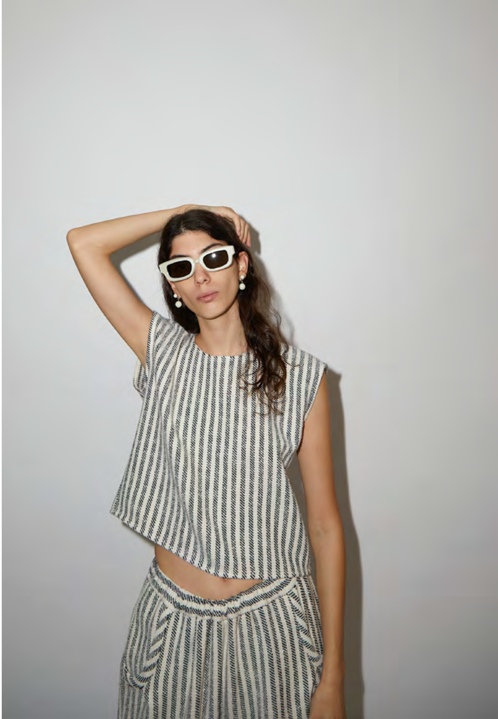
IZZY TOP AND ZIGGY PANT IN CREAM BLACK TULUM STRIPE