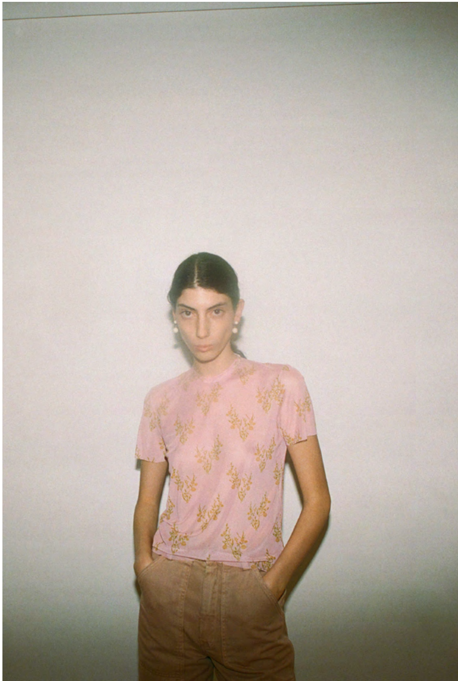
CAREY TOP IN PINK LEMON VINE MESH