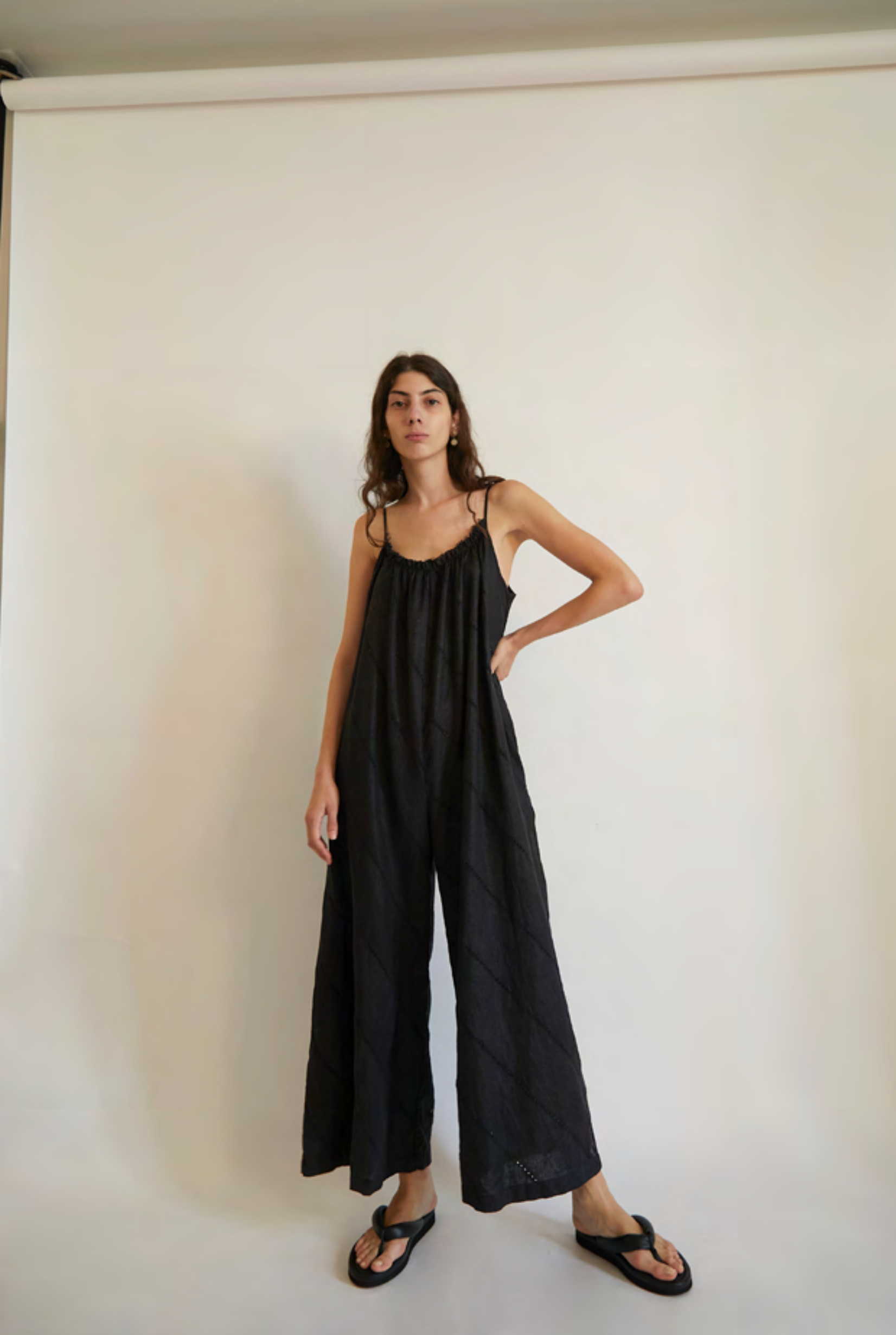
EVE JUMPSUIT IN BLACK EYELET LINEN