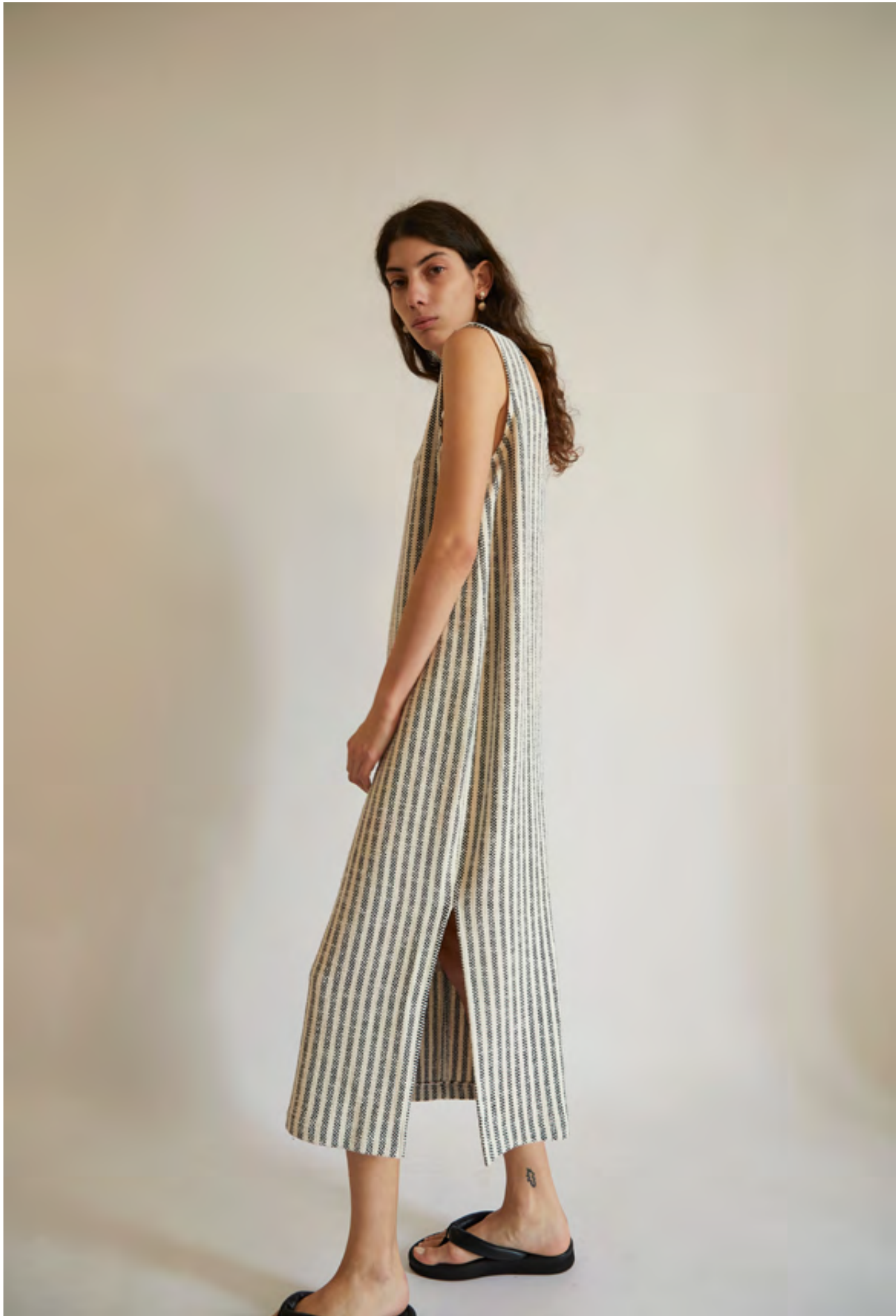
COLUMN DRESS IN CREAM BLACK TULUM STRIPE