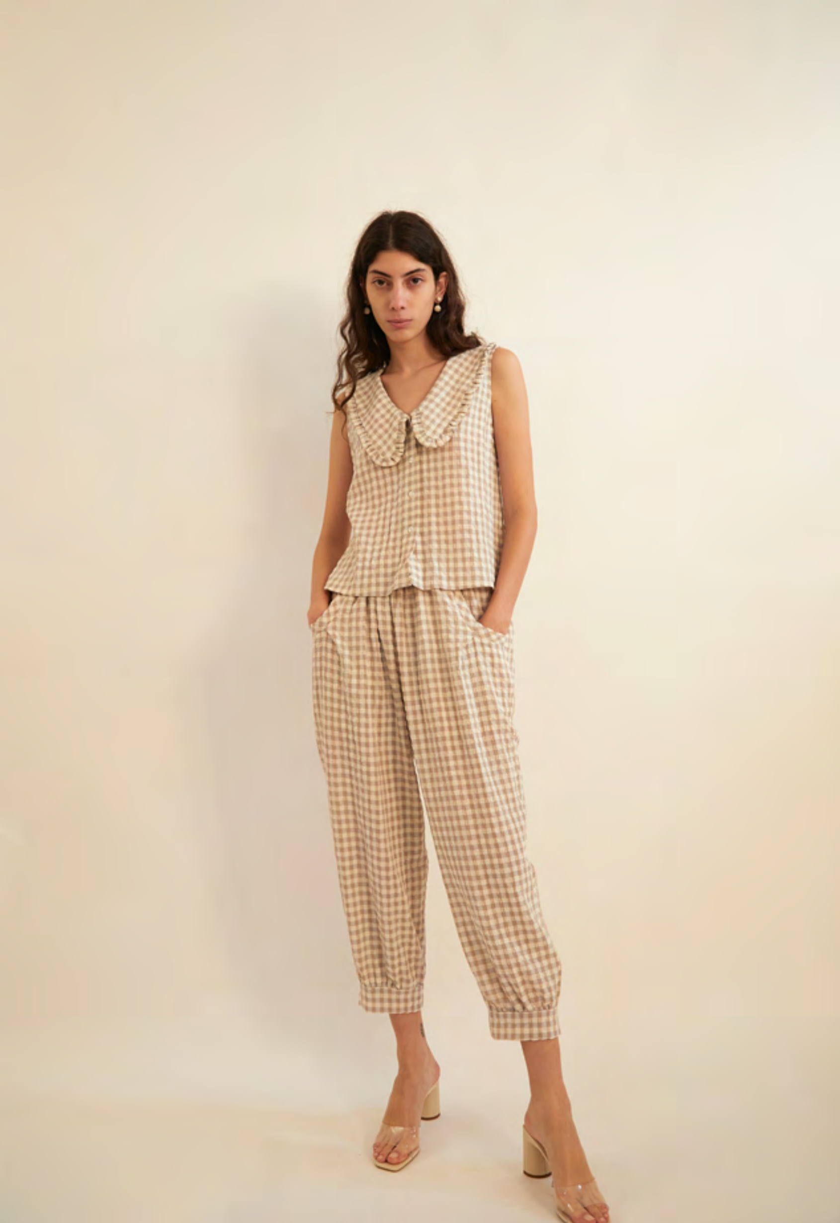
LACEY TOP IN CEMENT CREAM SUMMER CHECK / ZIGGY PANT IN CEMENT CREAM SUMMER CHECK