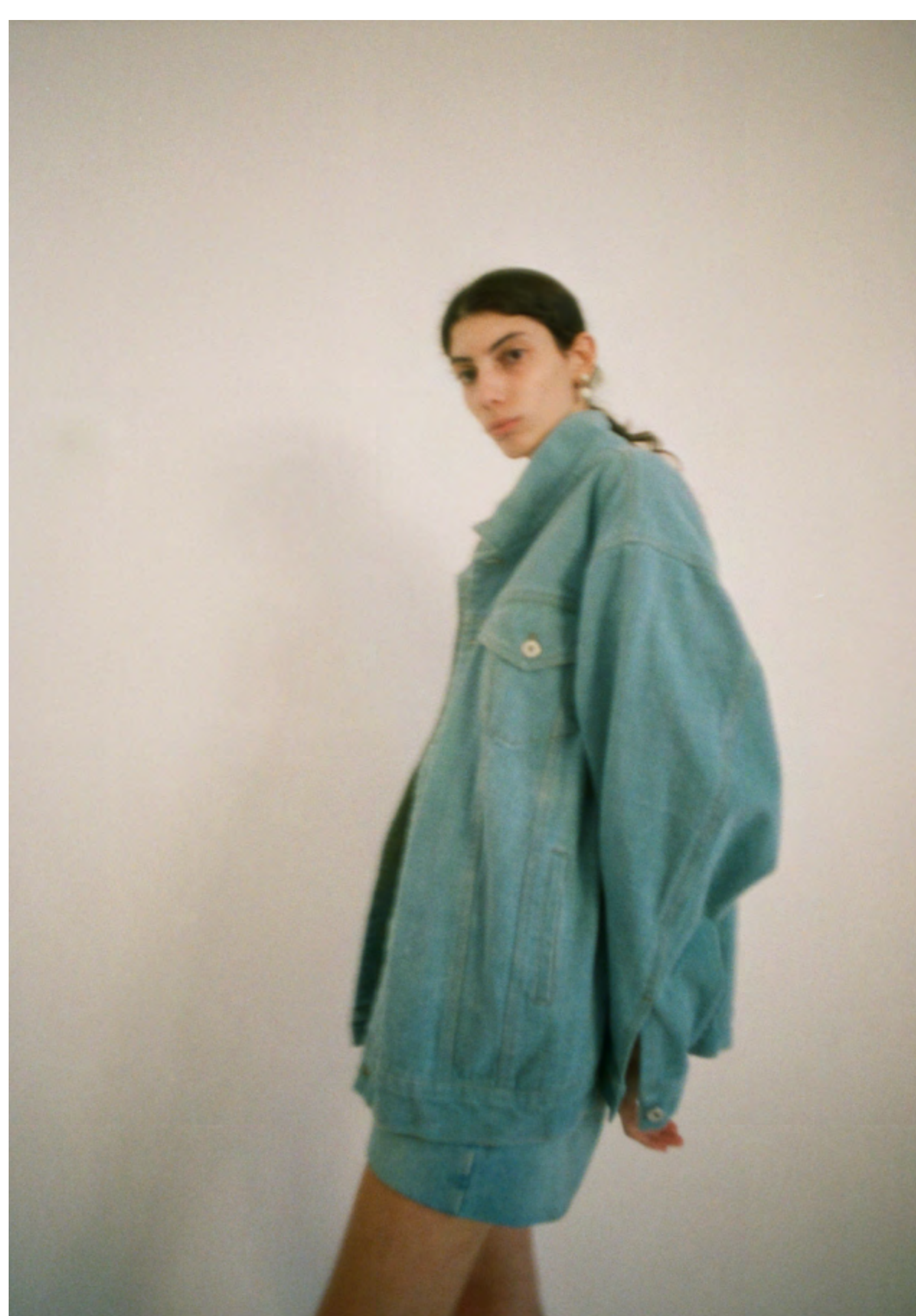
GRANT JACKET IN BLUE WASHED DENIM / ELVIS SKIRT IN BLUE WASHED DENIM / JACK SWEATSHIRT IN MANGO