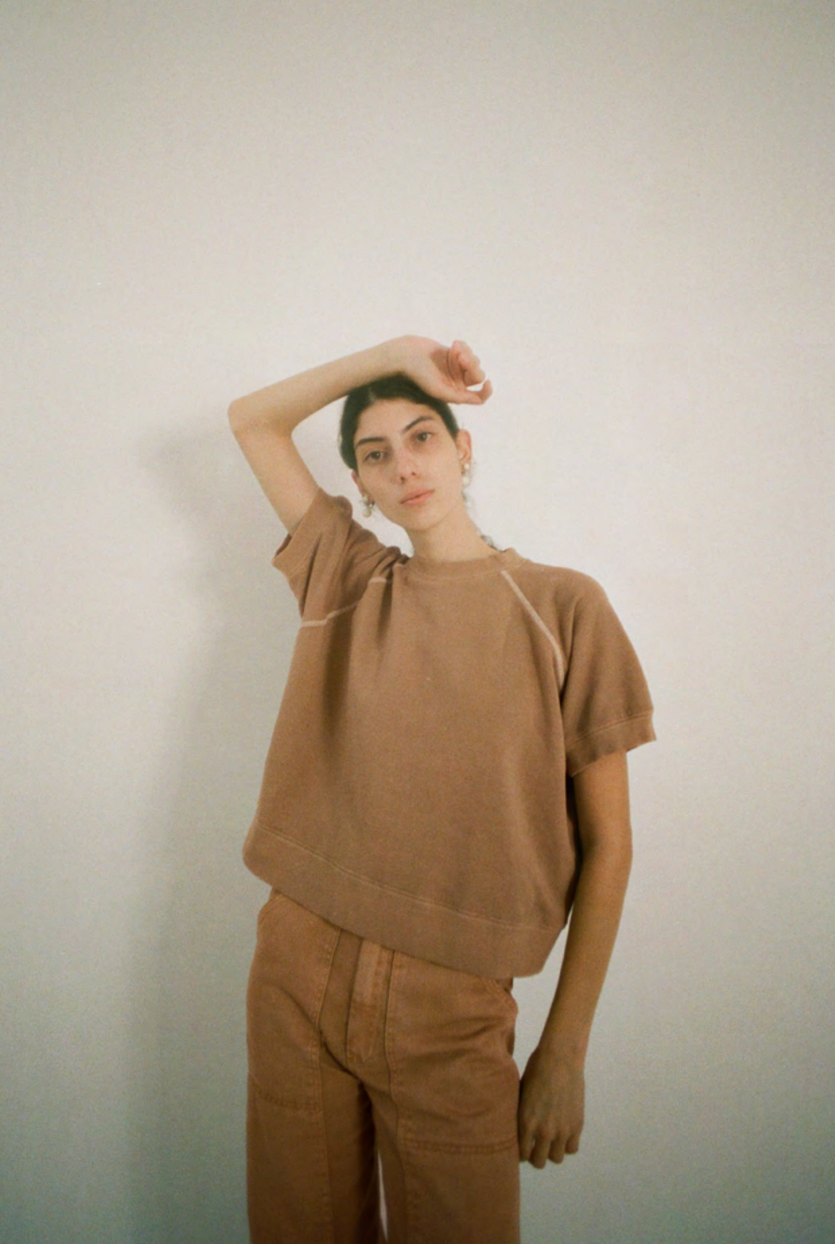
JACK SWEATSHIRT IN BISCUIT / JACKSON PANT IN CHAI DENIM