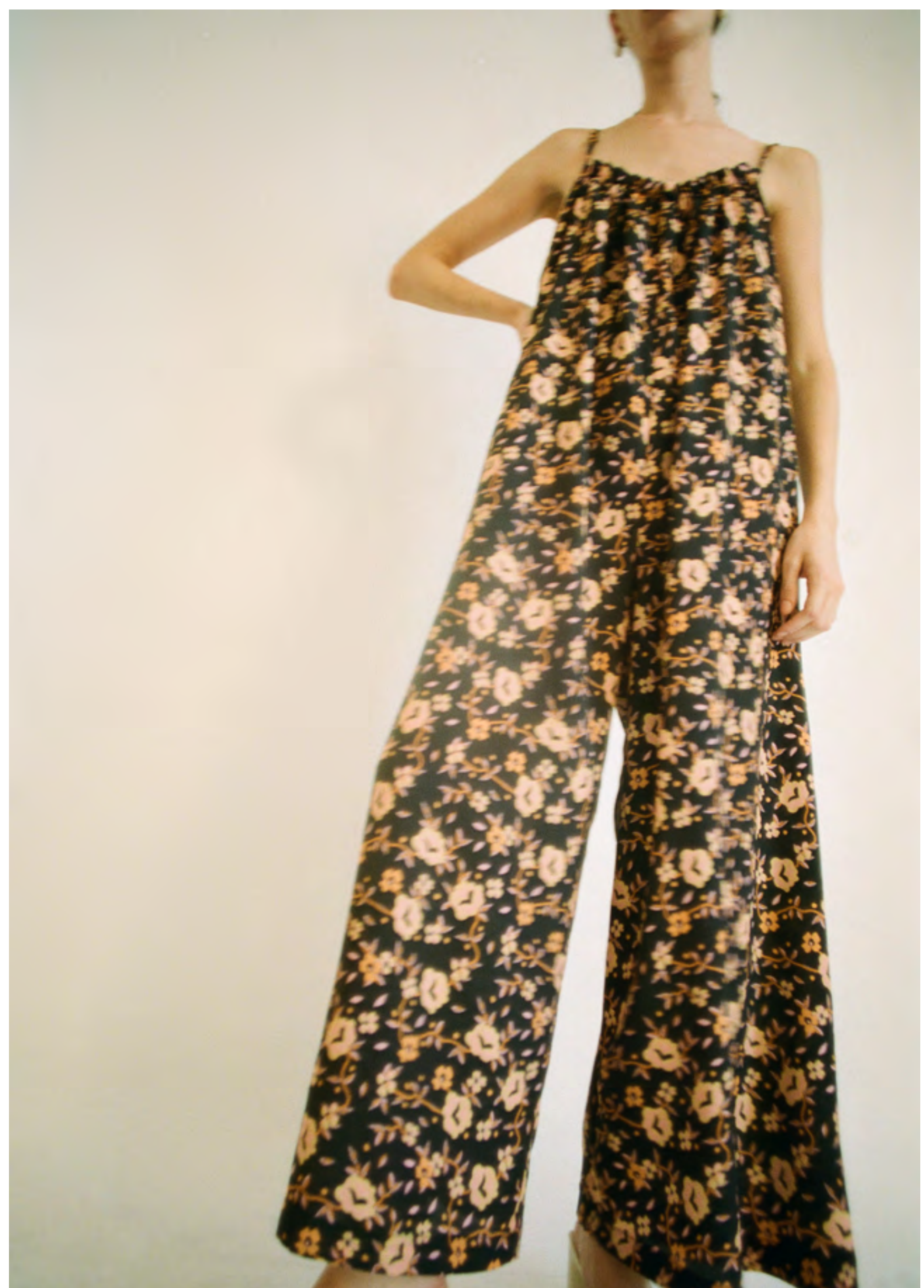
EVE JUMPSUIT IN BLACK GOLD