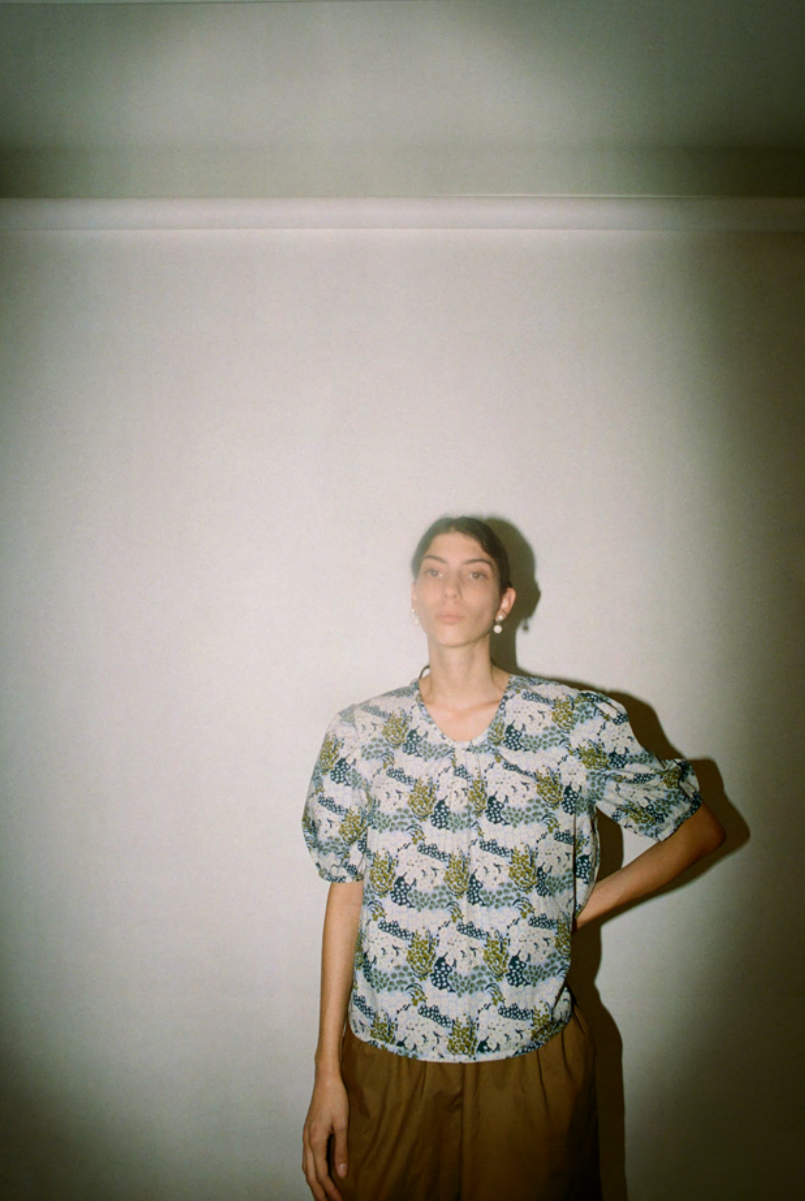
VIVIAN TOP IN CLOUD FLORAL CAMO COTTON POPLIN