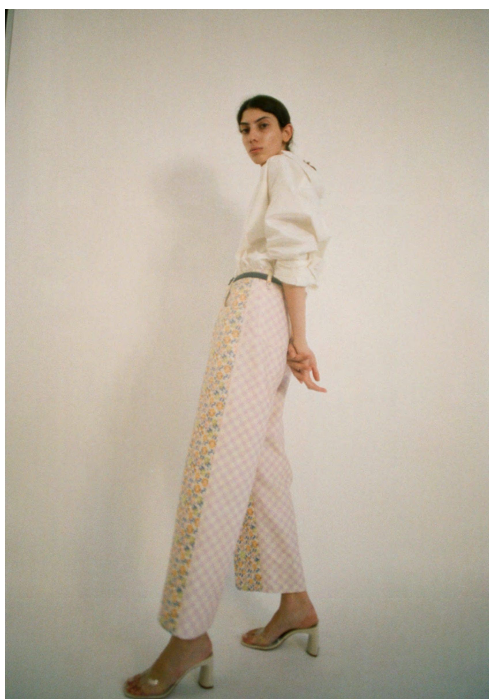
LAKE SHIRT IN WHITE COTTON POPLIN / AGATHA PANT IN MELON DAISY LILAC GINGHAM COMBO DENIM