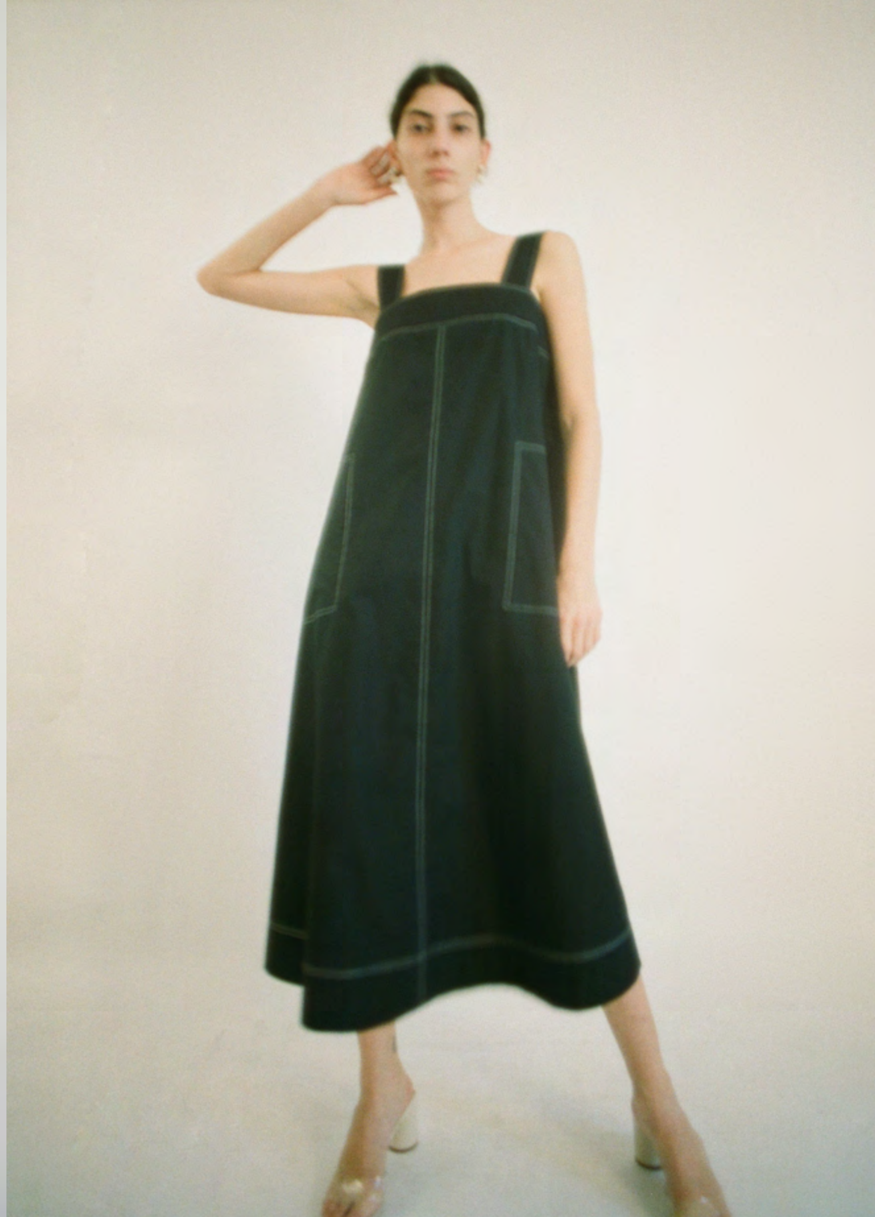
LINN DRESS IN BLACK COTTON POPLIN