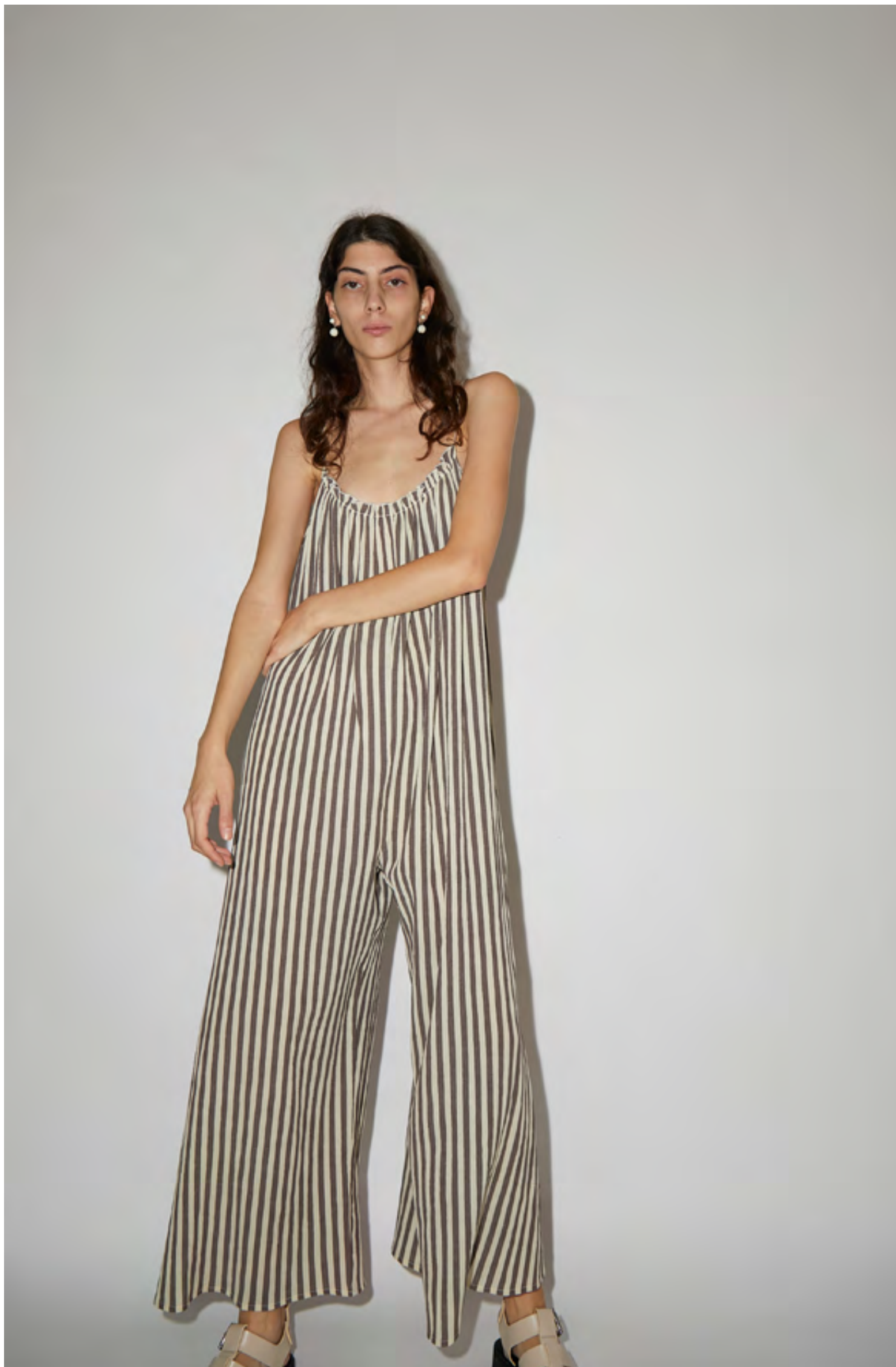
EVE JUMPSUIT IN MOROCCAN STRIPE COTTON