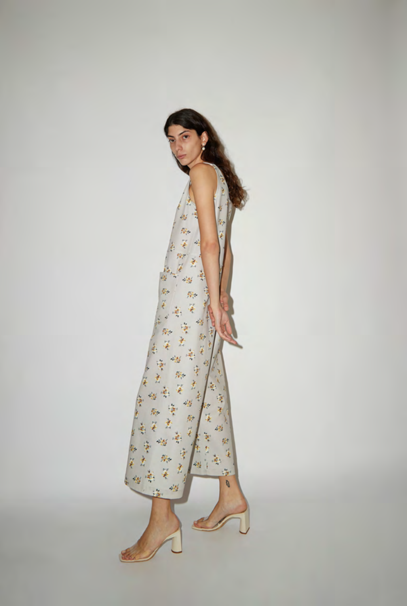
BARNES JUMPSUIT IN STONE DITSY