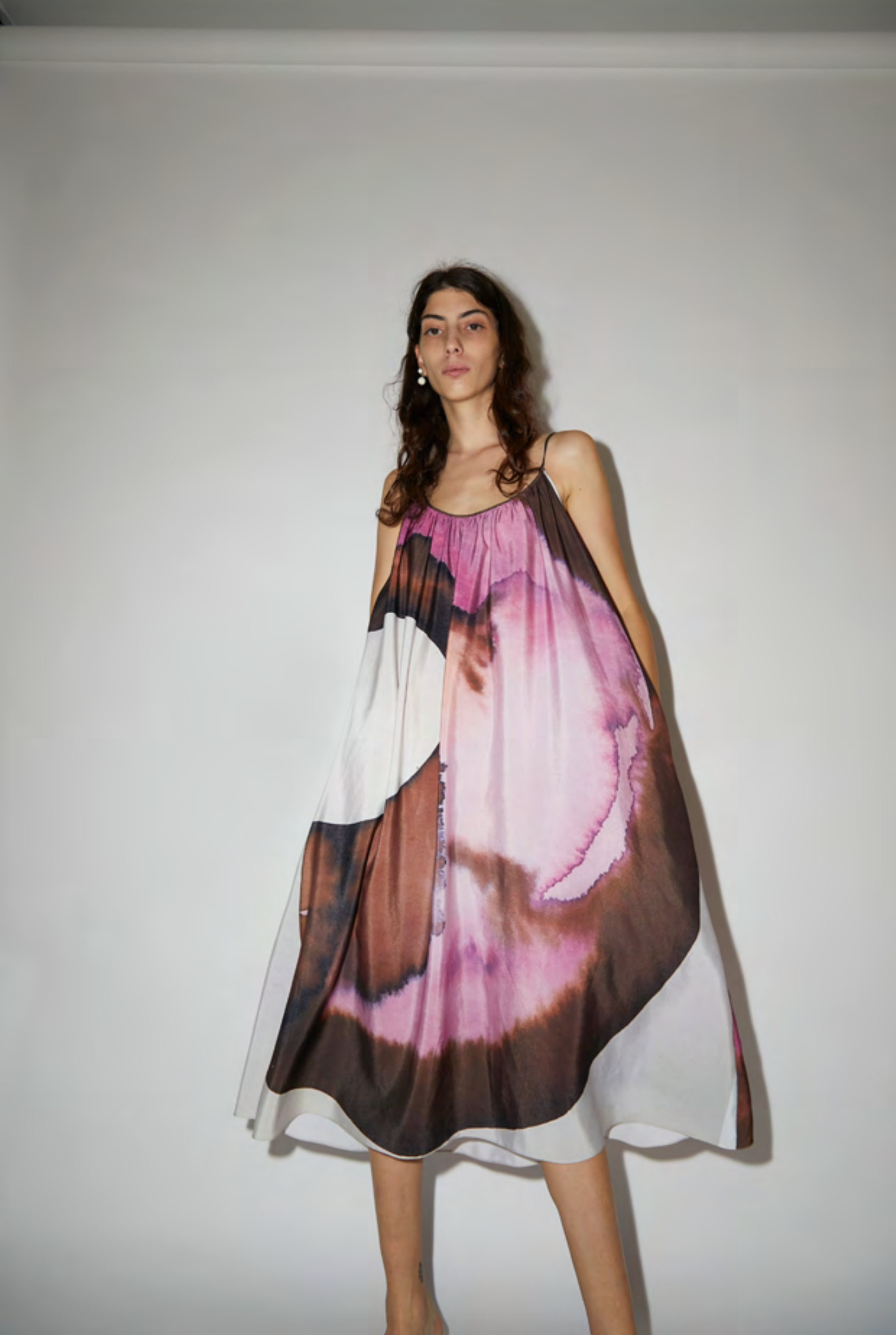
RUBY DRESS IN PINK WATER RAYON TWILL