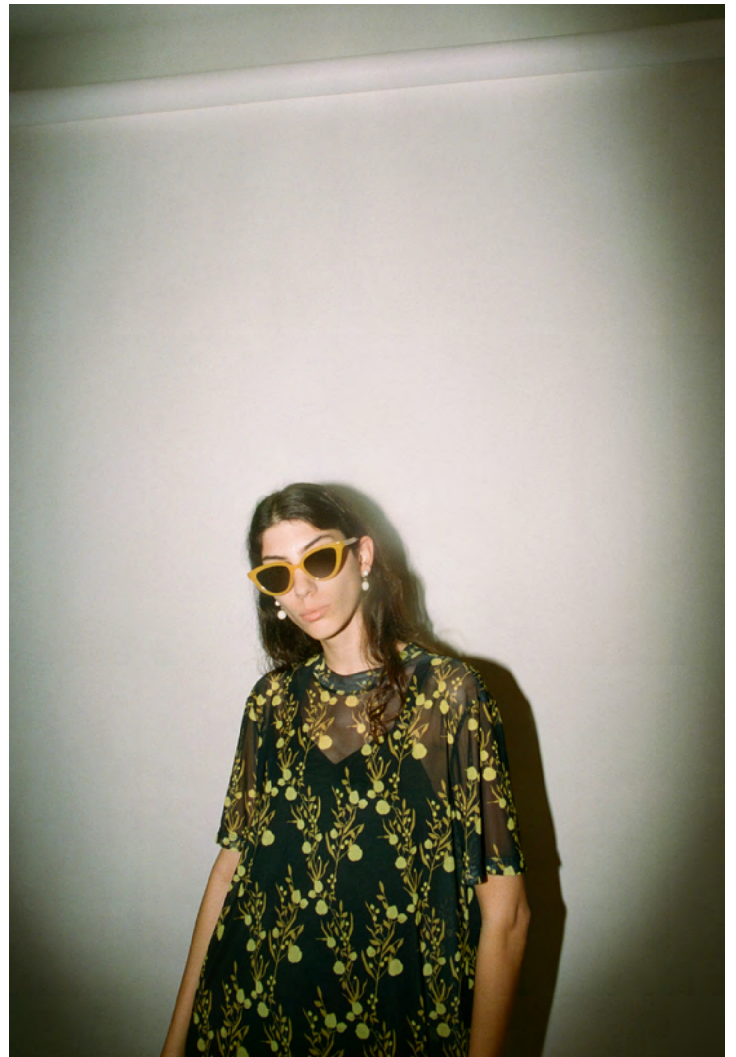
ELLA DRESS IN BLACK YELLOW BERRY FLORAL MESH