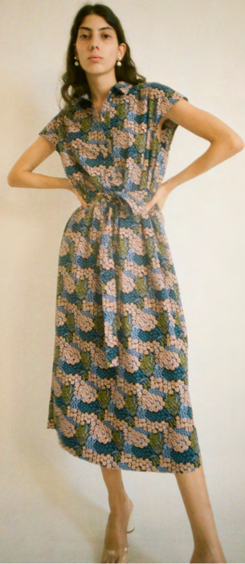
YARA DRESS IN NAVY PINK FLORAL CAMO COTTON POPLIN