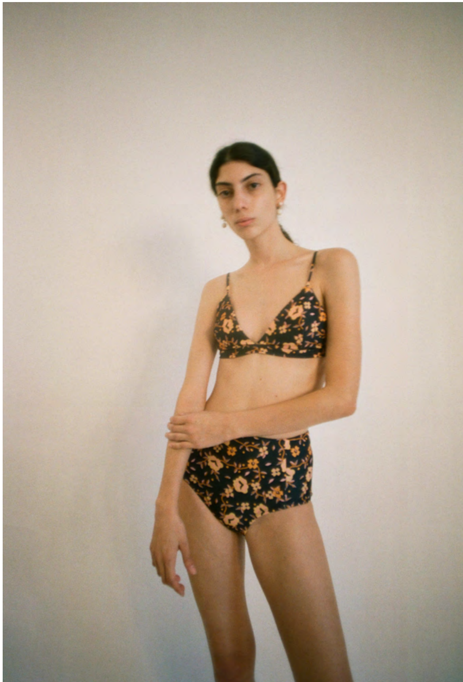
CHRISTIE BIKINI TOP AND PALOMA BRIEF IN BLACK GOLD TERRACOTTA