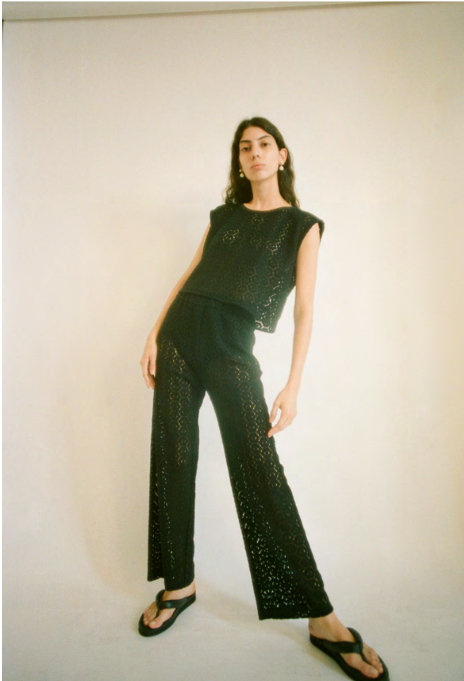
IZZY TOP / BRYAN PANT IN BLACK CROCHET