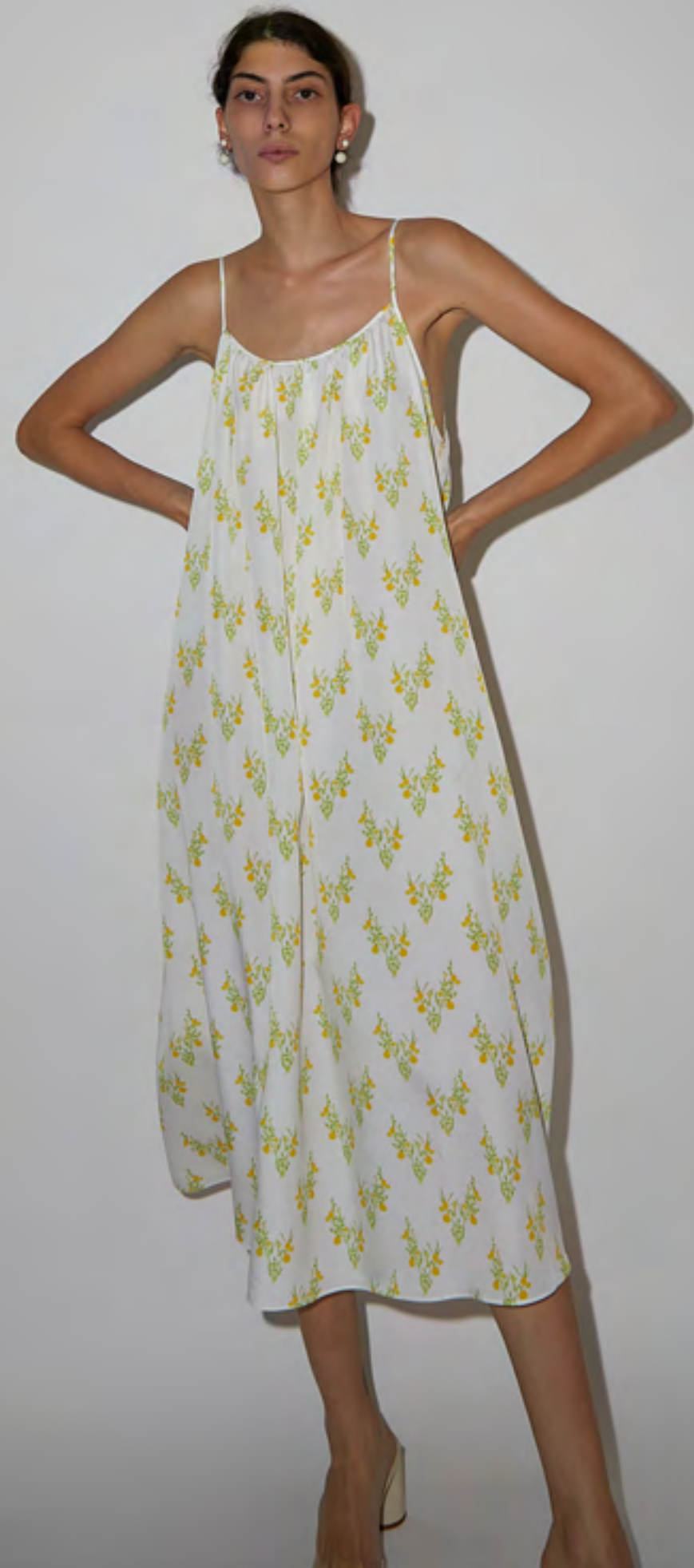
RUBY DRESS IN WHITE LEMON VINE RAYON TWLL