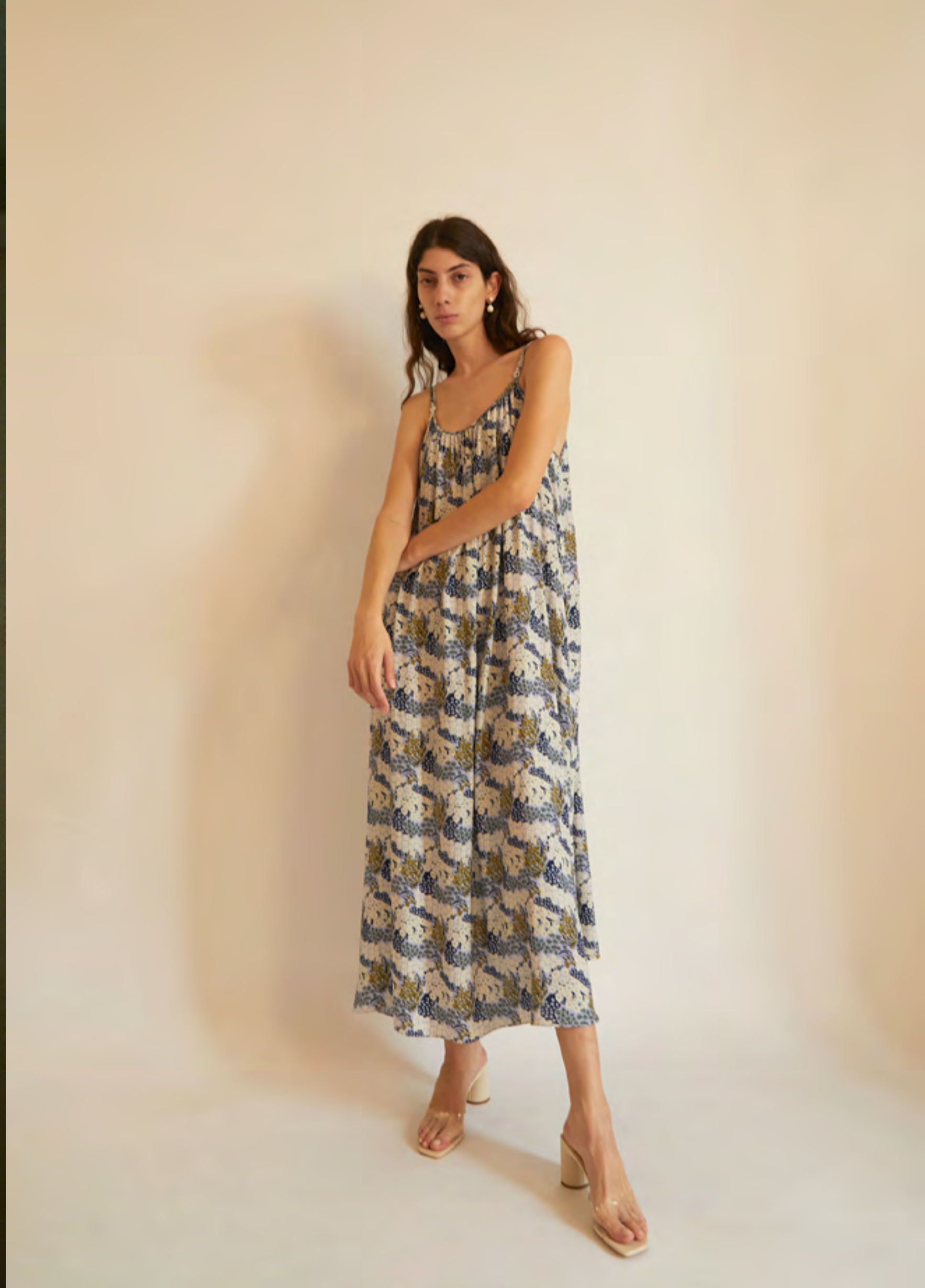
RUBY DRESS IN CLOUD FLORAL