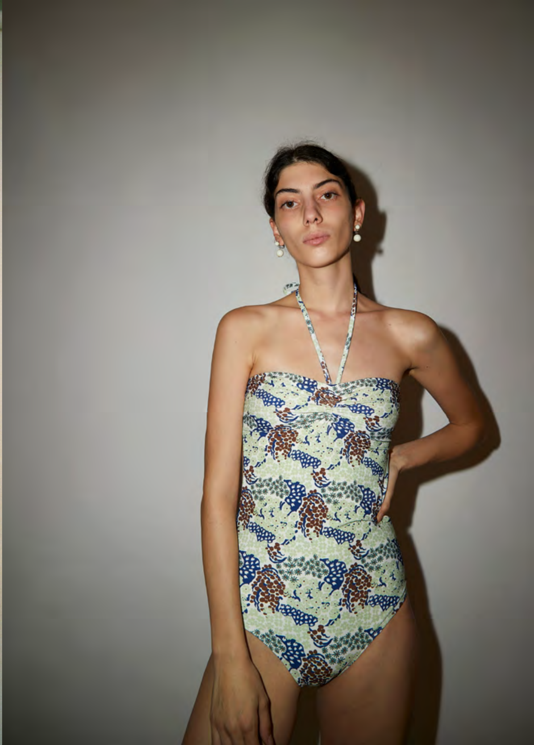
MADDIE SWIMSUIT IN MINT CAMO FLORAL