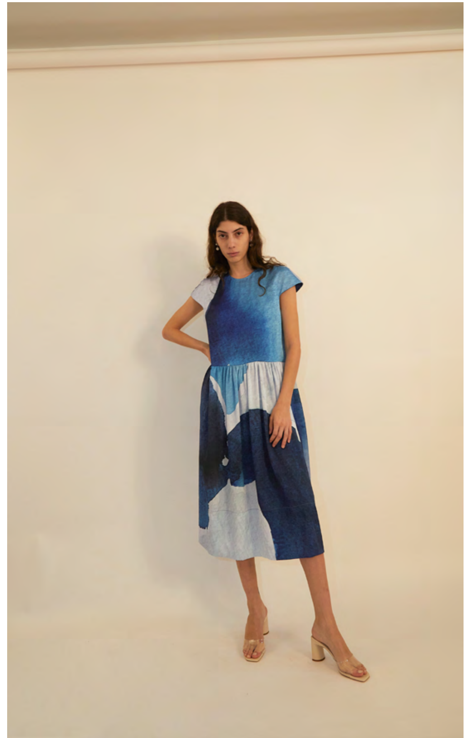
MANN DRESS IN BLUE WATER RAYON TWILL