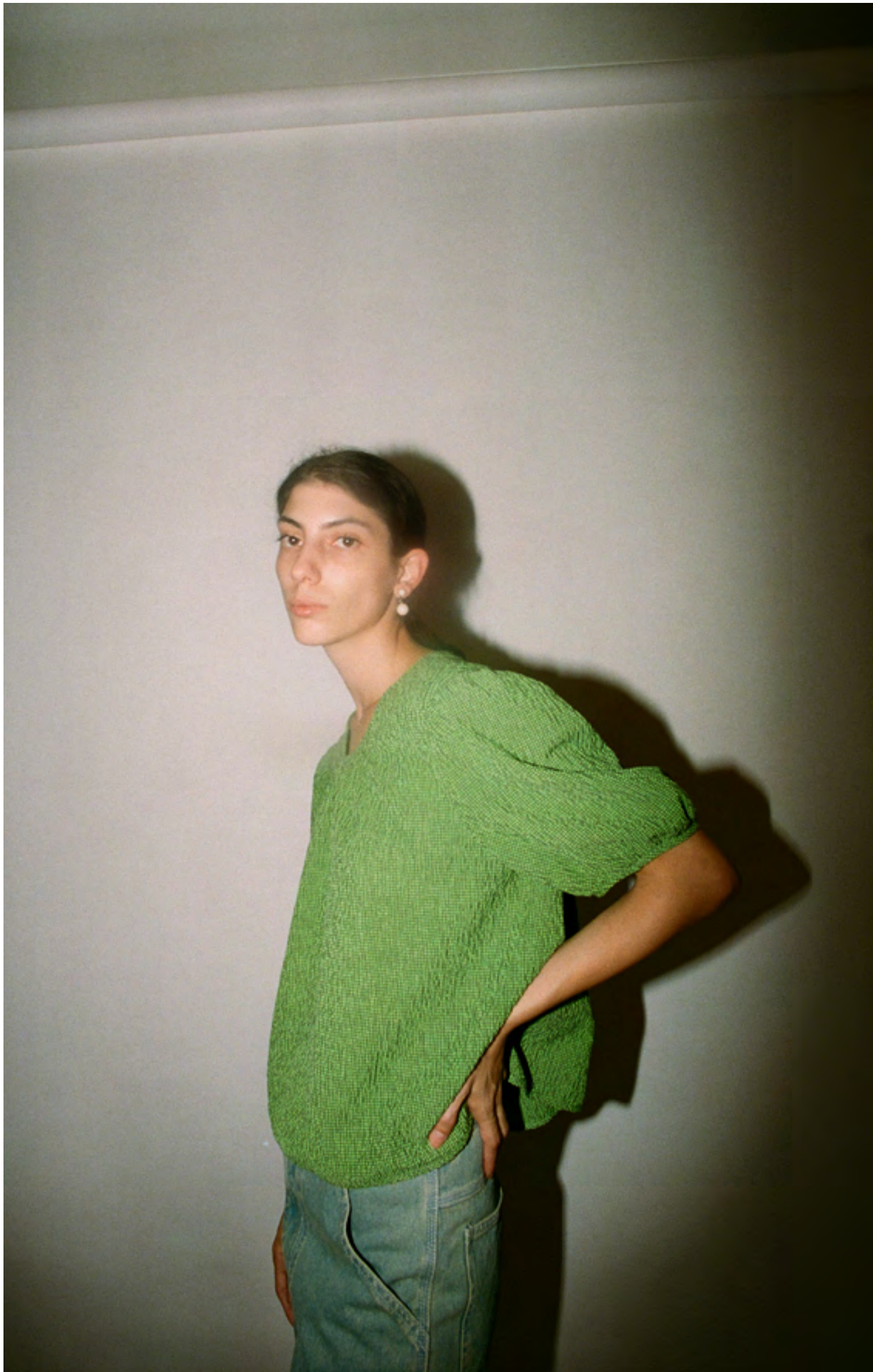
VIVIAN TOP IN PUCKERED CHECK LIME