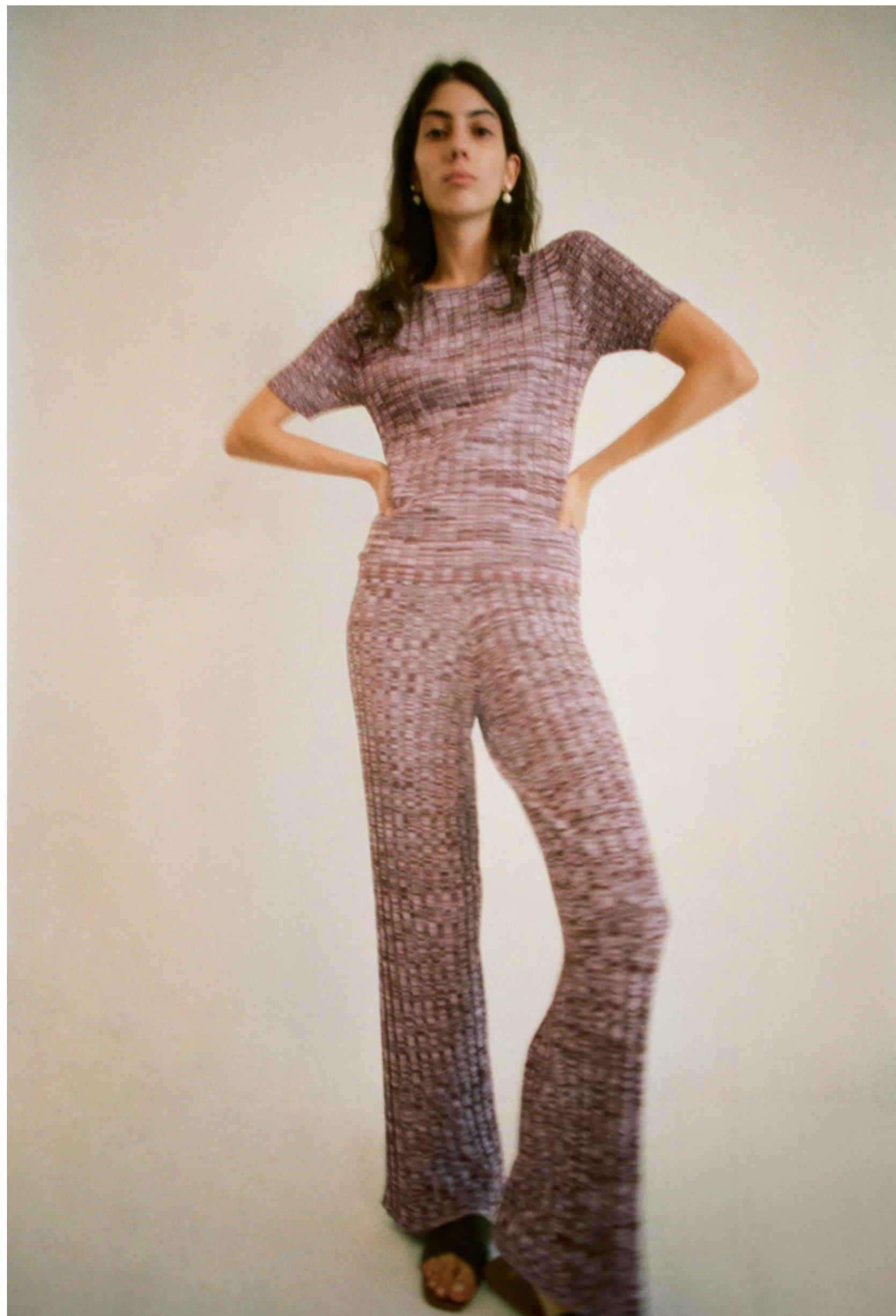
LUCY TEE IN BROWN BERRY KNIT RIB / NASH PANT IN BROWN BERRY KNIT RIB