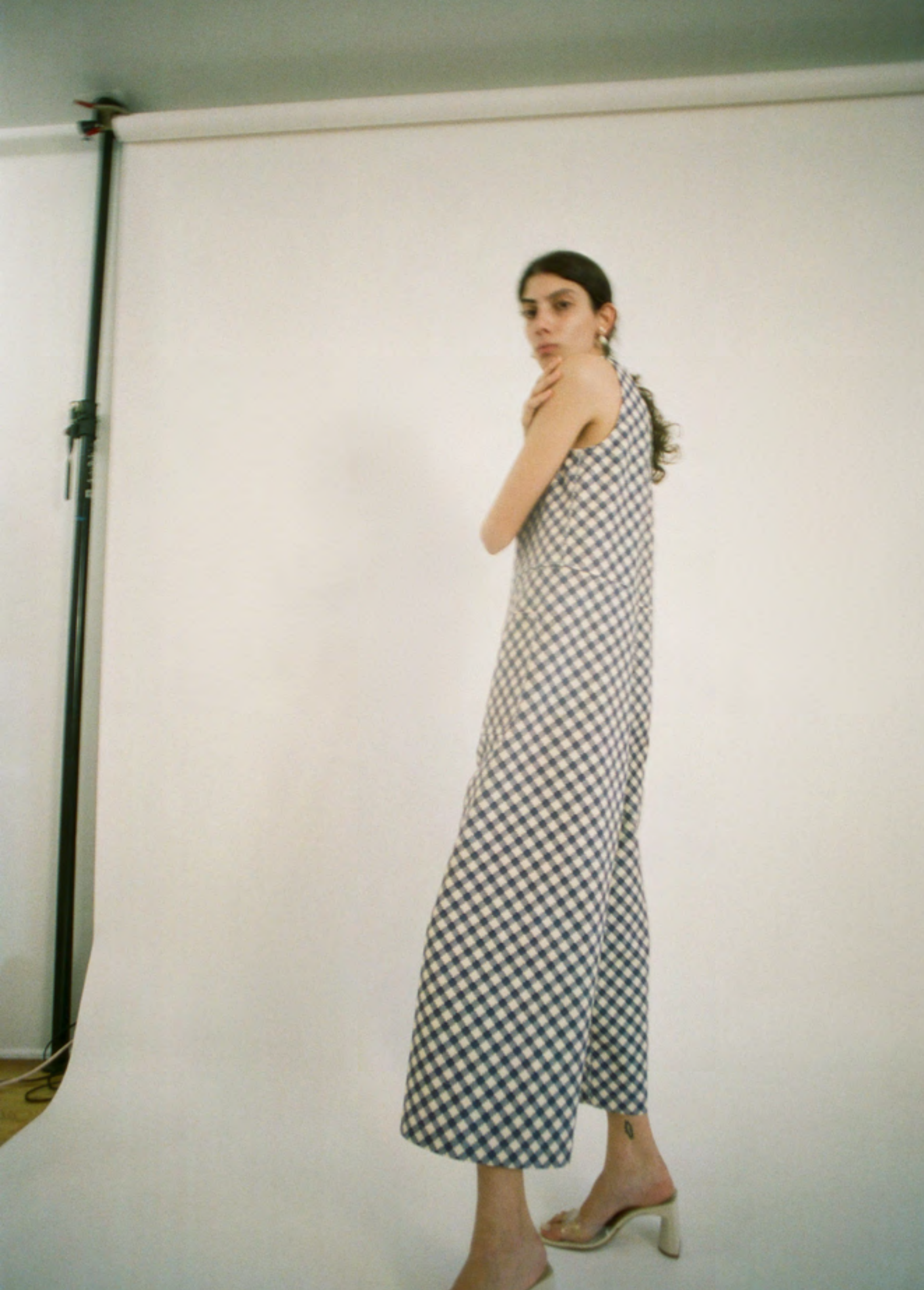
BARNES JUMPSUIT IN NAVY CREME GINGHAM DENIM