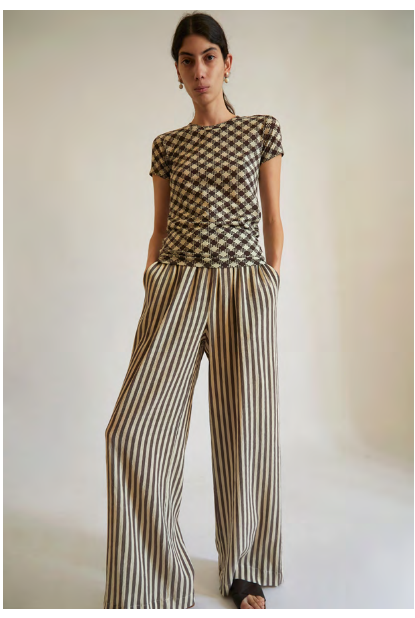
GRACE TEE IN CREAM CHOCOLATE GINGHAM / SUMNER PANT IN MOROCCAN STRIPE