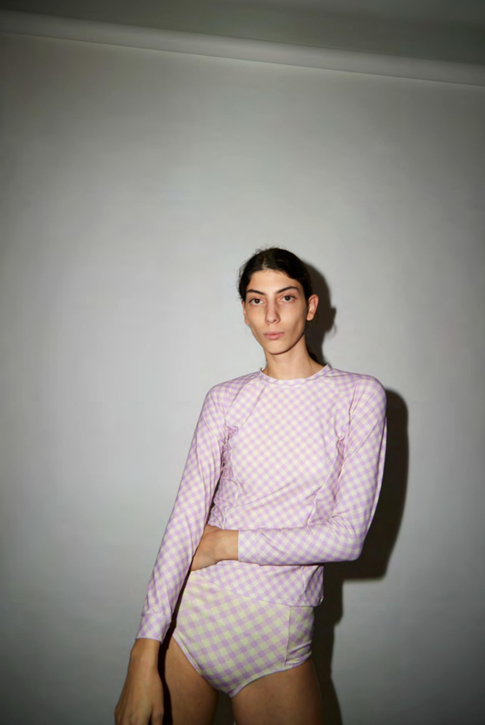
HIRO RASH GUARD IN LILAC GINGHAM / PALOMA BRIEF IN LILAC GINGHAM