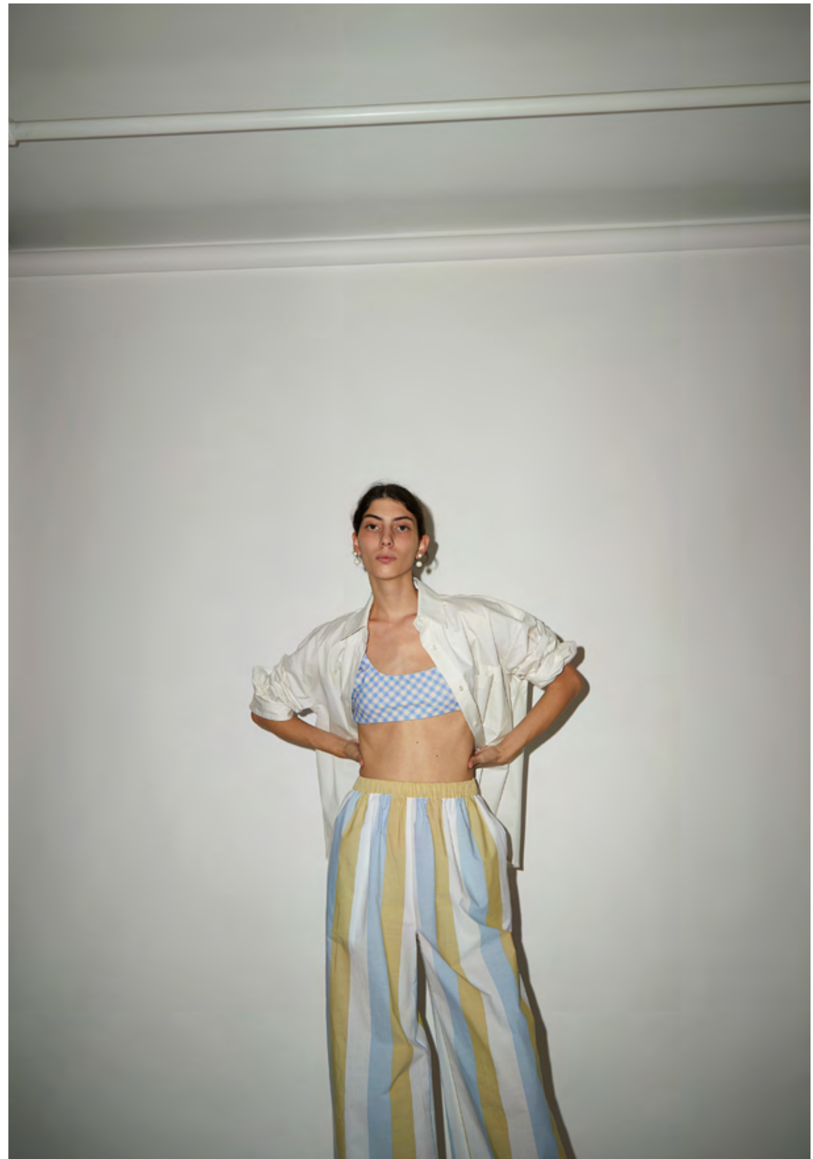
LAKE SHIRT IN WHITE POPLIN / URSULA BIKINI TOP IN POWDER BLUE GINGHAM / SUMNER PANT IN ISLAND STRIPE