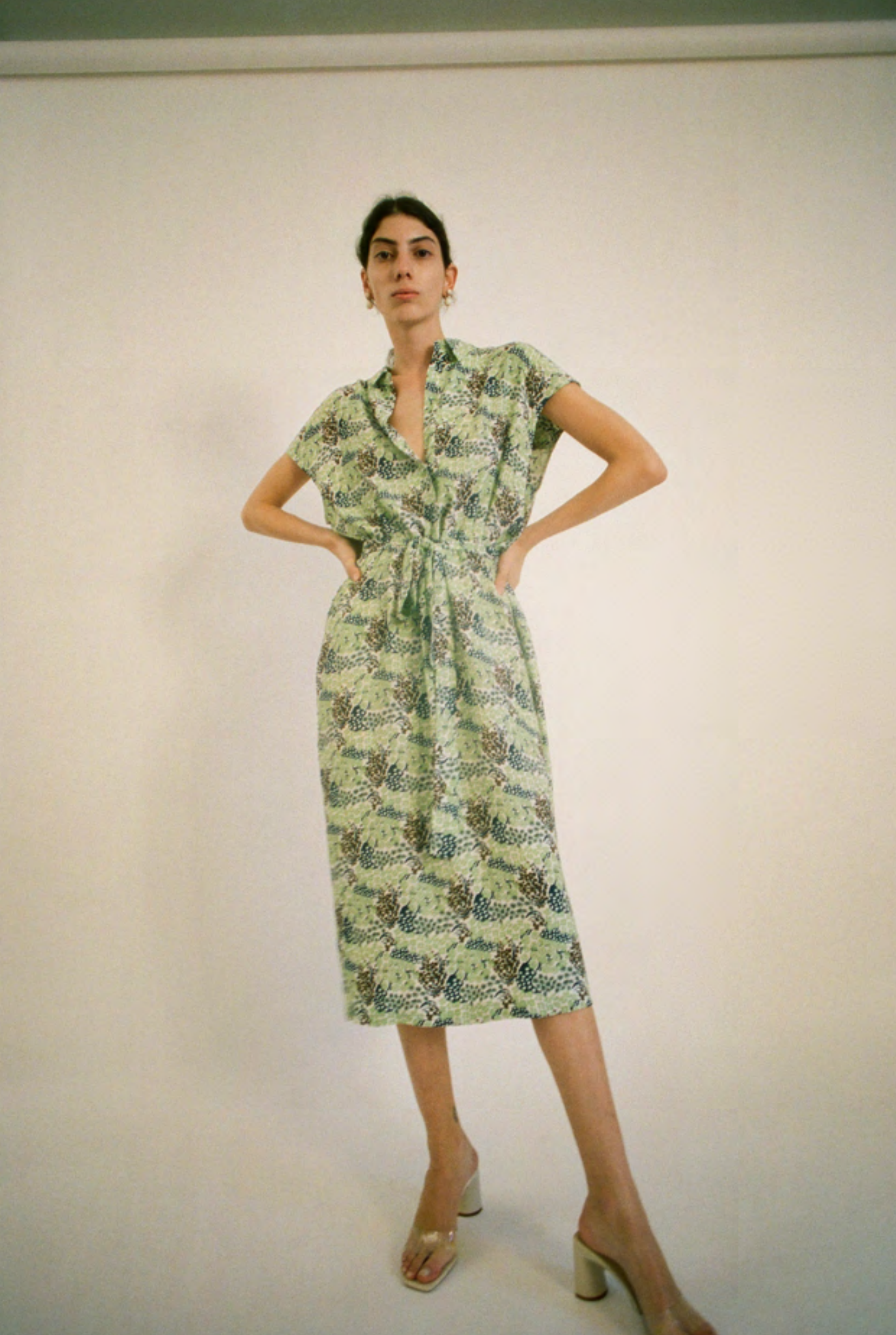
YARA DRESS IN MINT FLORAL CAMO RAYON TWILL