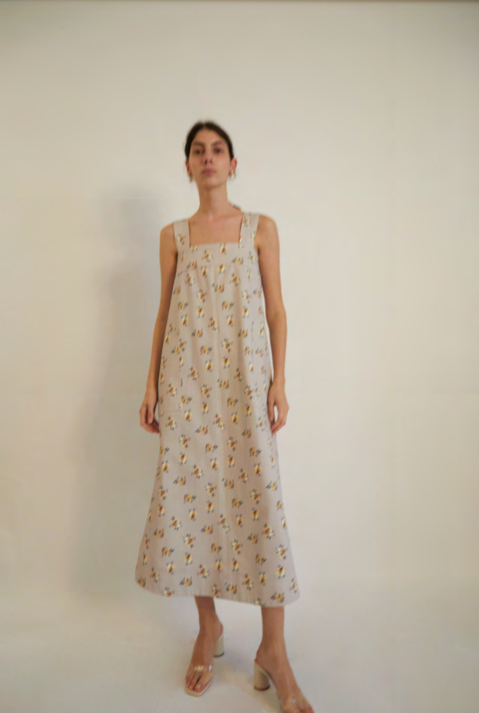
LINN DRESS IN STONE DITSY TWILL