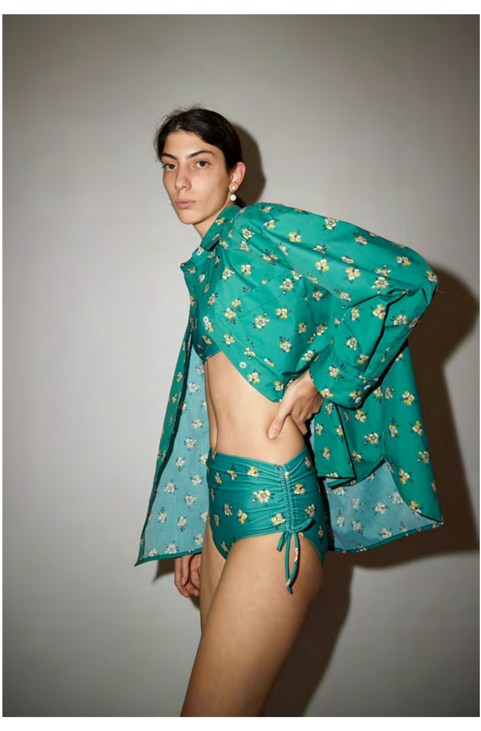
LAKE SHIRT / URSULA BIKINI TOP / CYD BOTTOM - ALL EMERALD DITSY