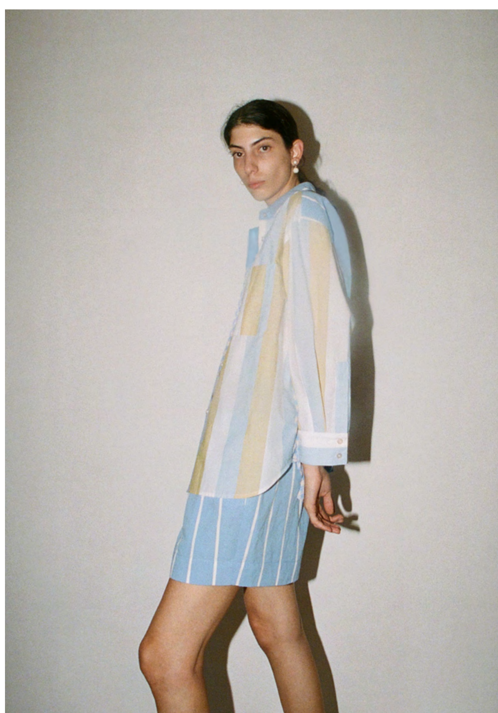
LAKE SHIRT IN ISLAND STRIPE COMBO / VICTOR SHORT IN BLUE STRIPE SHIRTING