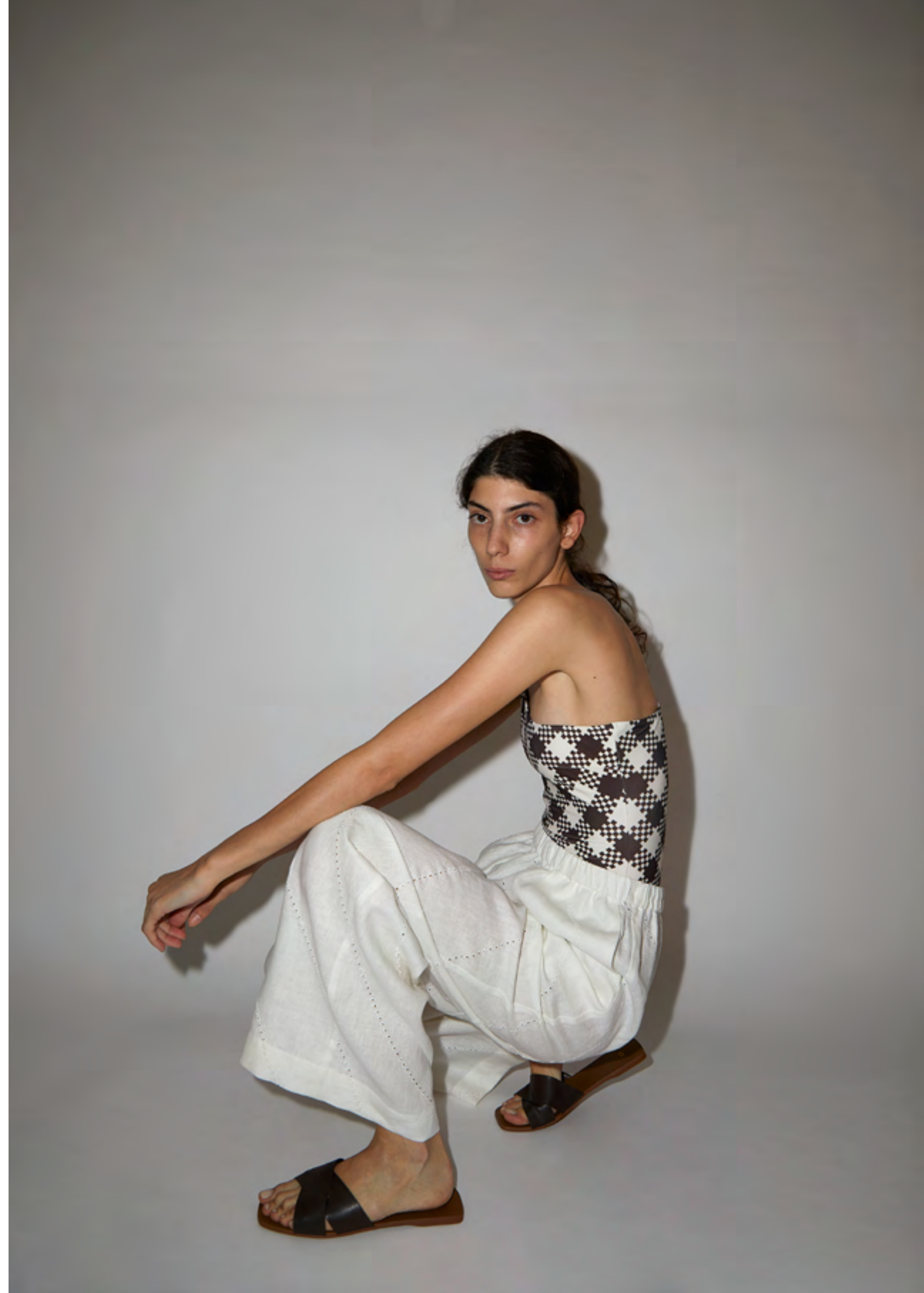
CLAUDIA SWIMSUIT IN CHOCOLATE / CREAM OVERSIZED GINGHAM / SUMNER PANT IN WHITE EYELET LINEN