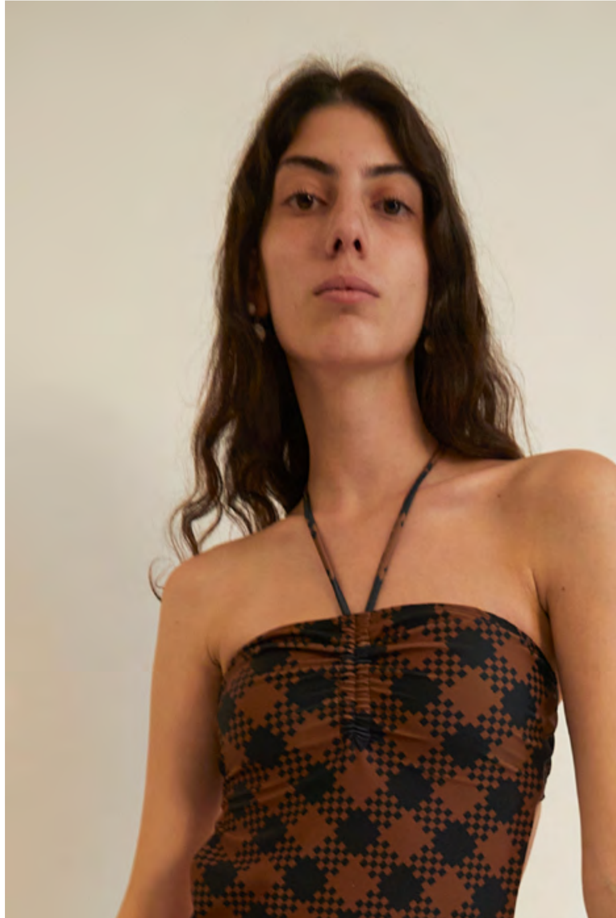
MADDIE SWIMSUIT IN BLACK BROWN OVERSIZED GINGHAM