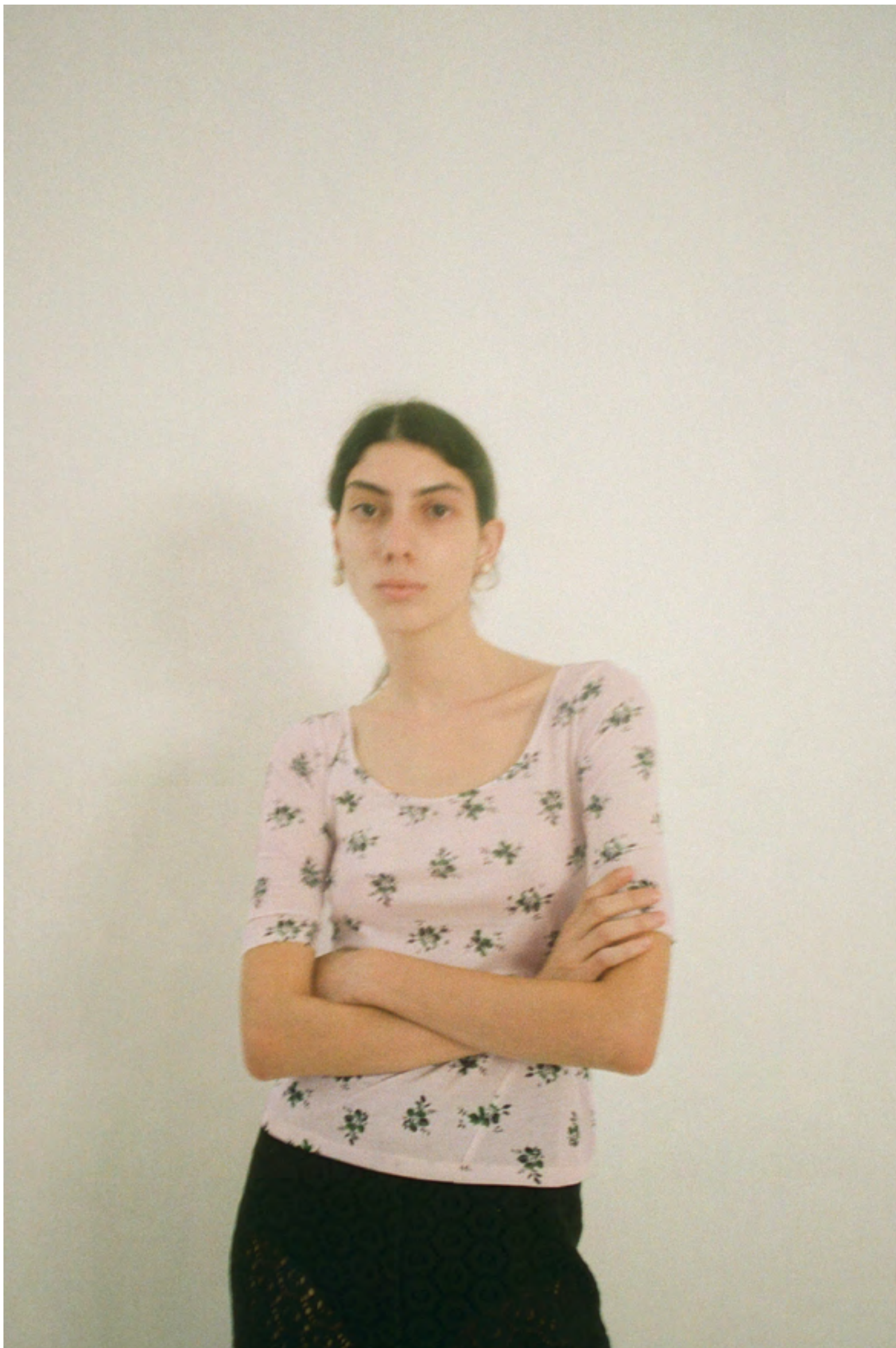
LAUREL TEE IN PINK DITSY