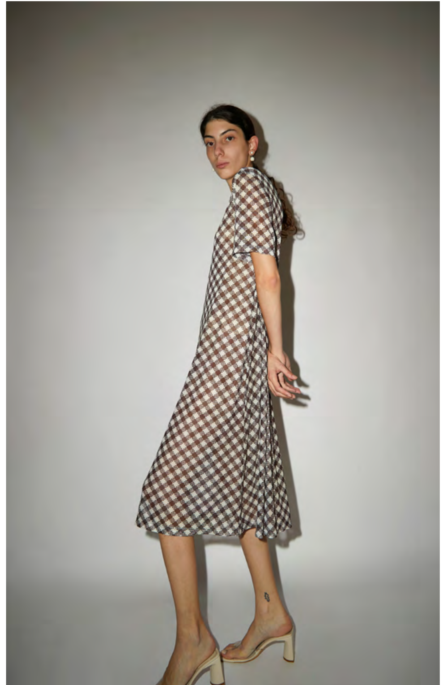
ELLA DRESS IN CHOCOLATE GINGHAM MESH