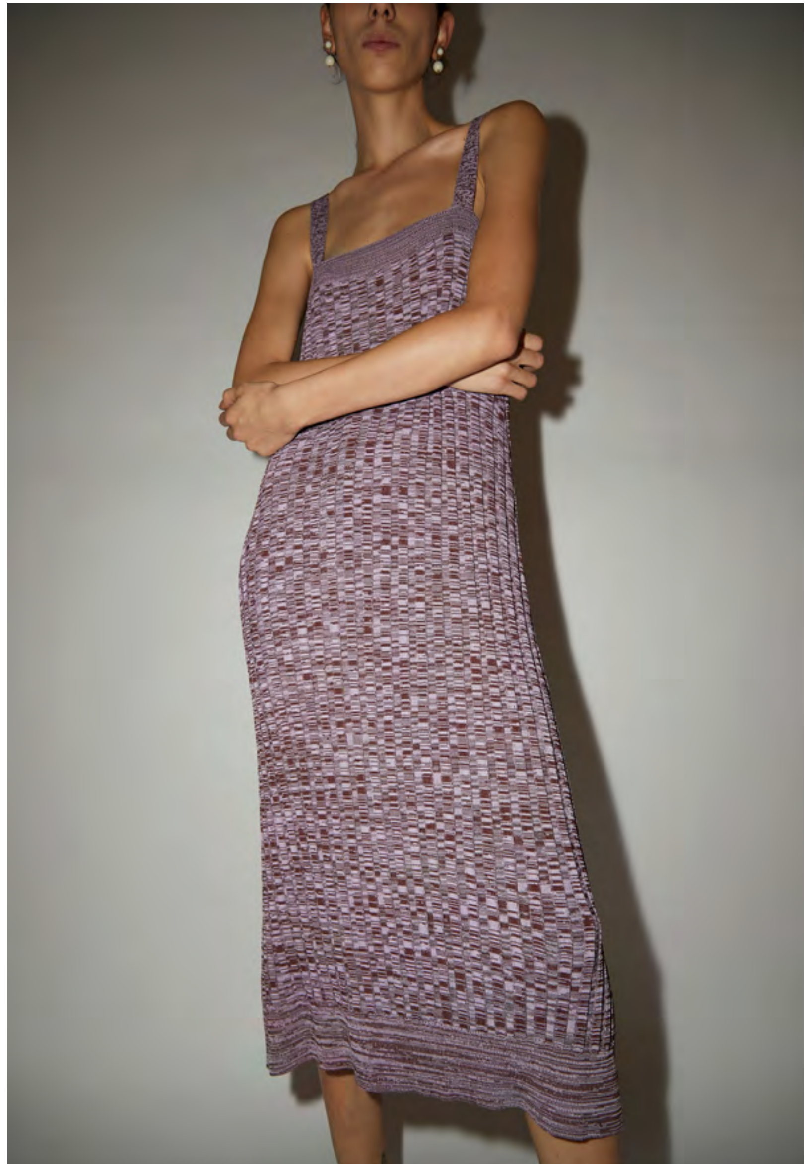
LIV DRESS IN BROWN / BERRY KNIT RIB