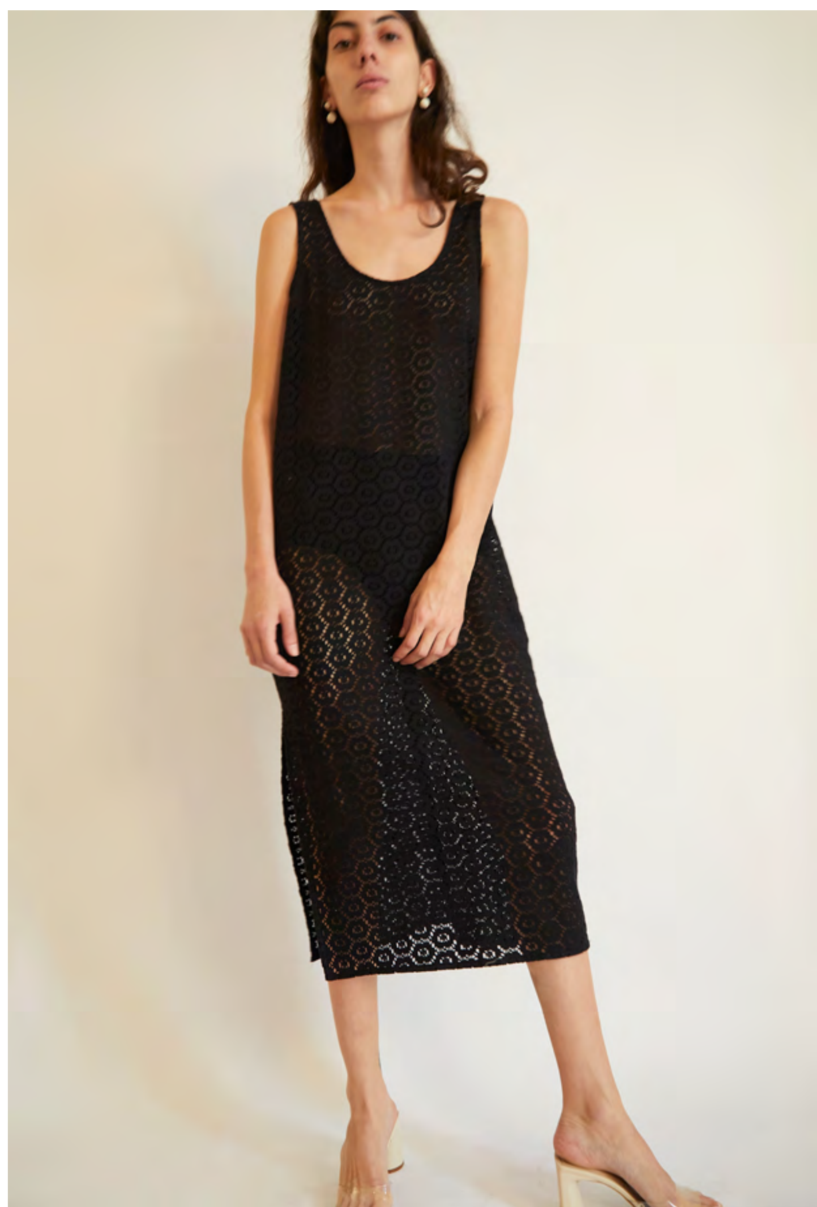
COLUMN DRESS IN BLACK CROCHET