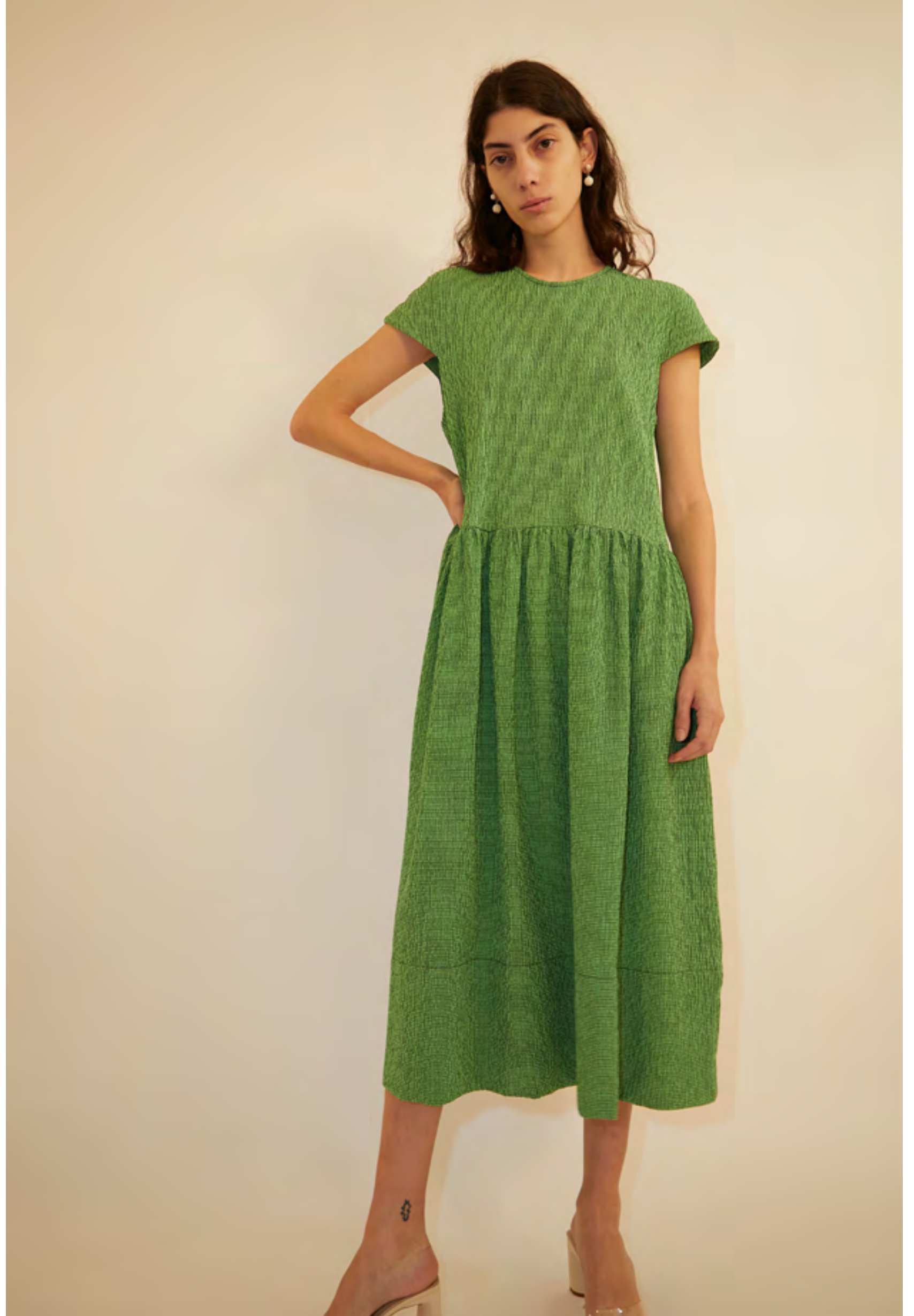
MANN DRESS IN PUCKERED CHECK LIME