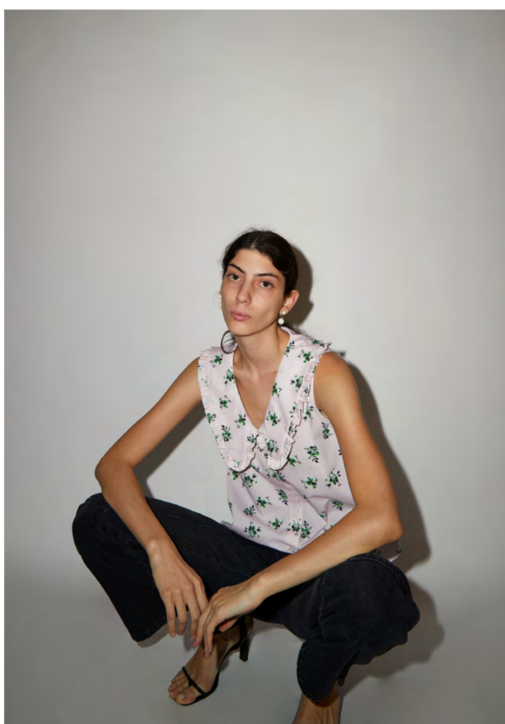
LACEY TOP IN PINK DITSY / JACKSON PANT IN BLACK DENIM