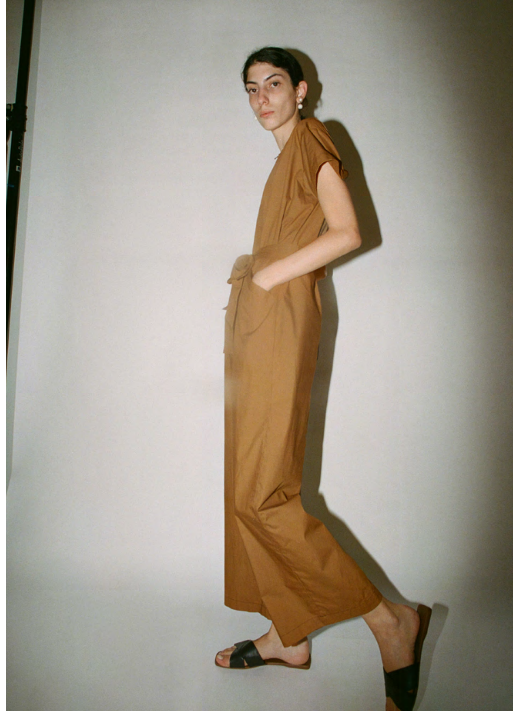
SLATE JUMPSUIT IN KHAKI COTTON POPLIN