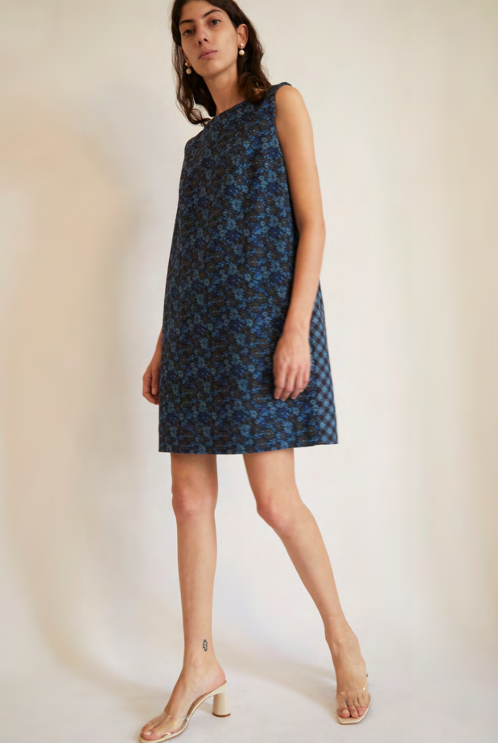
CLAIRE DRESS IN DENIM BLUE DAISIES