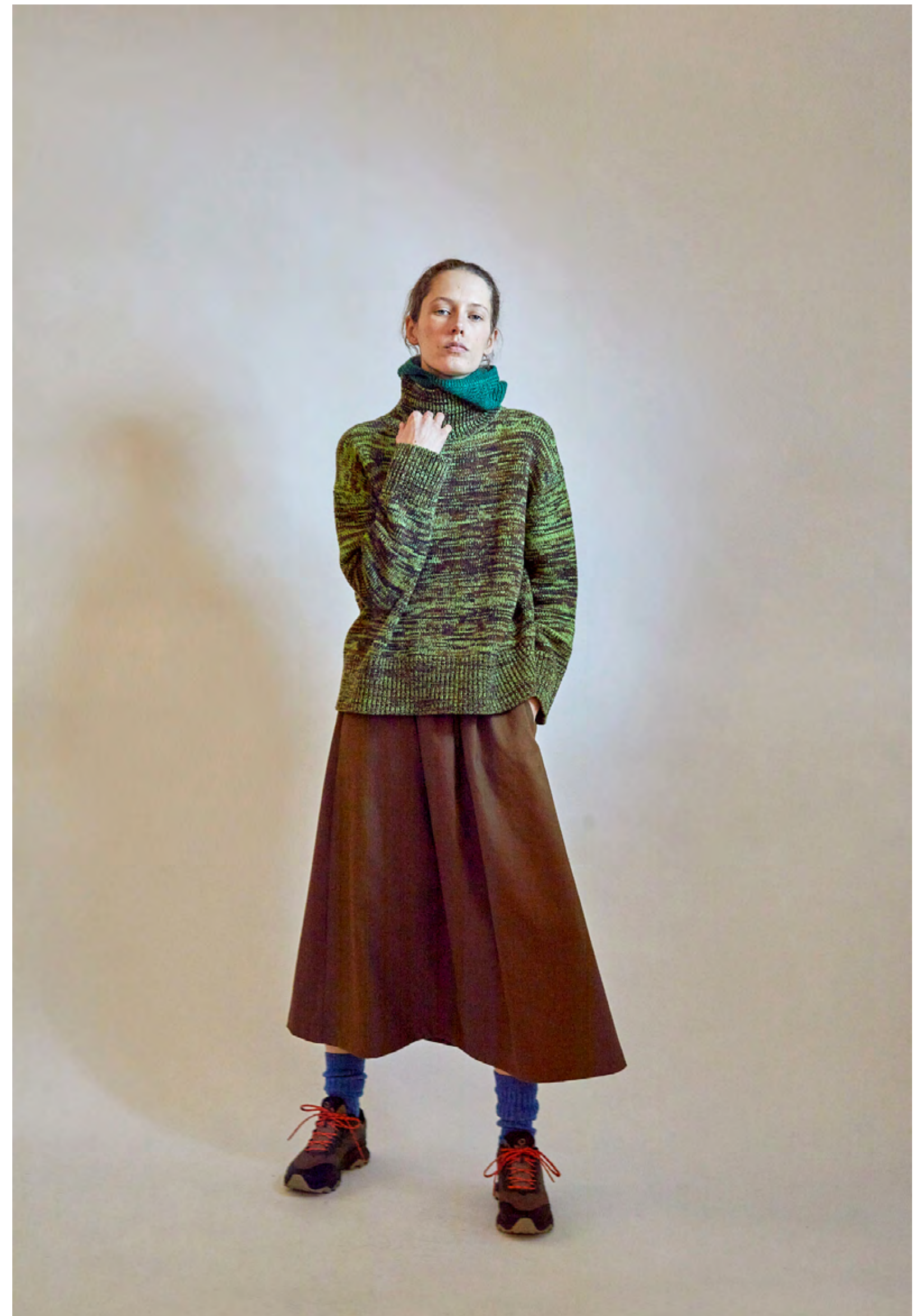
FREDDIE SWEATER IN GREEN MELANGE / CAROLINE SKIRT IN COFFEE / BALACLAVA IN EMERALD