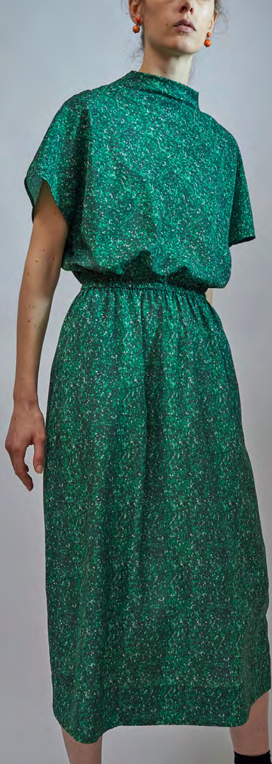
WILLA DRESS IN GREEN GLITTER