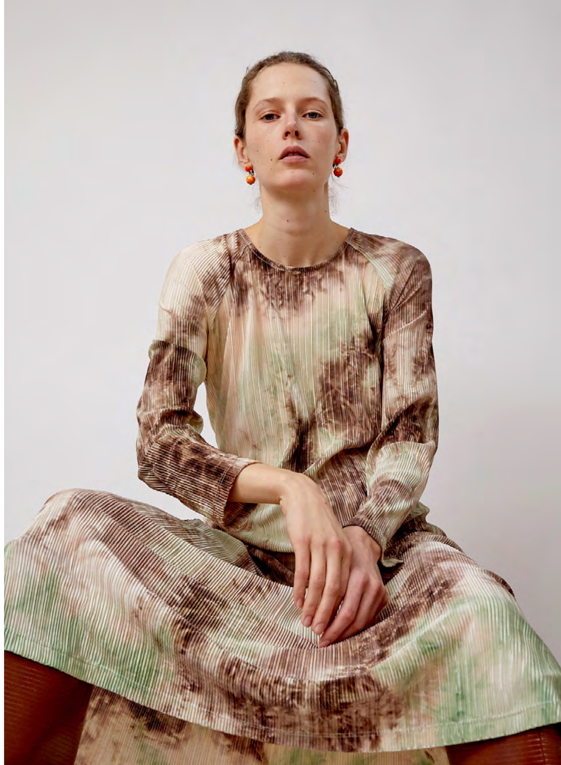
COCO DRESS IN PLEATED BROWN TIE DYE