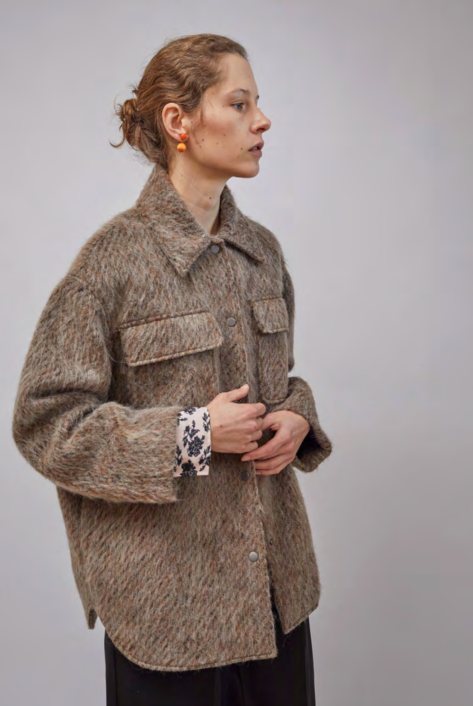
WILSON JACKET IN OAT MOHAIR