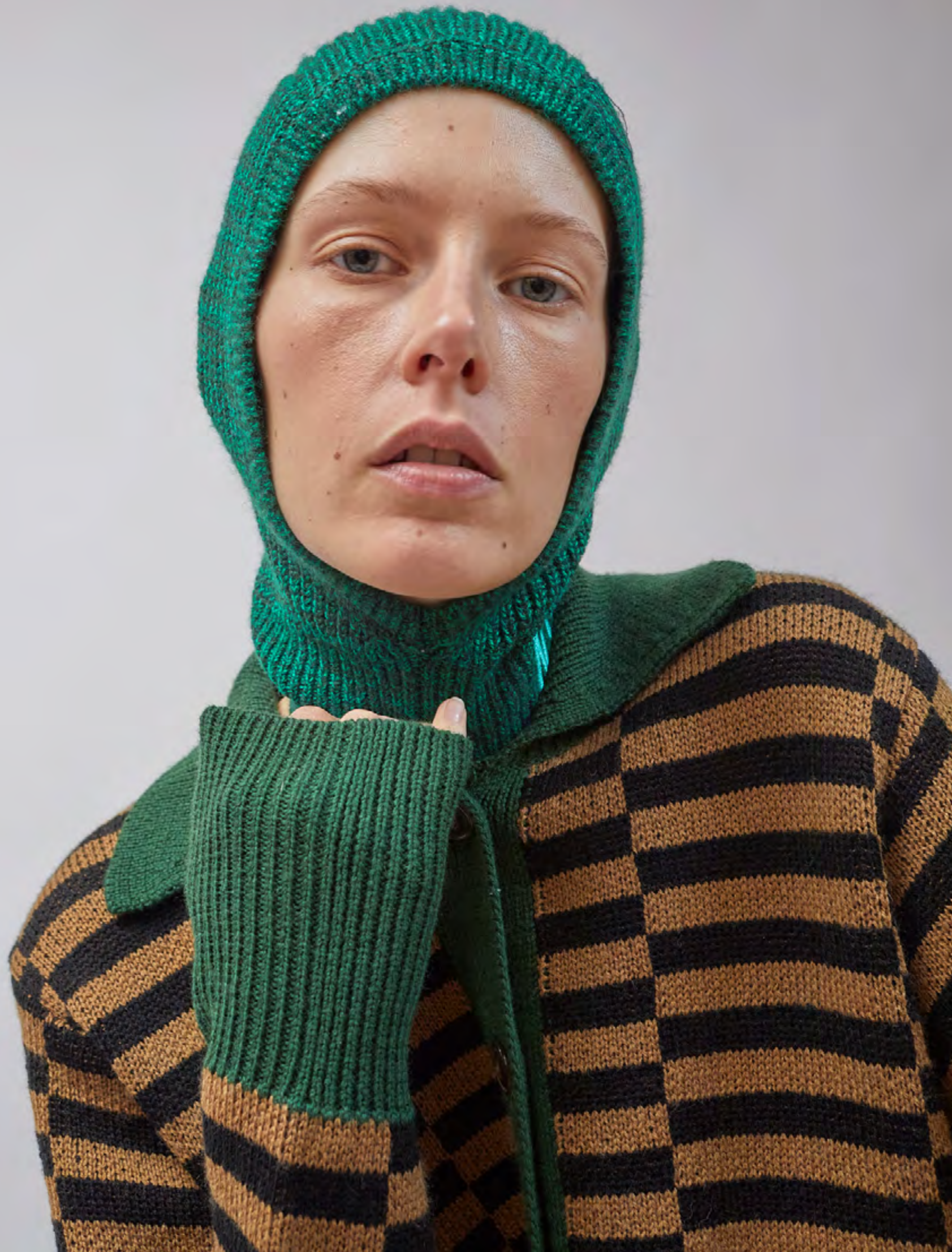
BALACLAVA IN EMERALD / LANE CARDIGAN IN TAN/BLACK STRIPE