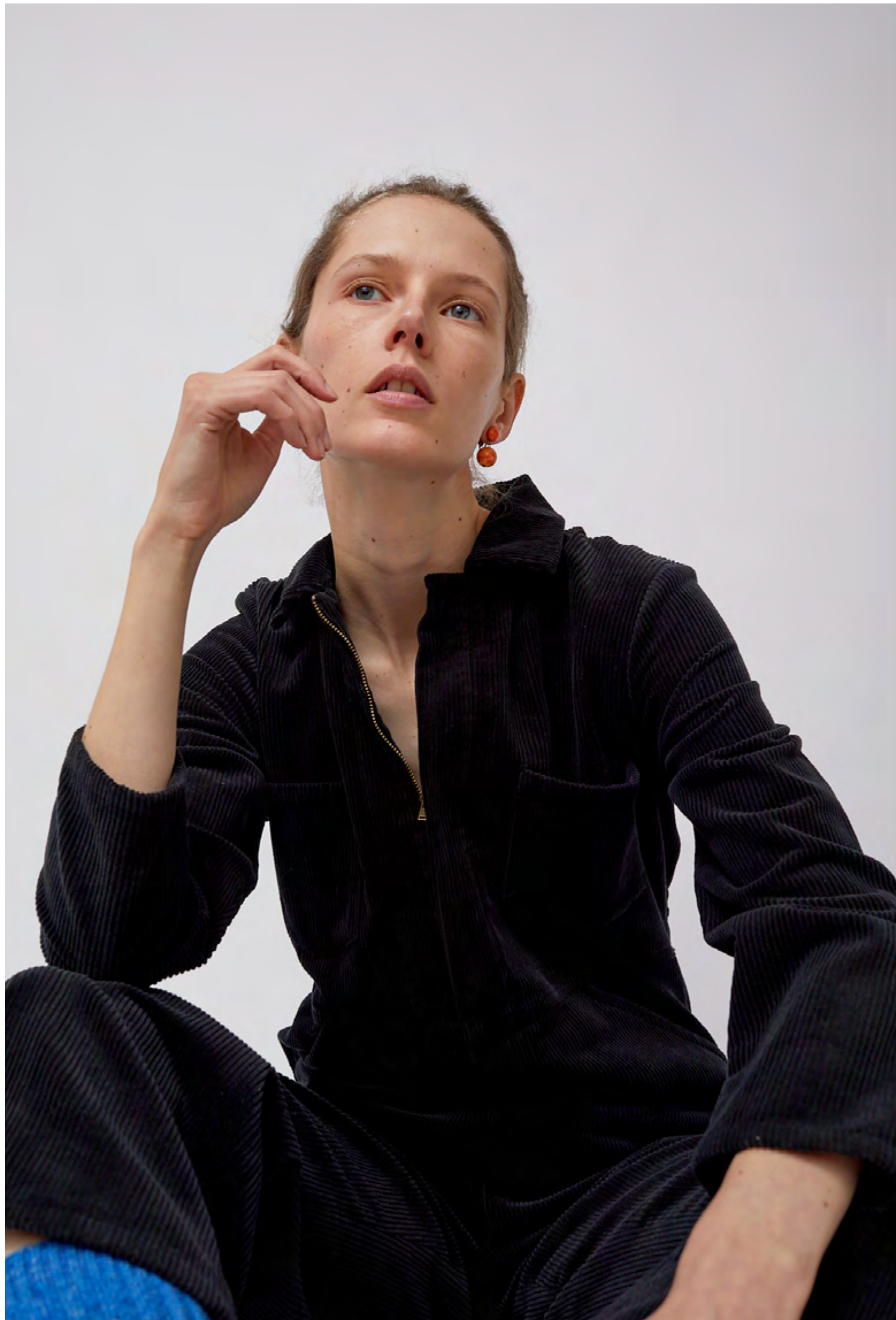
MARLON JUMPSUIT IN MIDNIGHT CORDUROY