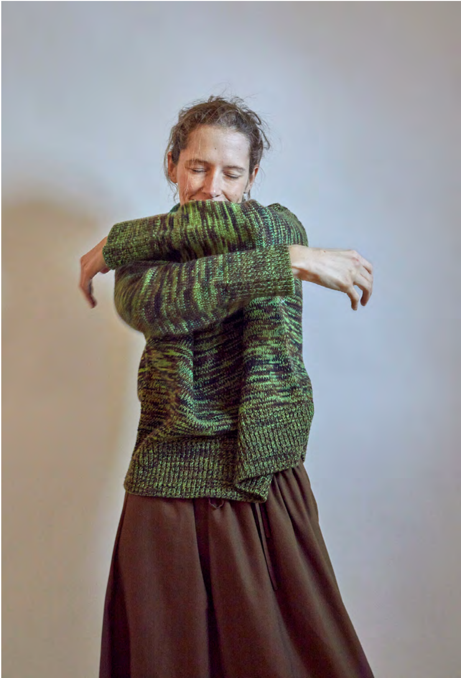
FREDDIE SWEATER IN GREEN MELANGE / CAROLINE SKIRT IN COFFEE