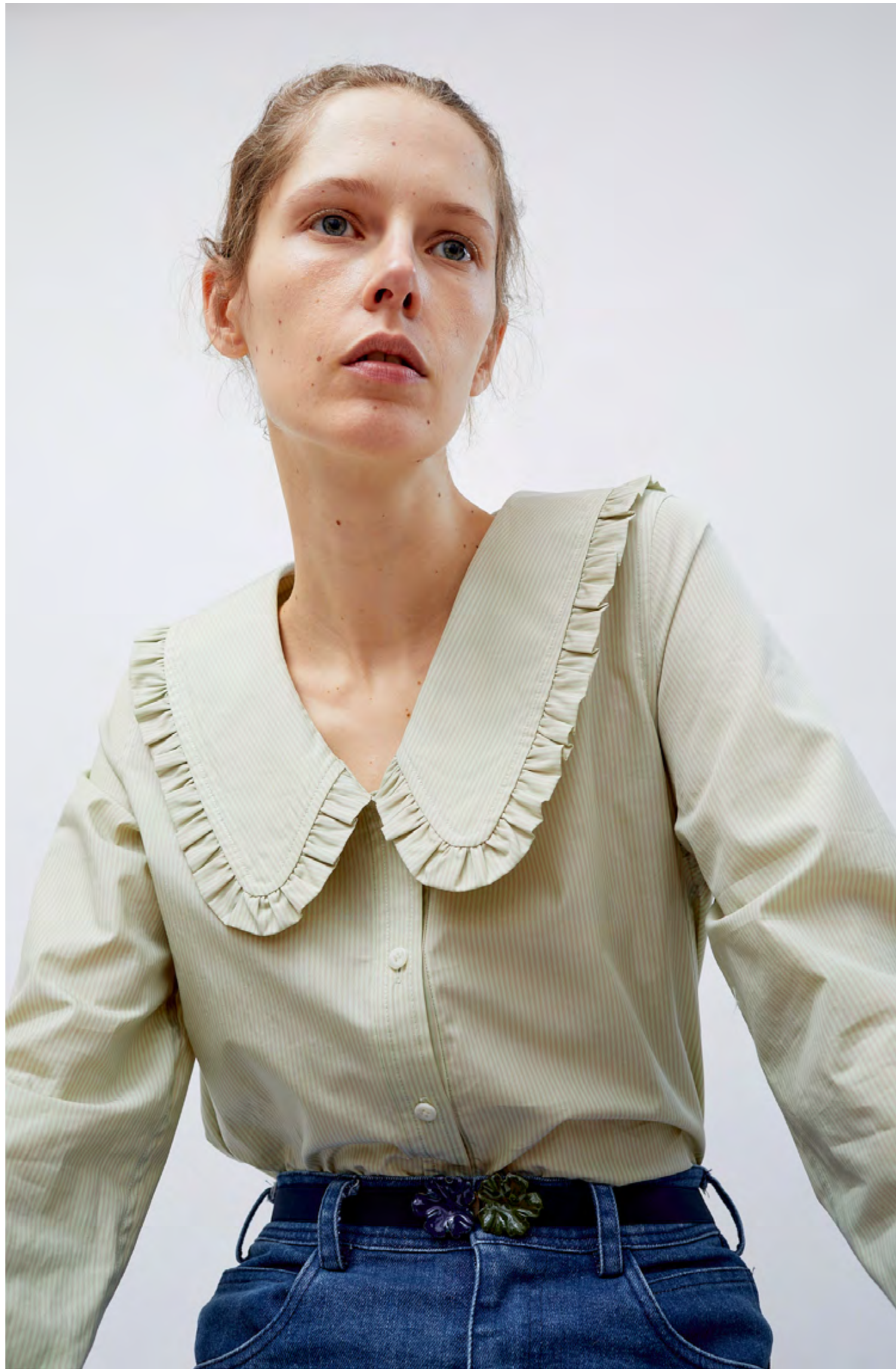
GEM TOP IN MINT STRIPE / MILLER PANT IN BLUE DENIM