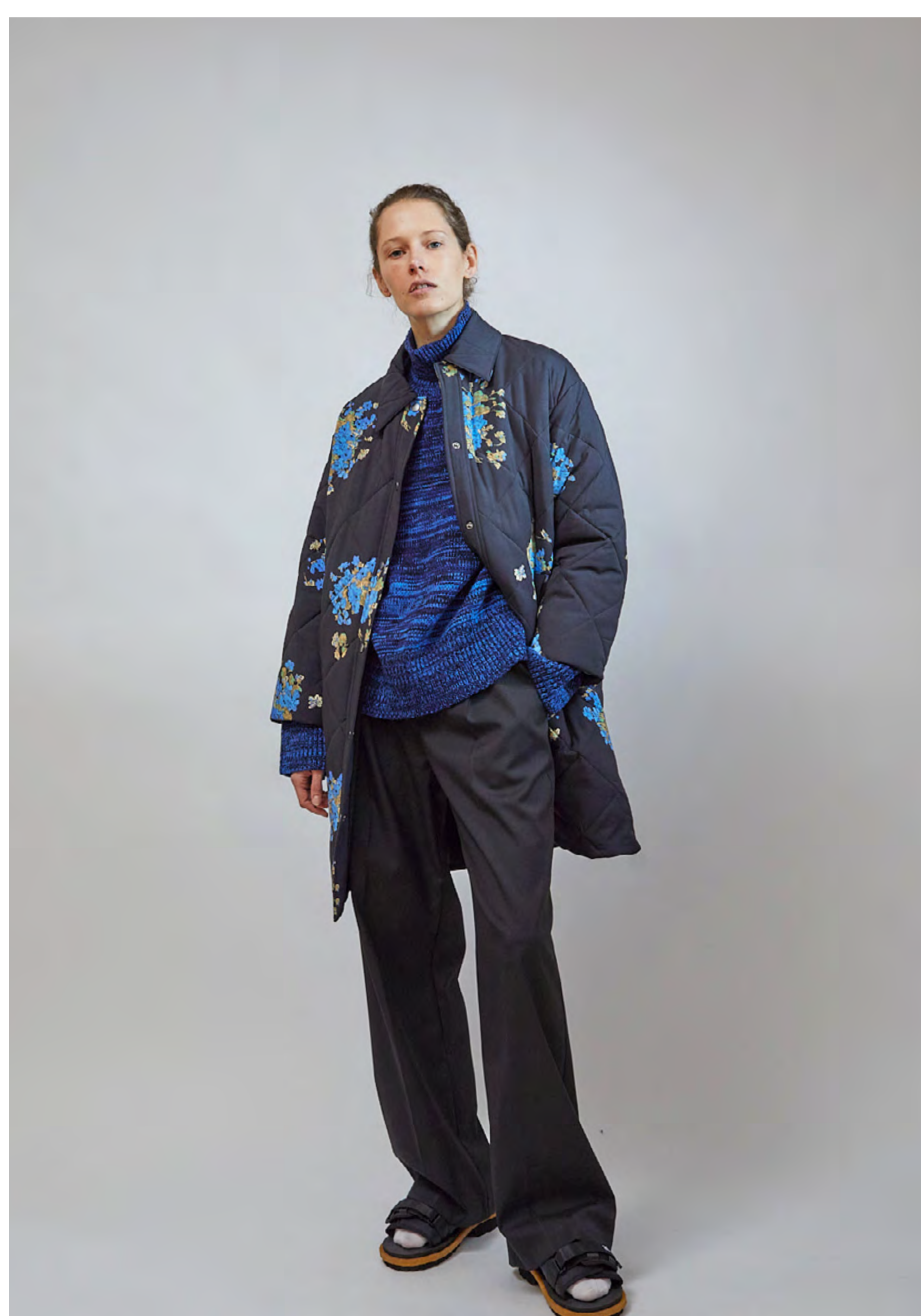
PORTIA COAT IN BLUE CLEMATIS / FREDDIE SWEATER IN BLUE MELANGE / KENT TROUSER IN BLACK