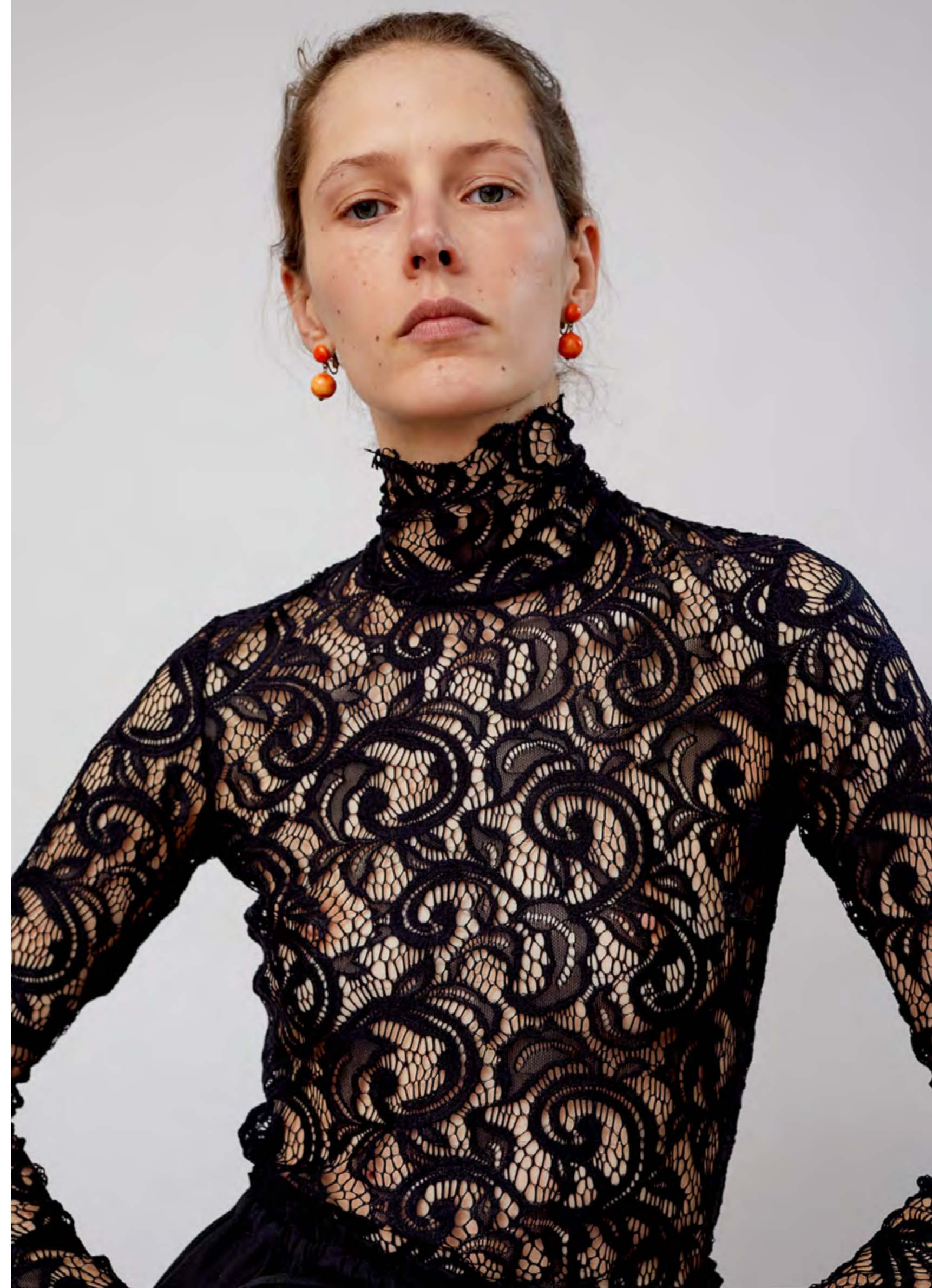
SCOUT TURTLENECK IN BLACK LACE