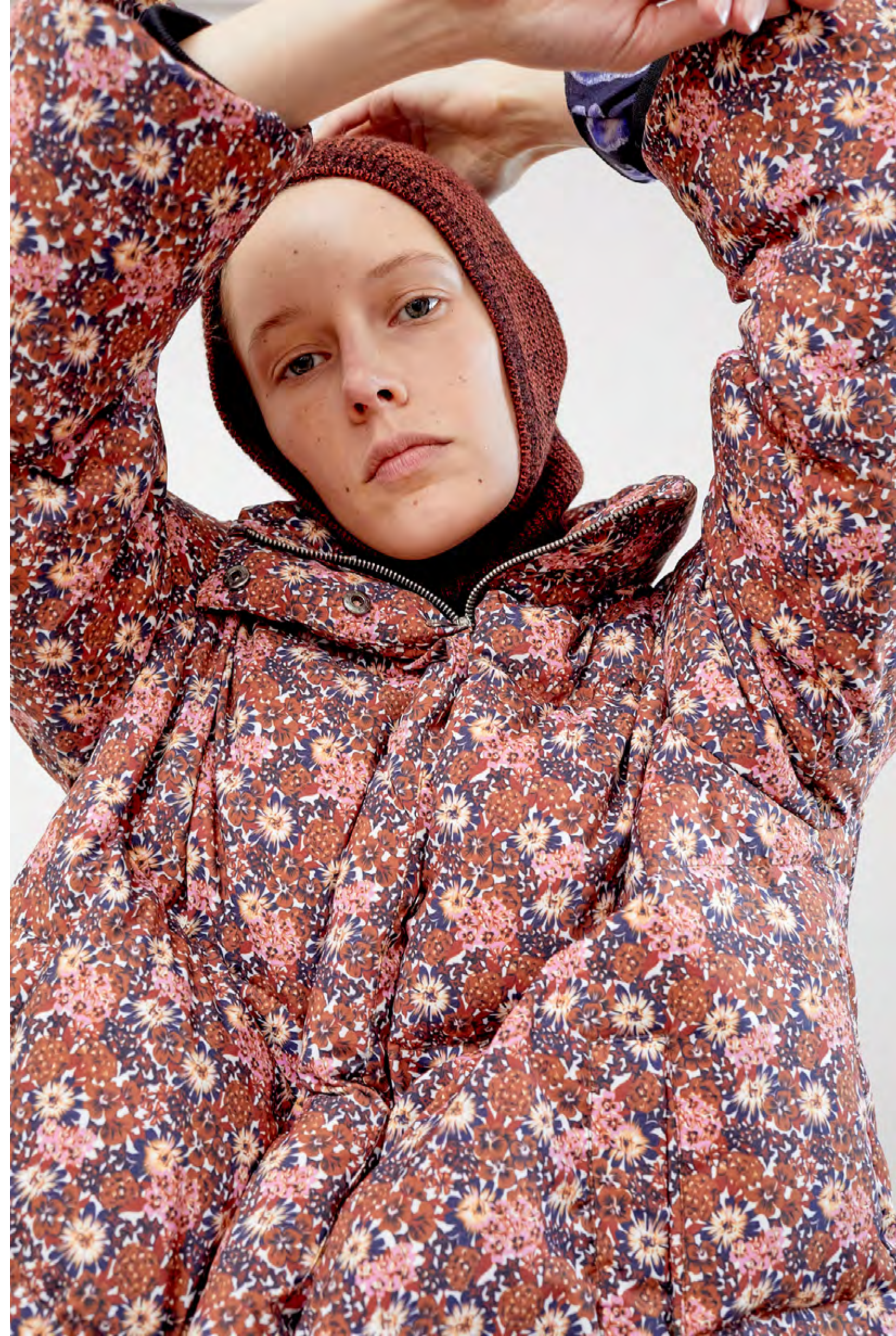
EASTERN PUFFER IN PINK FRENCH FLORAL / BALACLAVA IN SPICE