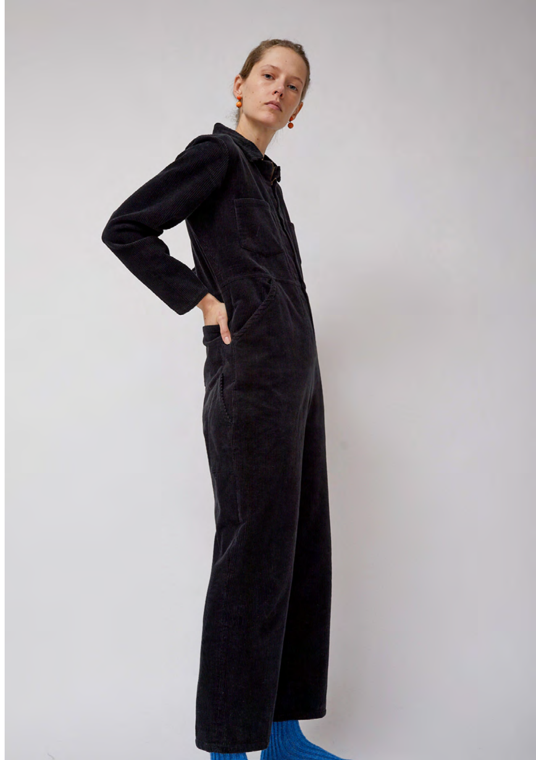
MARLON JUMPSUIT IN MIDNIGHT CORDUROY