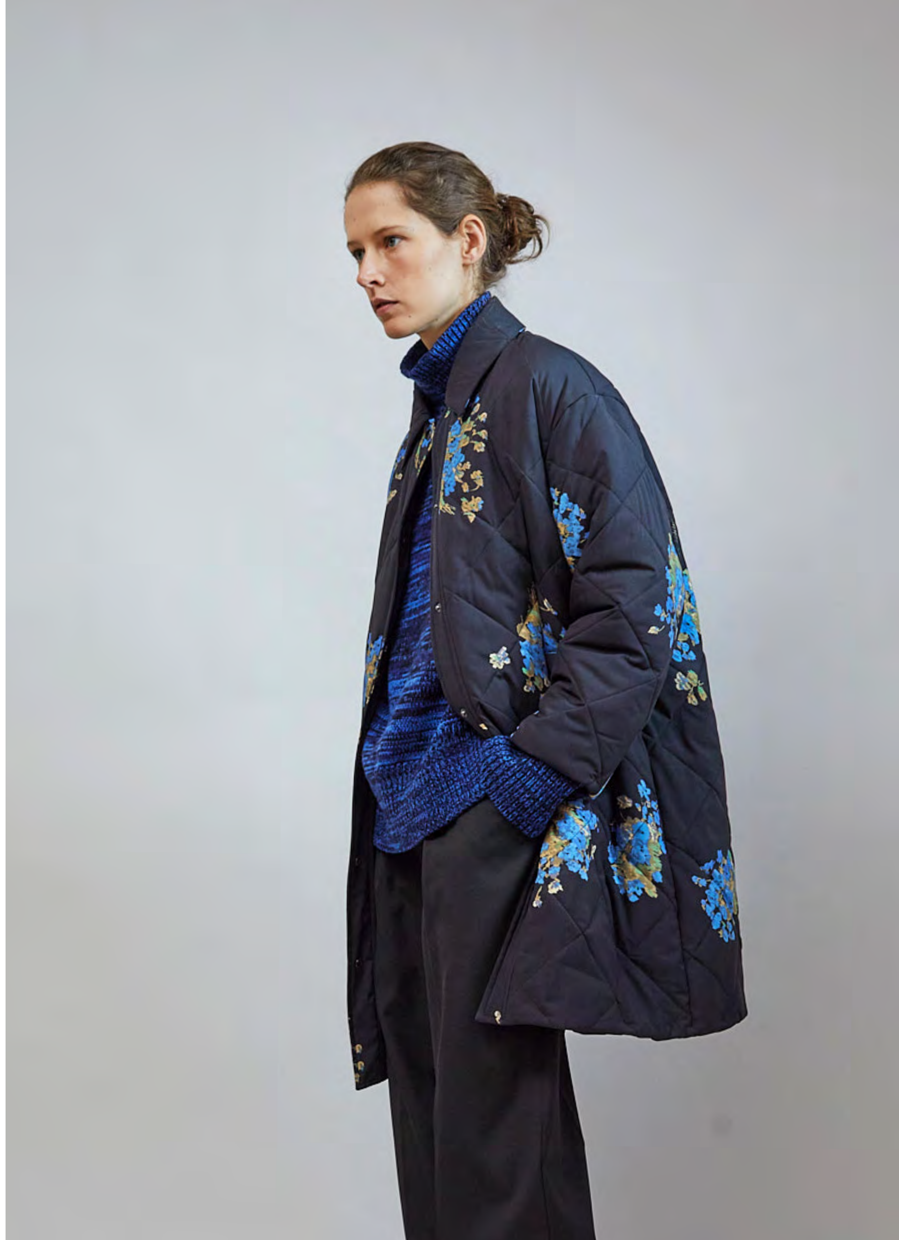
PORTIA COAT IN BLUE CLEMATIS / KENT TROUSER IN BLACK