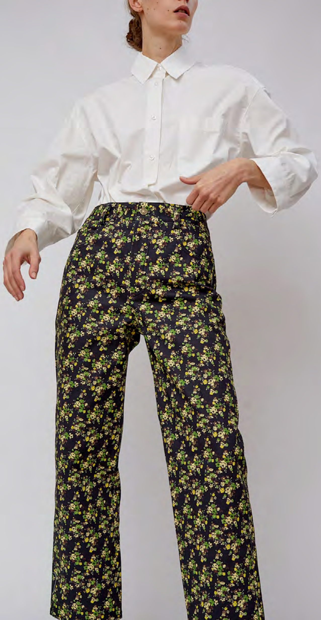
LAKE SHIRT IN WHITE / AGATHA PANT IN BLACK FLORAL BOUQUET