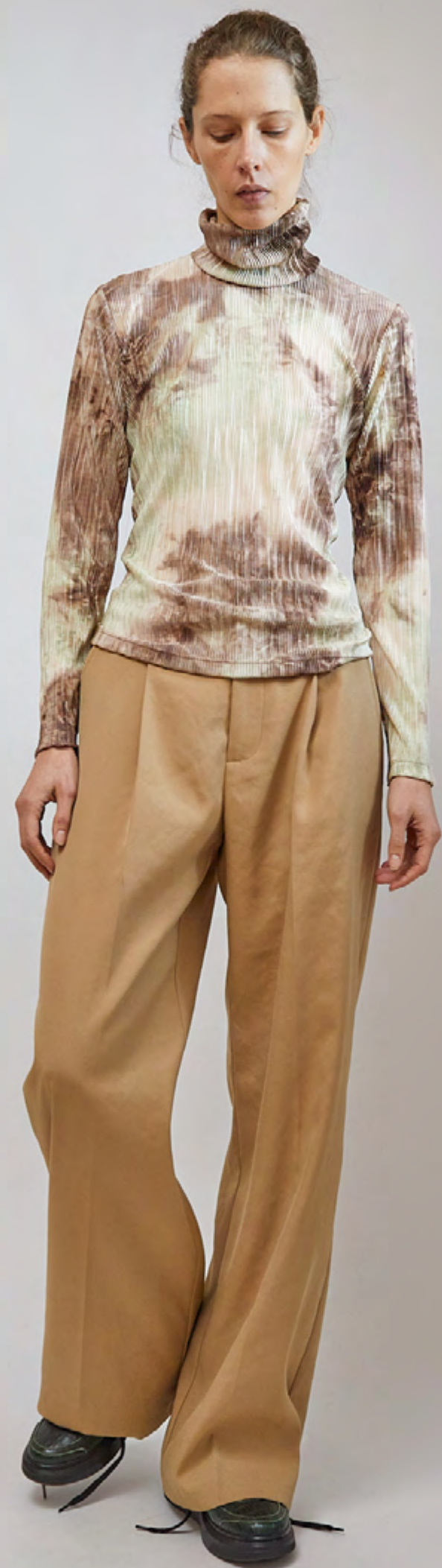
SCOUT TURTLENECK IN PLEATED BROWN TIE DYE / KENT TROUSER IN KHAKE