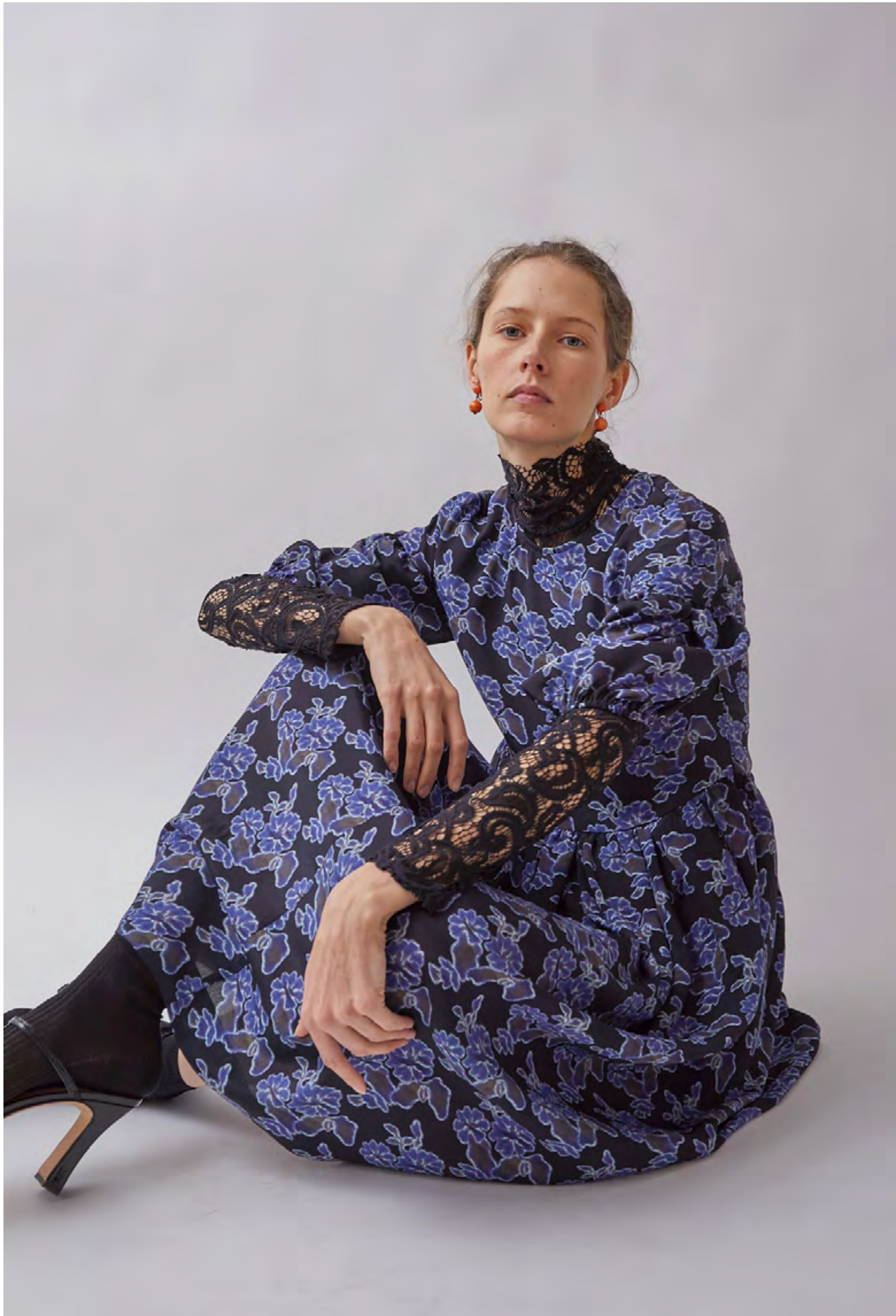
FRANCIS DRESS IN BLUE/BLACK CAMELLIA / SCOUT TURTLENECK IN BLACK LACE