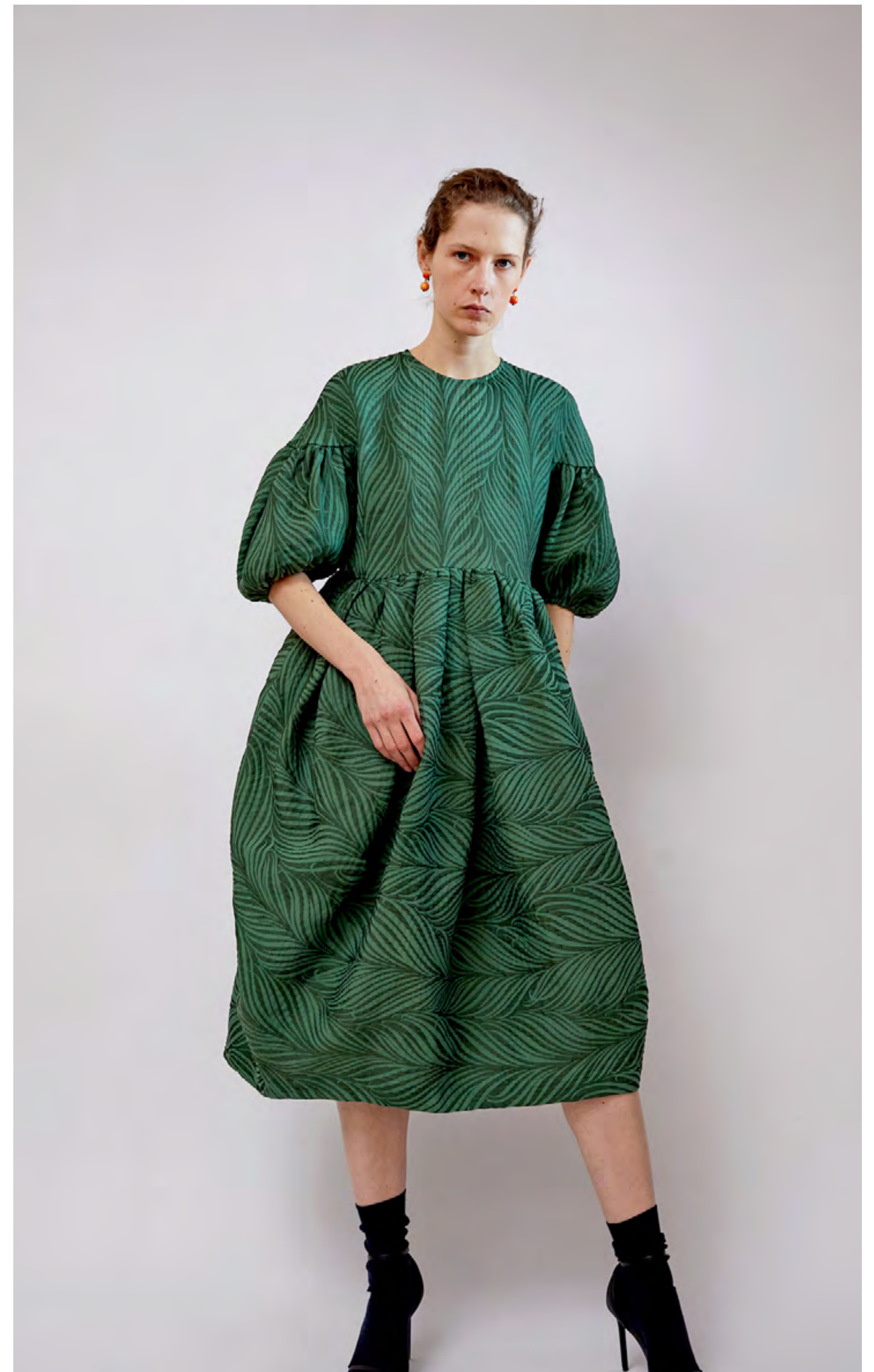
FRANCIS DRESS IN EMERALD BAMBOO