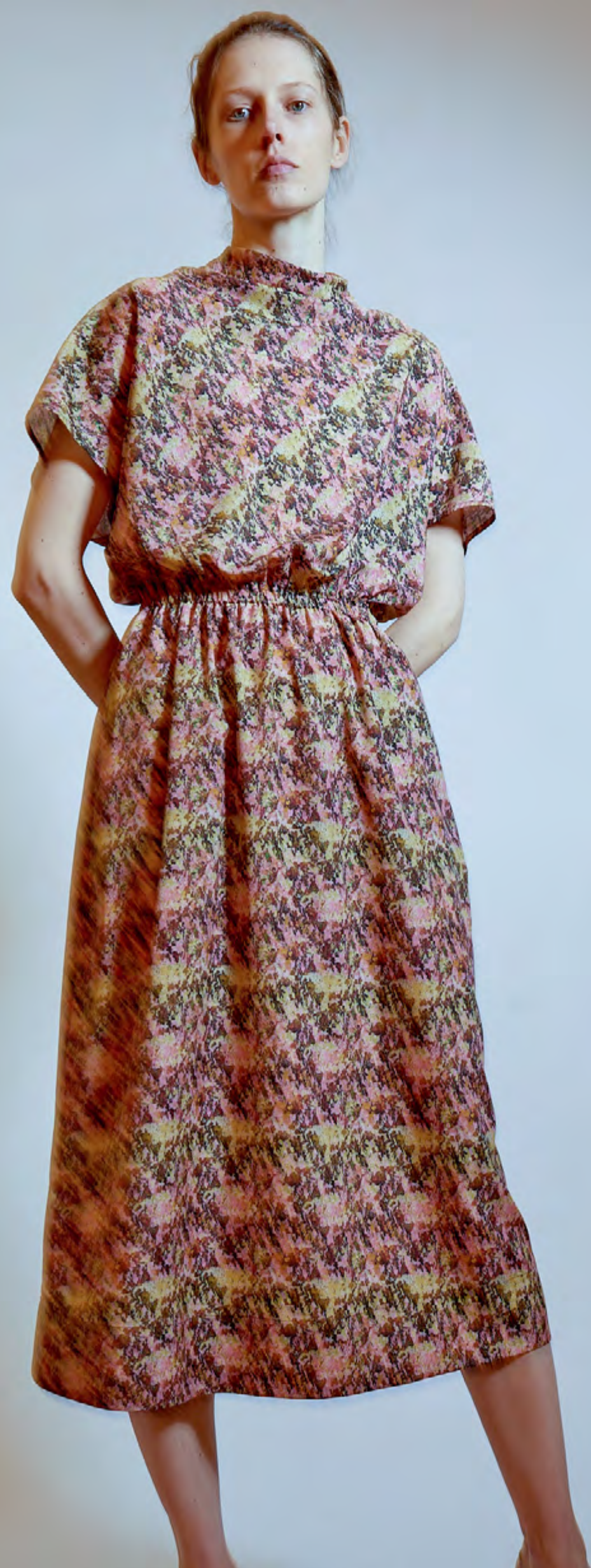
WILLA DRESS IN DESERT COSMOS