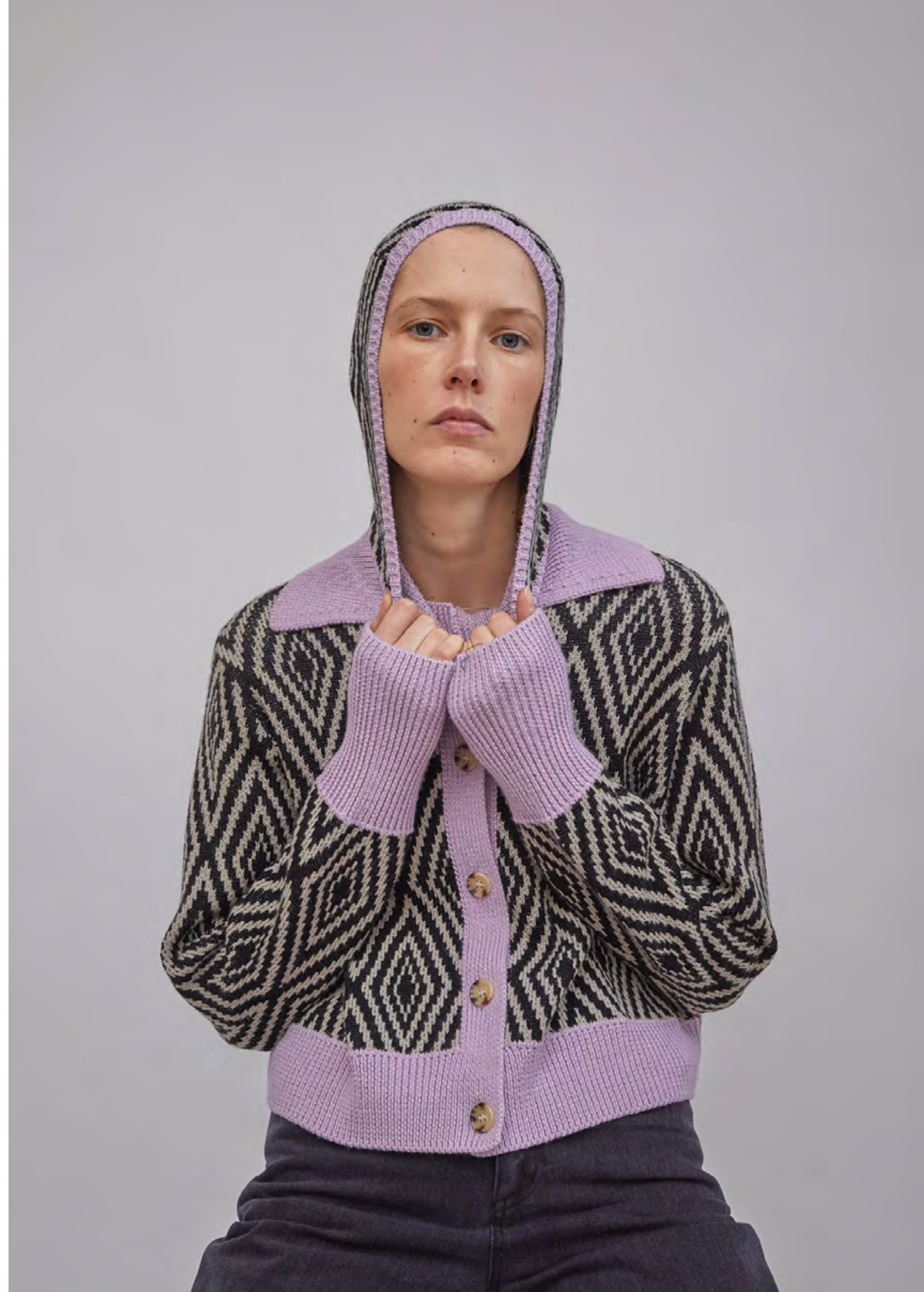
BALACLAVA AND LANE CARDIGAN IN LILAC DIAMOND