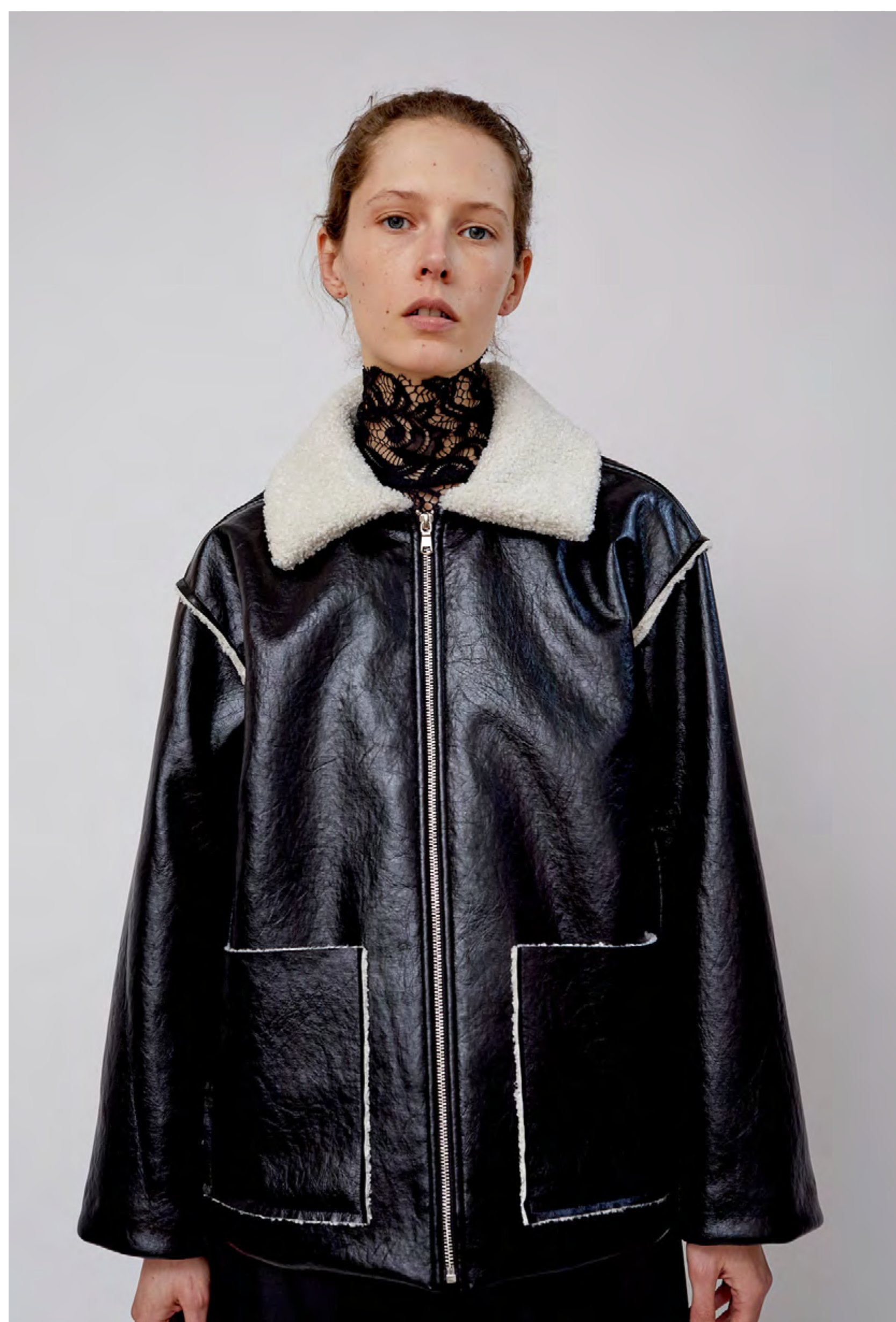
STEVE JACKET IN VEGAN LEATHER