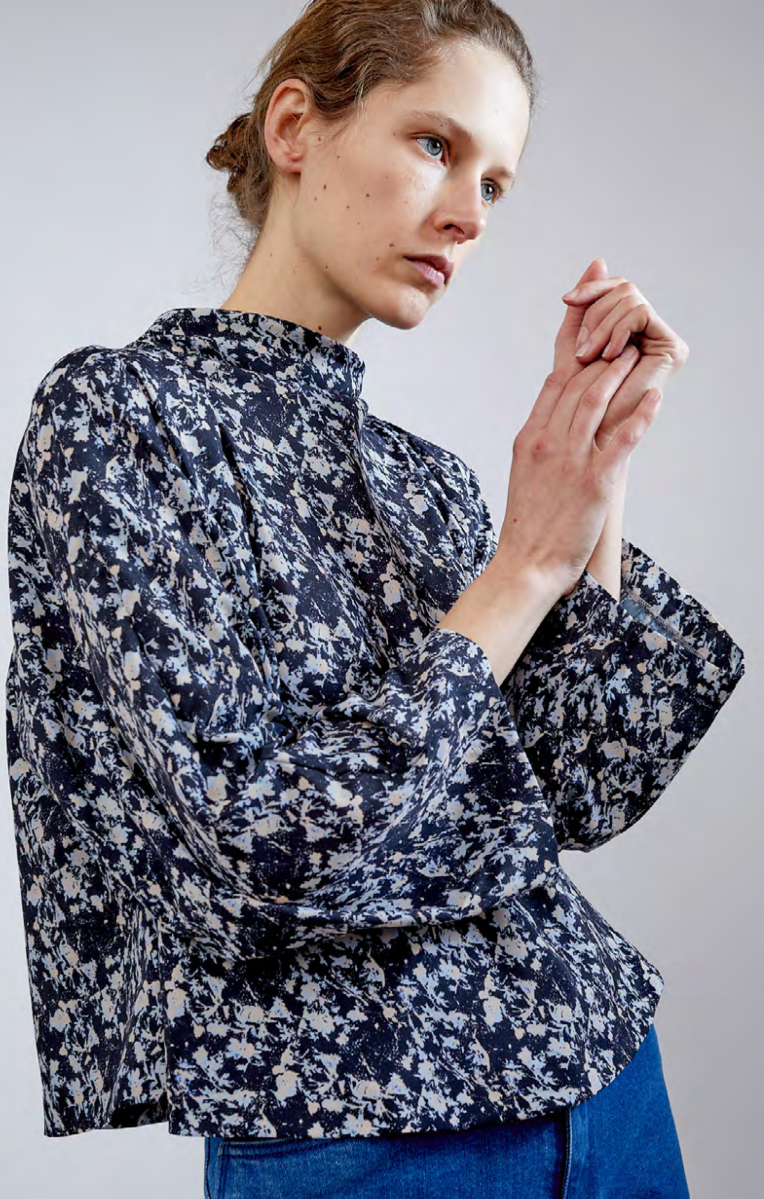
LARA COWL NECK TOP IN BLACK COSMOS