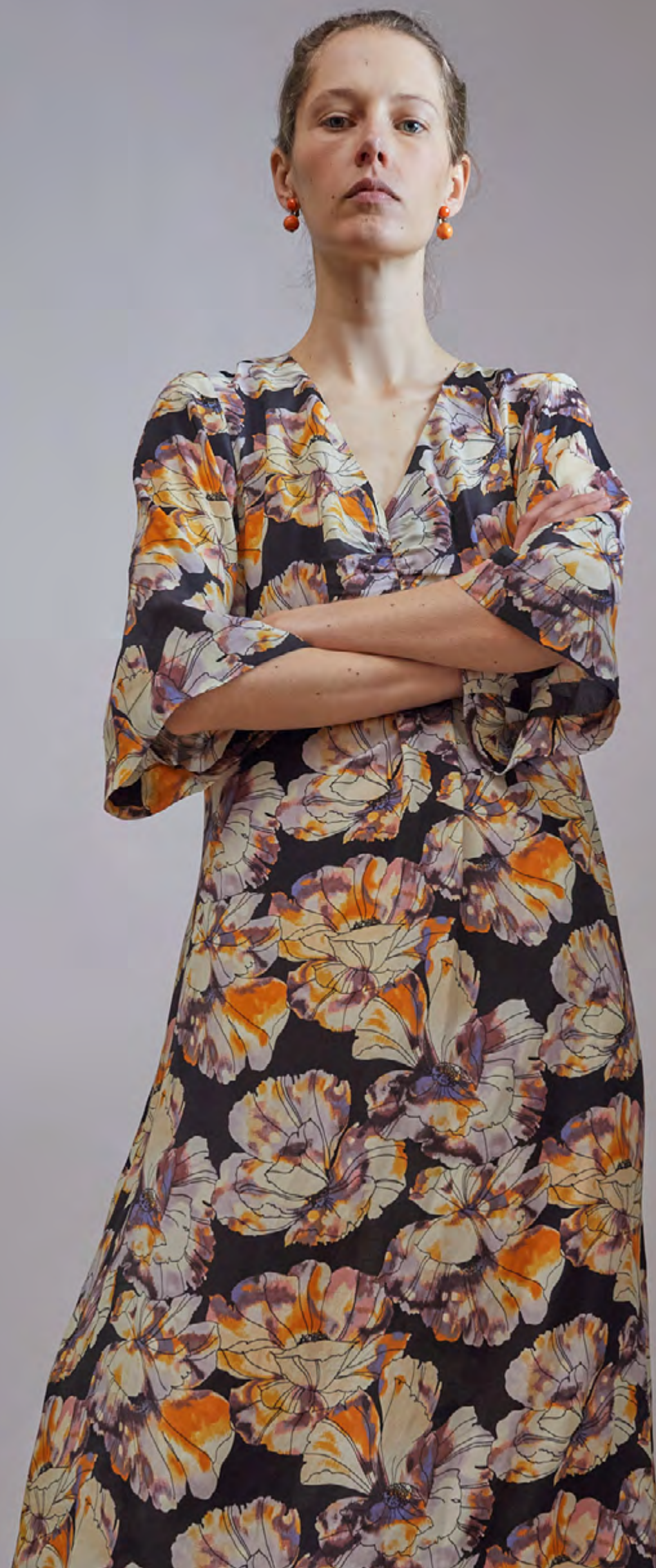
SIENA DRESS IN BLACK WATERCOLOR FLORAL