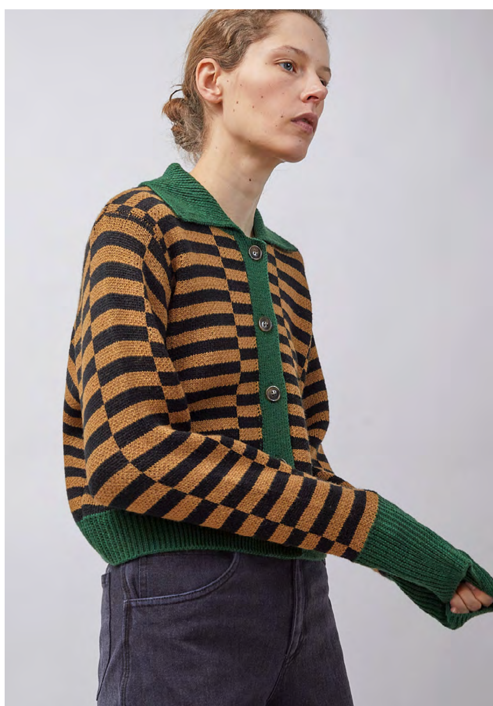
LANE CARDIGAN IN TAN/BLACK STRIPE / MILLER PANT IN SMOKE DENIM