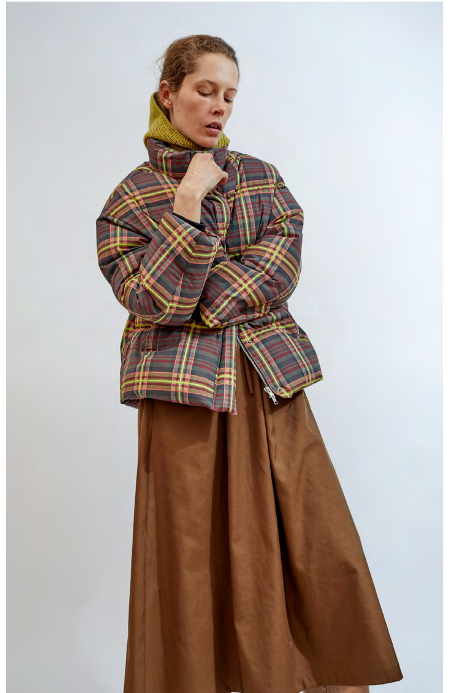
EASTERN PUFFER IN HUNTER PLAID / CAROLINE SKIRT IN COFFEE / BALACLAVA IN CHARTREUSE