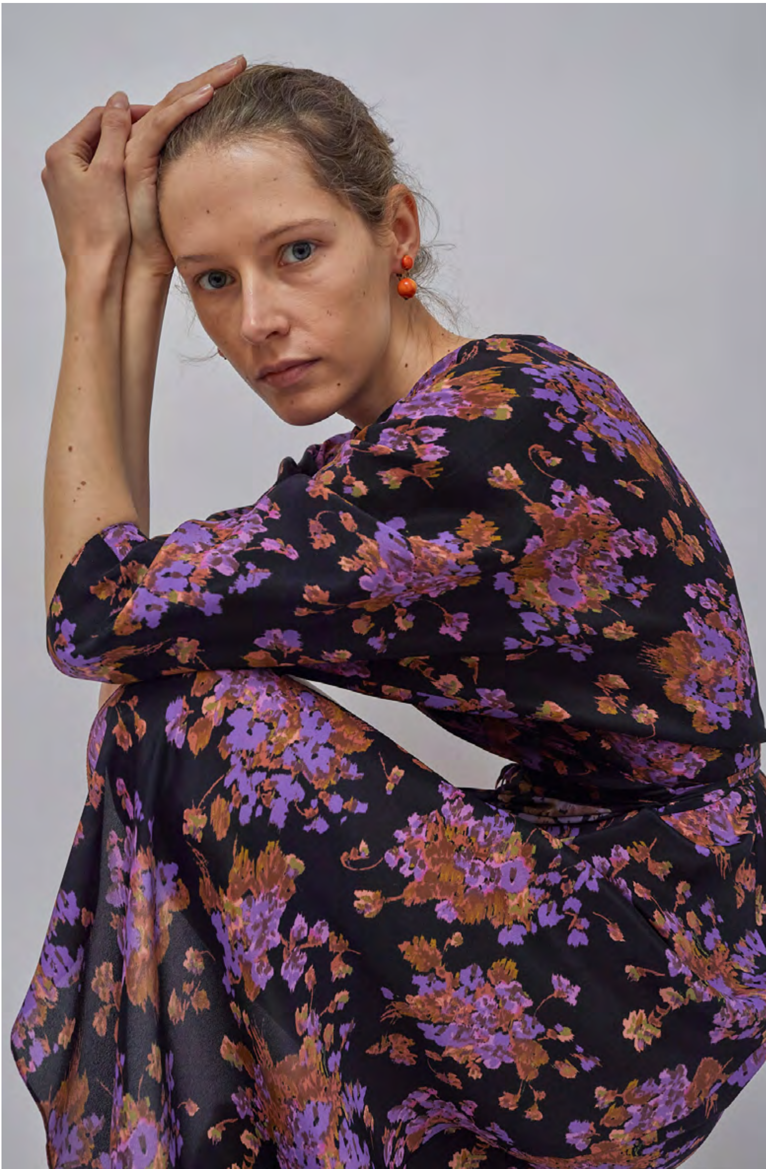
VIOLA DRESS IN VIOLET CLEMATIS