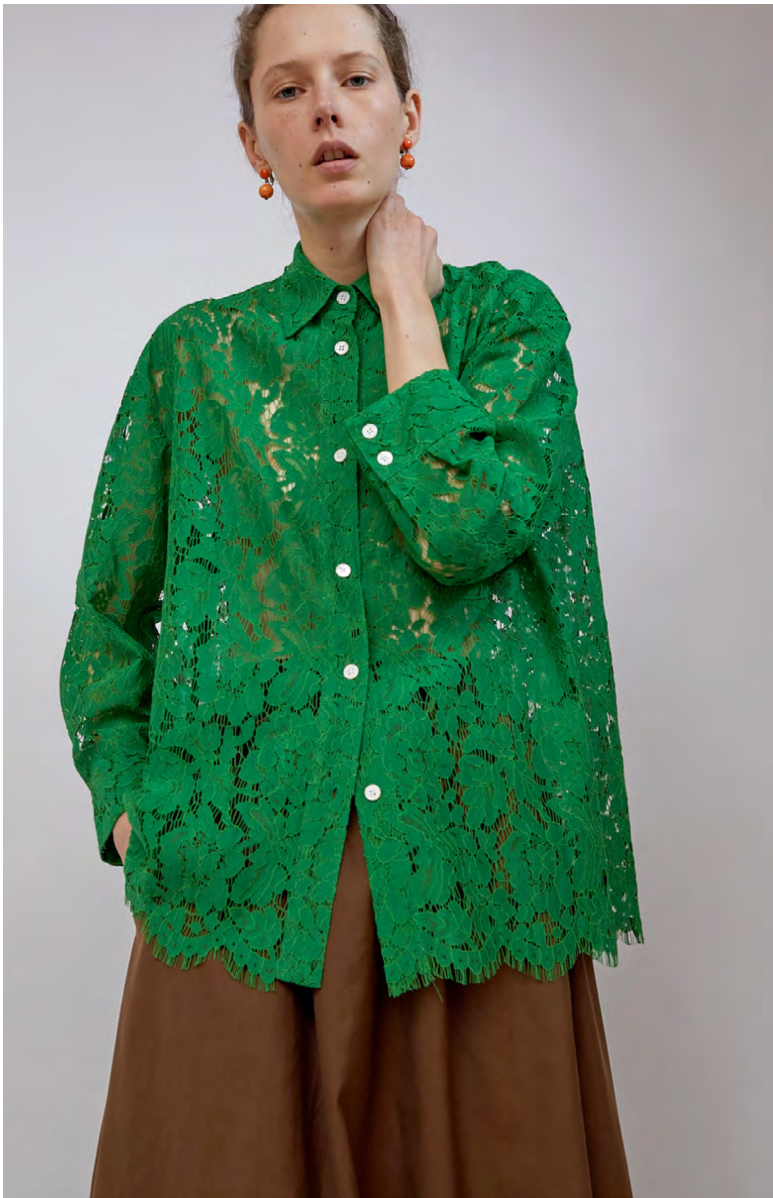
LAKE SHIRT IN EMERALD LACE / CAROLINE SKIRT IN COFFEE