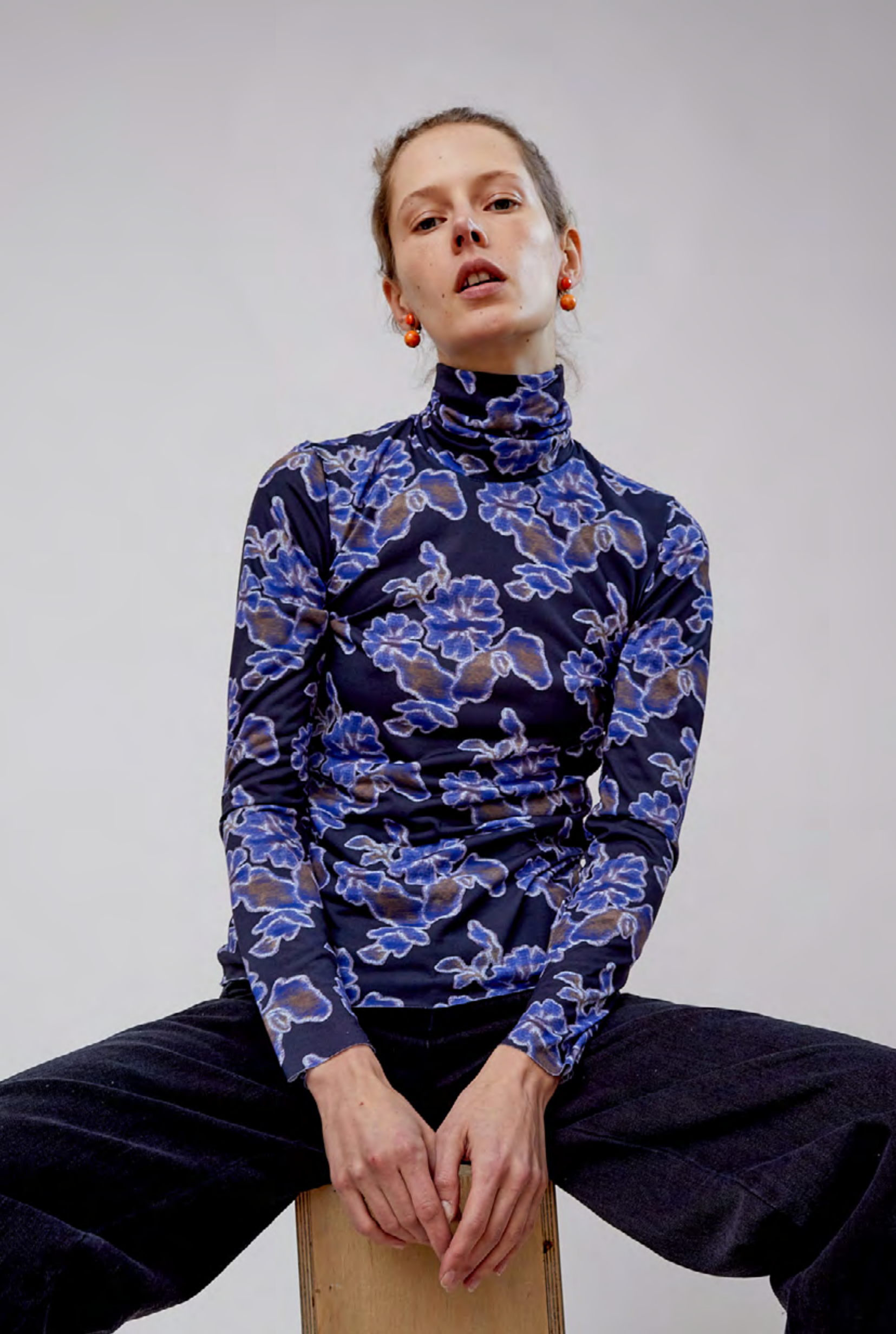
SCOUT TURTLENECK IN BLUE/BLACK CAMELLIA / MILLER PANT IN SMOKE DENIM