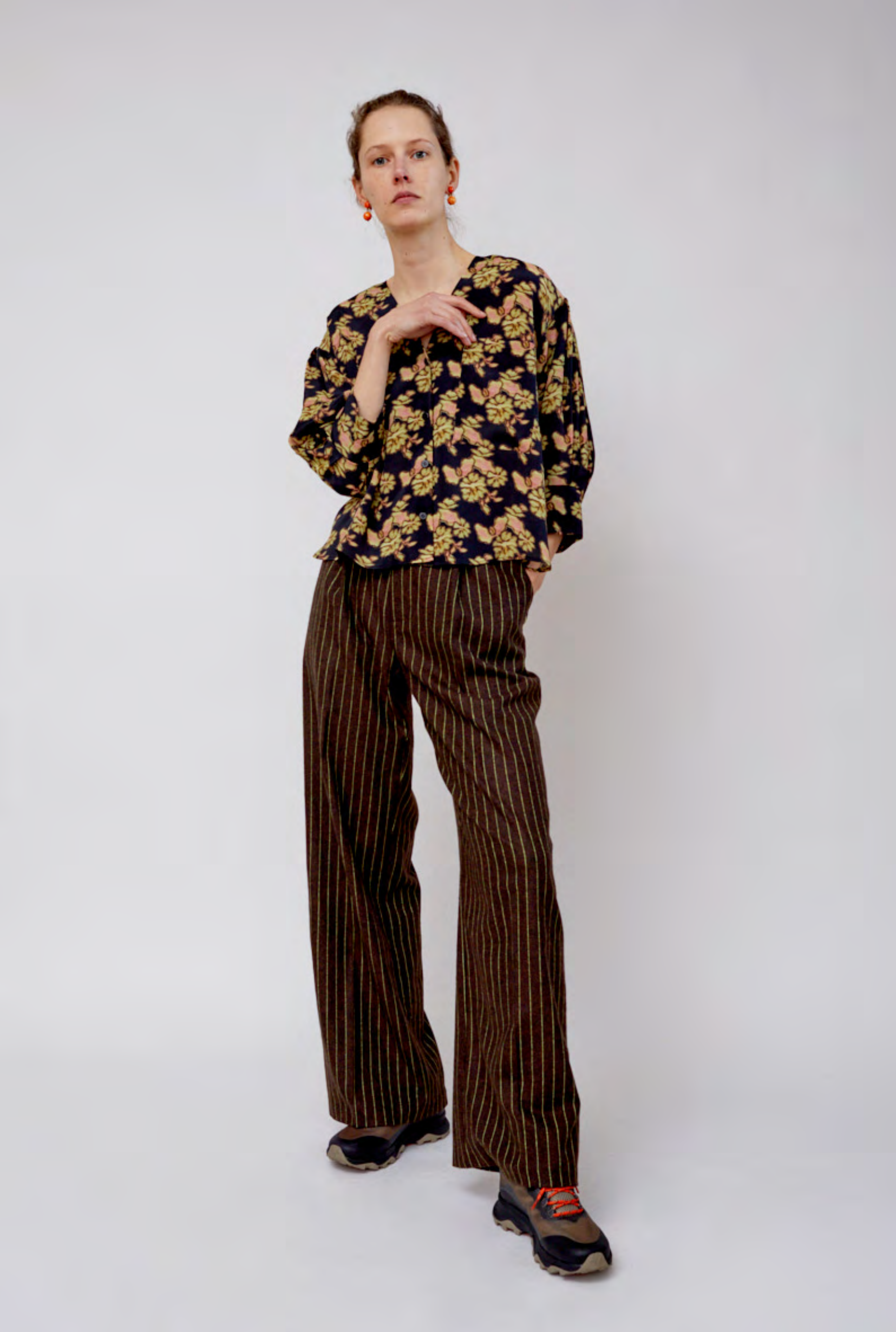
TURIN TOP IN BLACK/PINK CAMELLIA / KENT TROUSER IN BROWN/LIME STRIPE