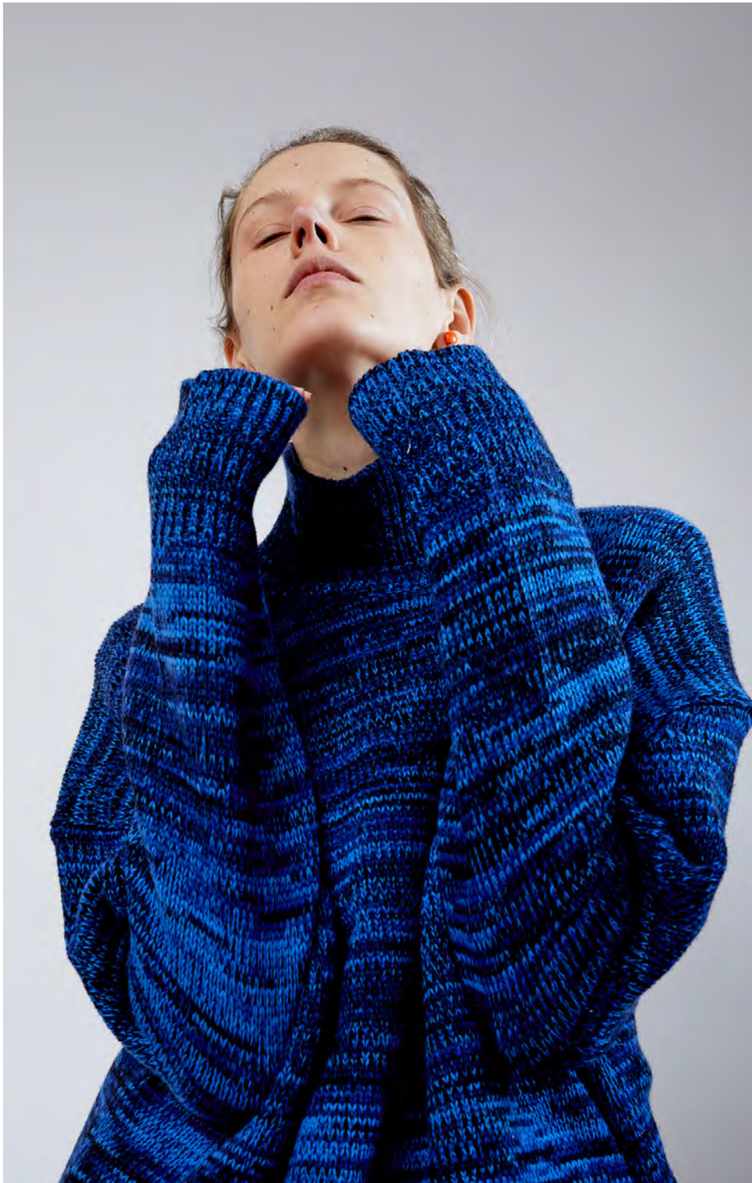
FREDDIE SWEATER IN BLUE MELANGE