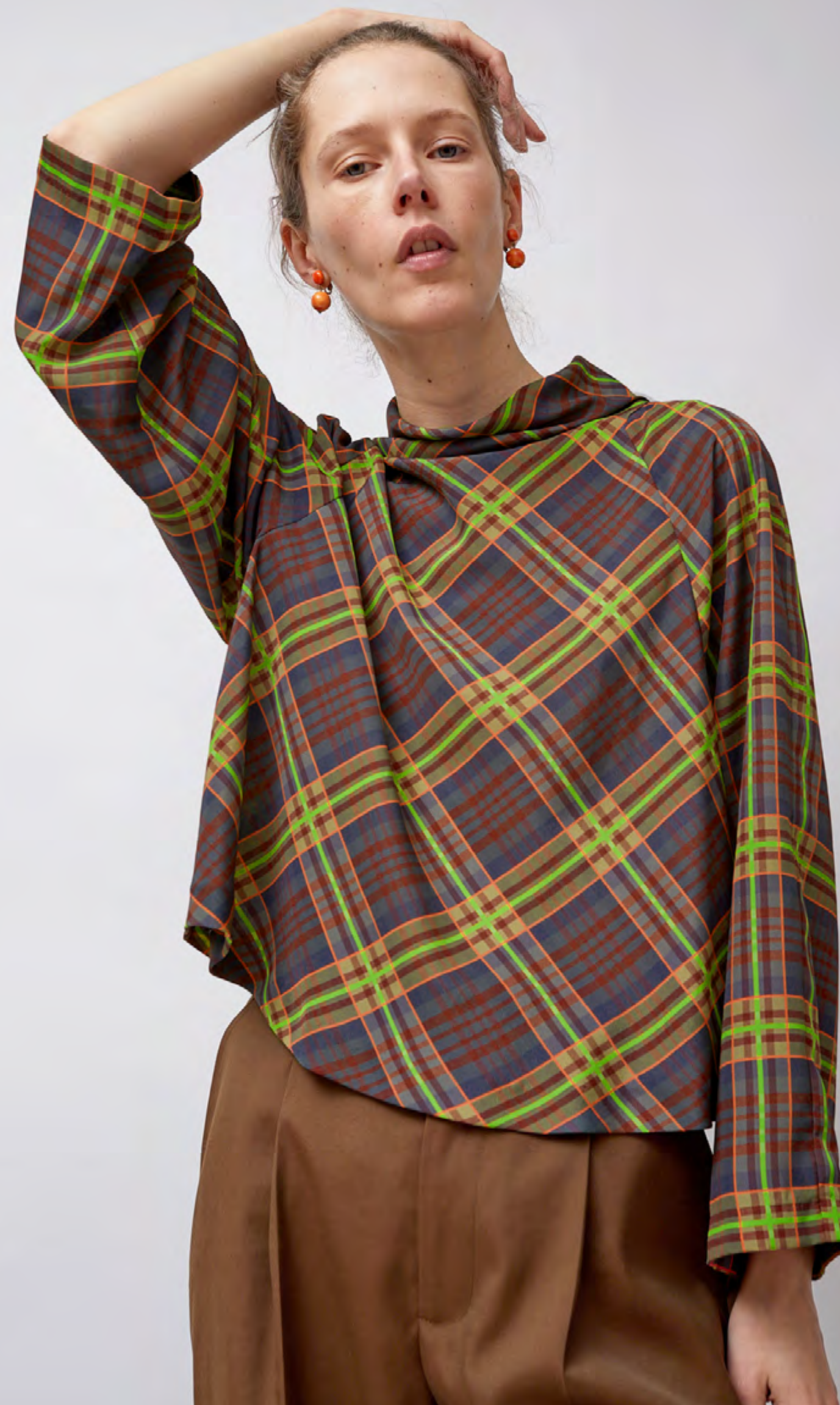
LARA COWL NECK TOP IN HUNTER PLAID