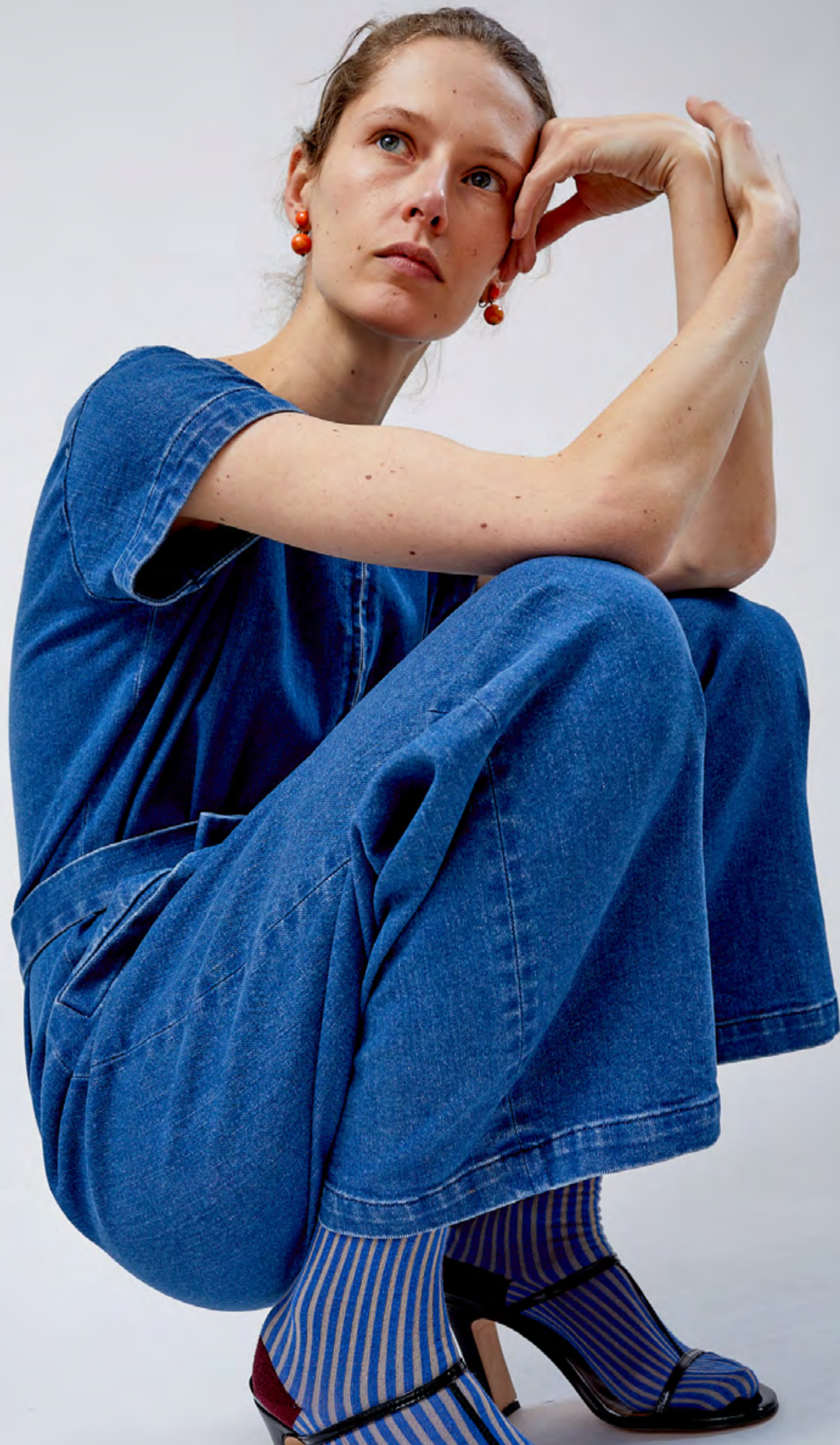
SLATE JUMPSUIT IN BLUE DENIM