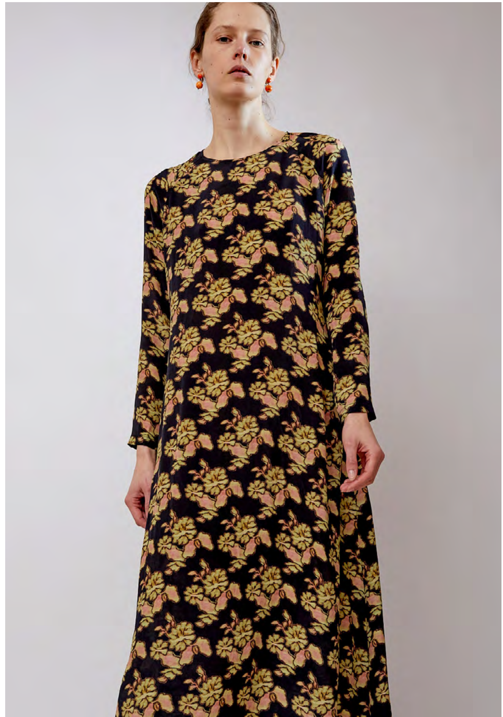
COCO DRESS IN BLACK/PINK CAMELLIA