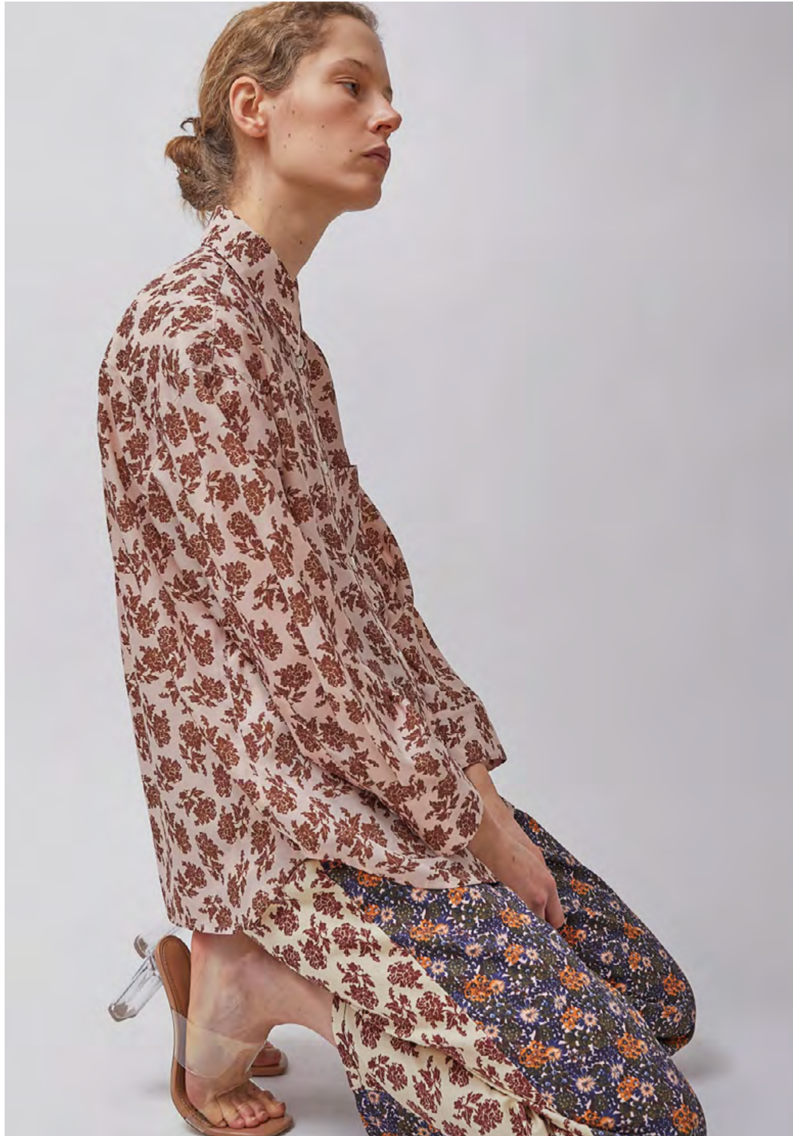
LAKE SHIRT IN BROWN DAMASK / AGATHA PANT IN NAVY FRENCH FLORAL AND BROWN DAMASK