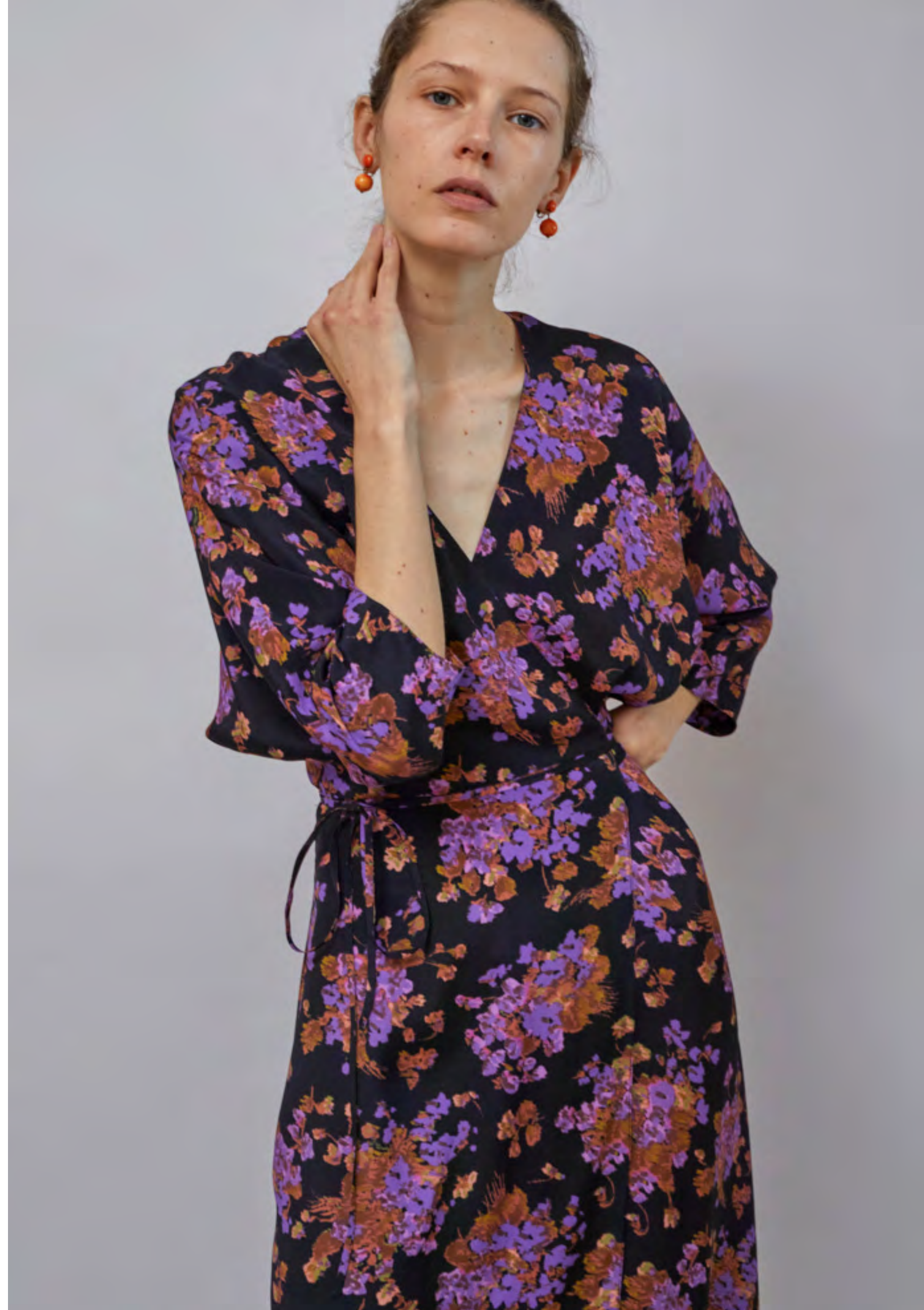
VIOLA DRESS IN VIOLET CLEMATIS