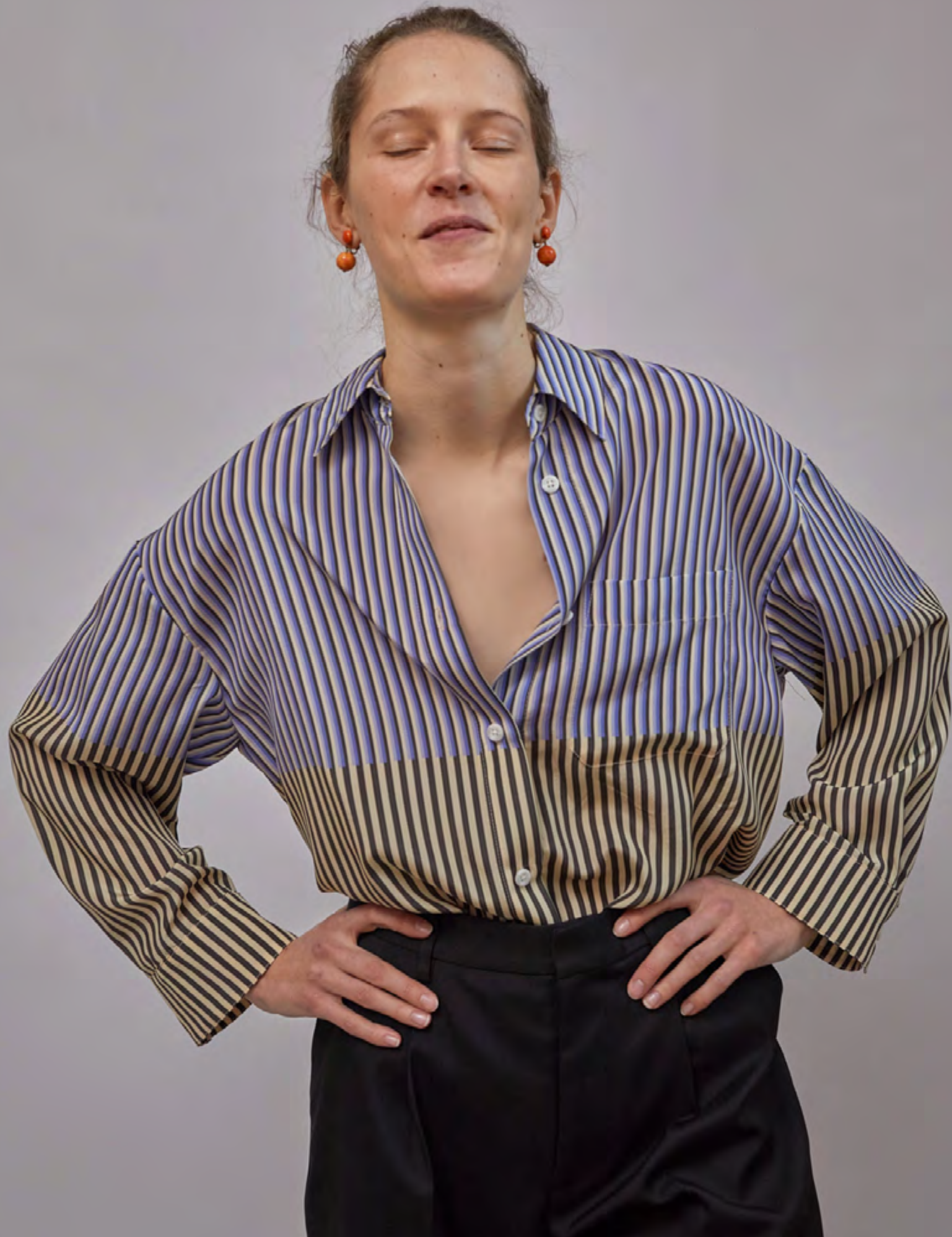
LAKE SHIRT IN BLACK / BLUE / STRIPE