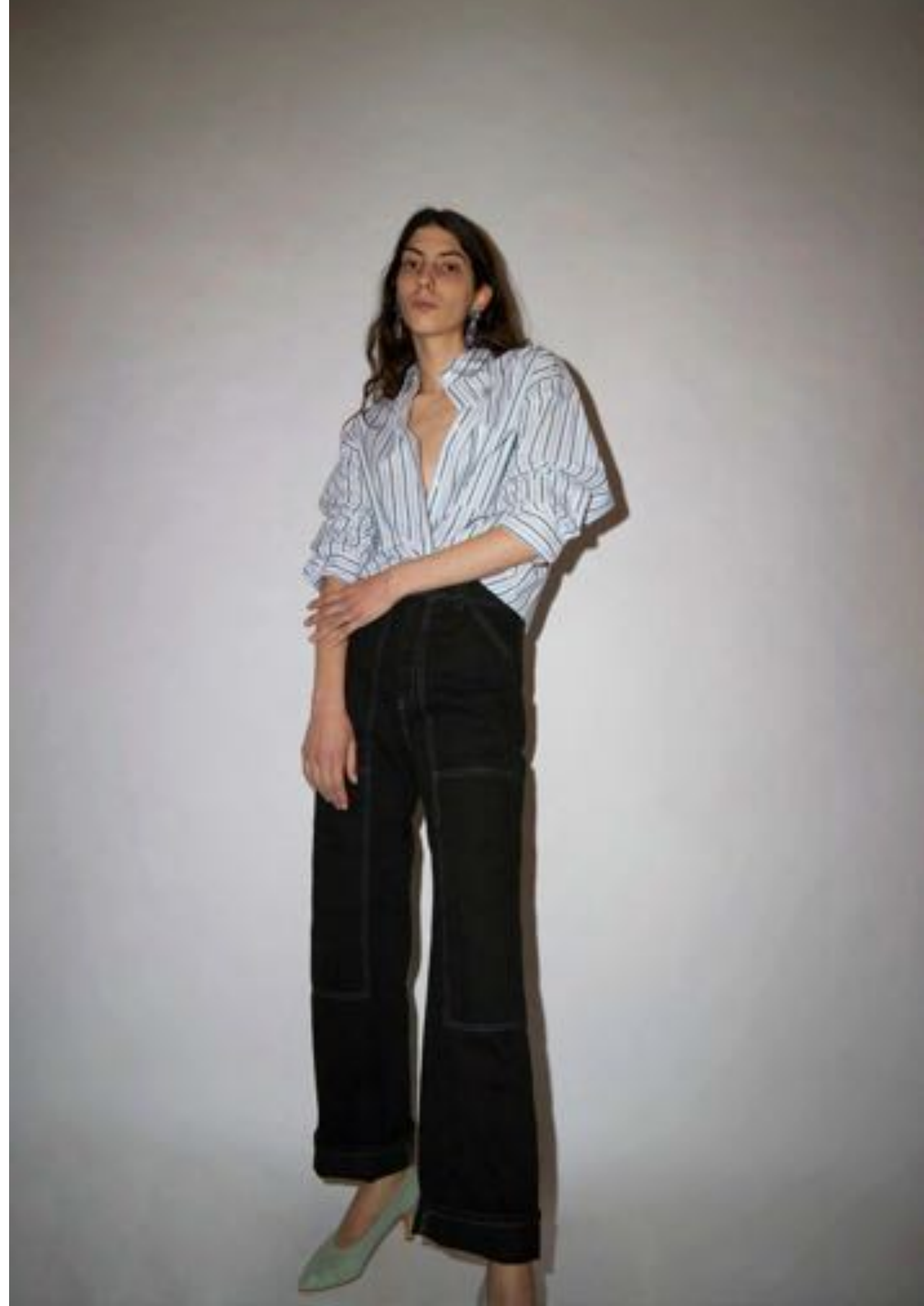
BASEL SHIRT IN WHITE BLUE GREEN STRIPE / JACKSON PANT IN OLIVE BULL DENIM