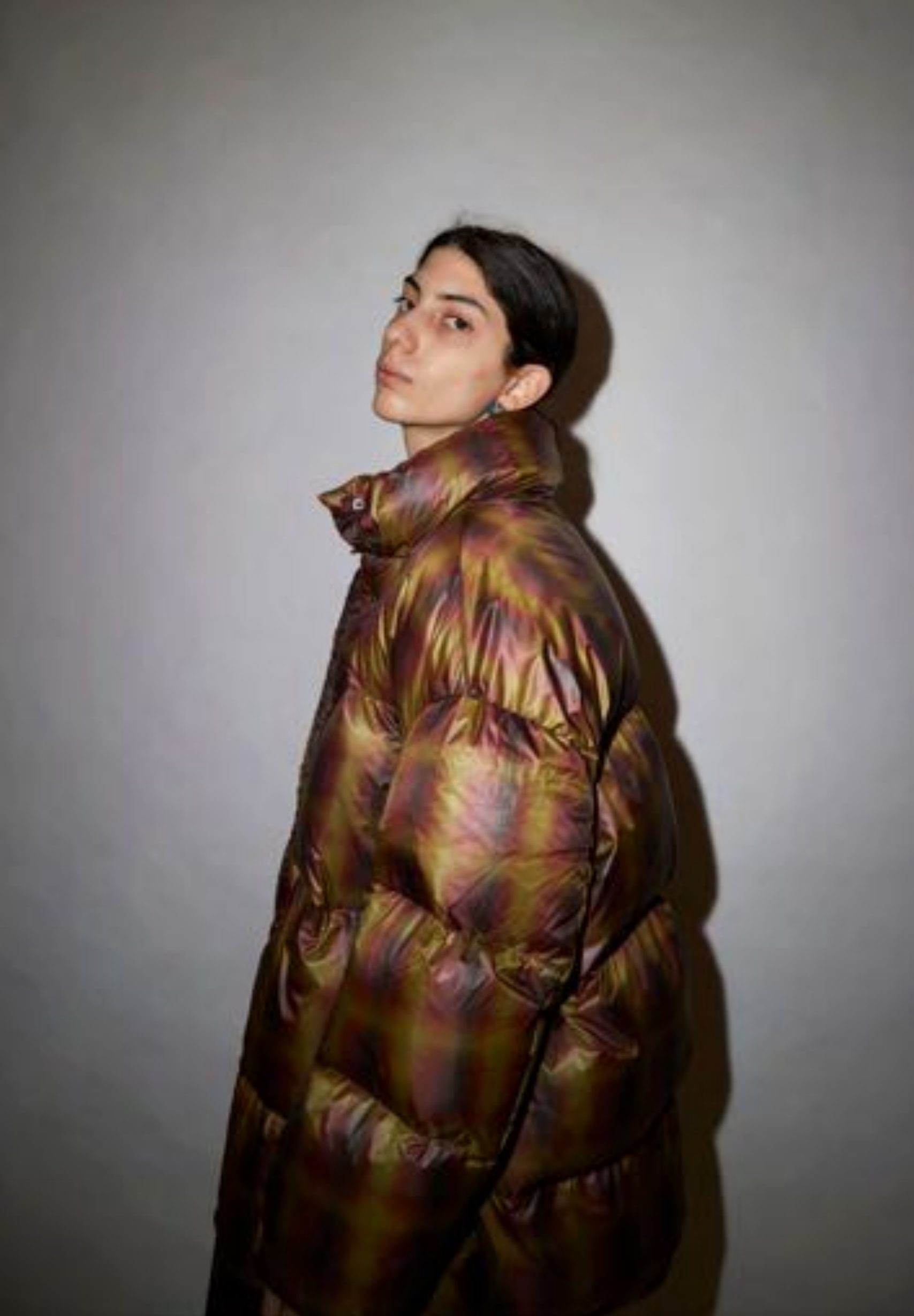
VALLEY PUFFER IN COPPER PLAID