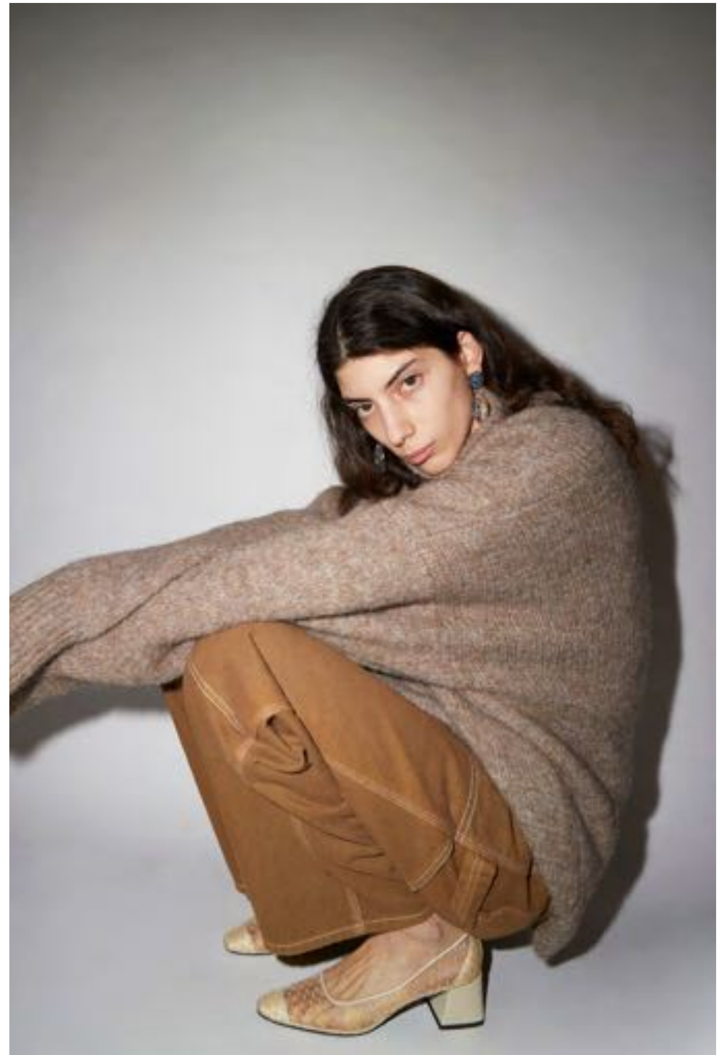
KALEN SWEATER IN OAT ALPACA / JACKSON PANT IN PECAN BULL DENIM