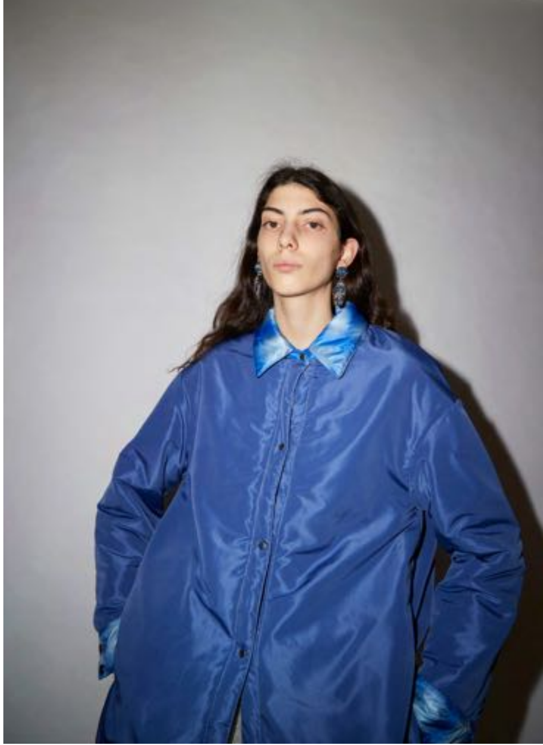
RYANN JACKET IN BLUE PLAID NYLON / KALEN SWEATER IN SILVER / BROOME PANT IN GREY