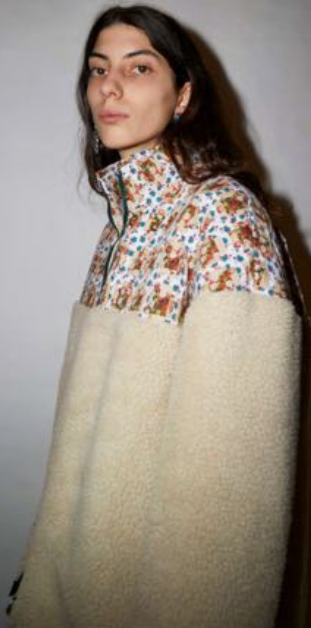
KELLI JACKET IN NATURAL / WHITE TRELLIS FLORAL / JACKSON PANT IN PECAN DENIM