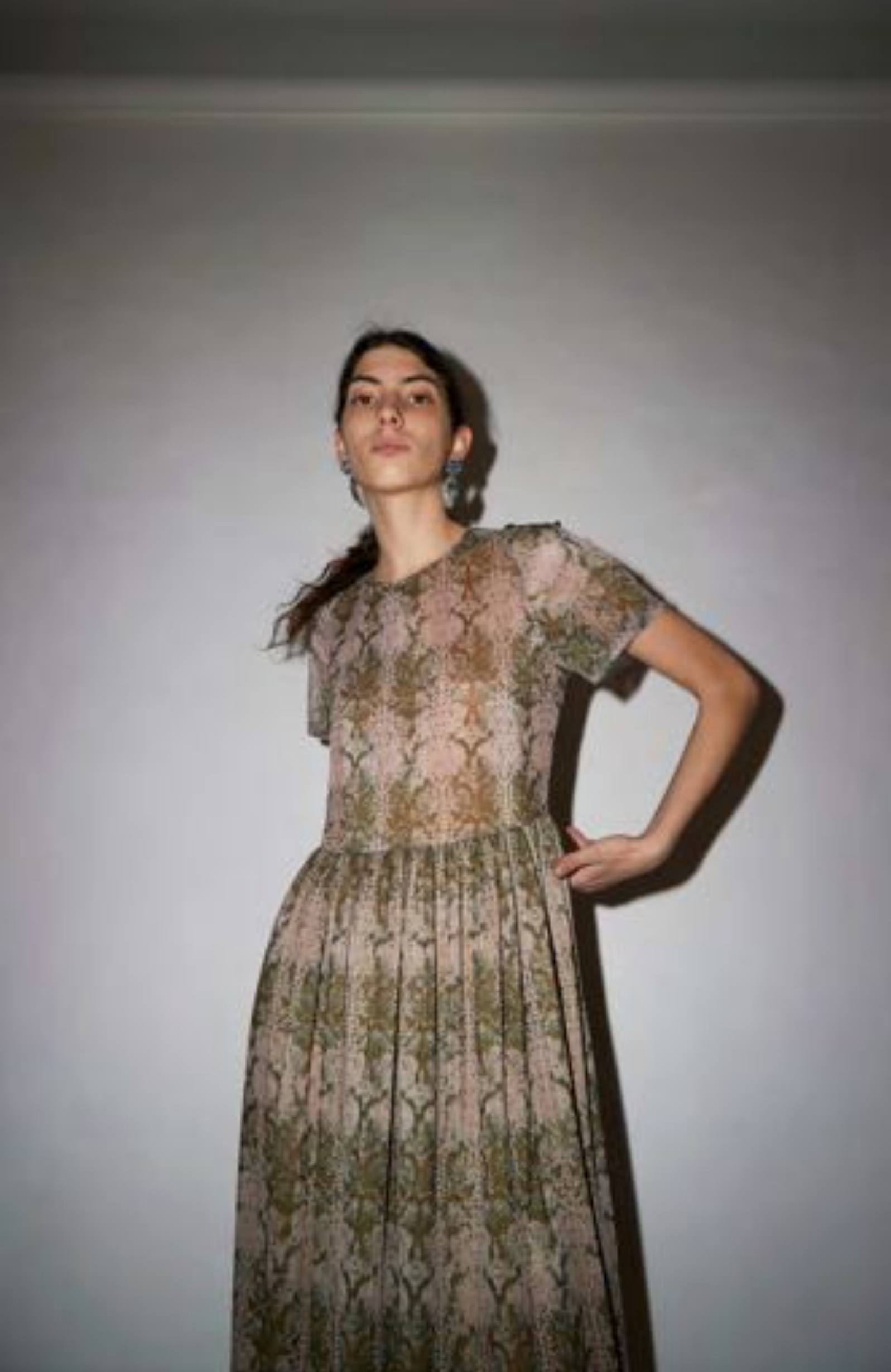
MAEVE DRESS IN TAN PYTHON