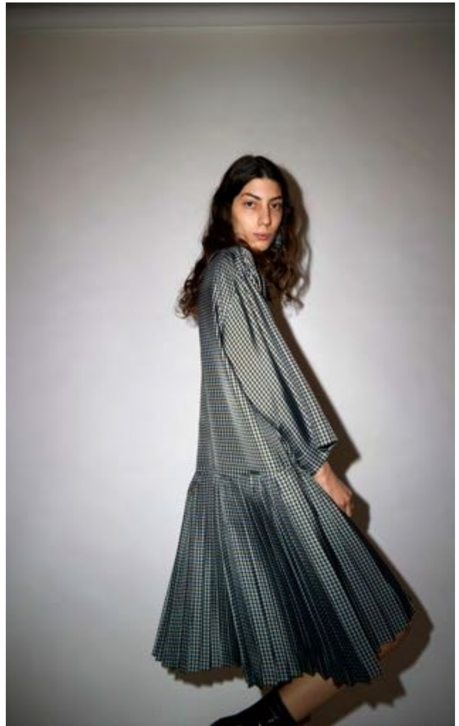
CORIN DRESS IN AZURE MINI CHECK