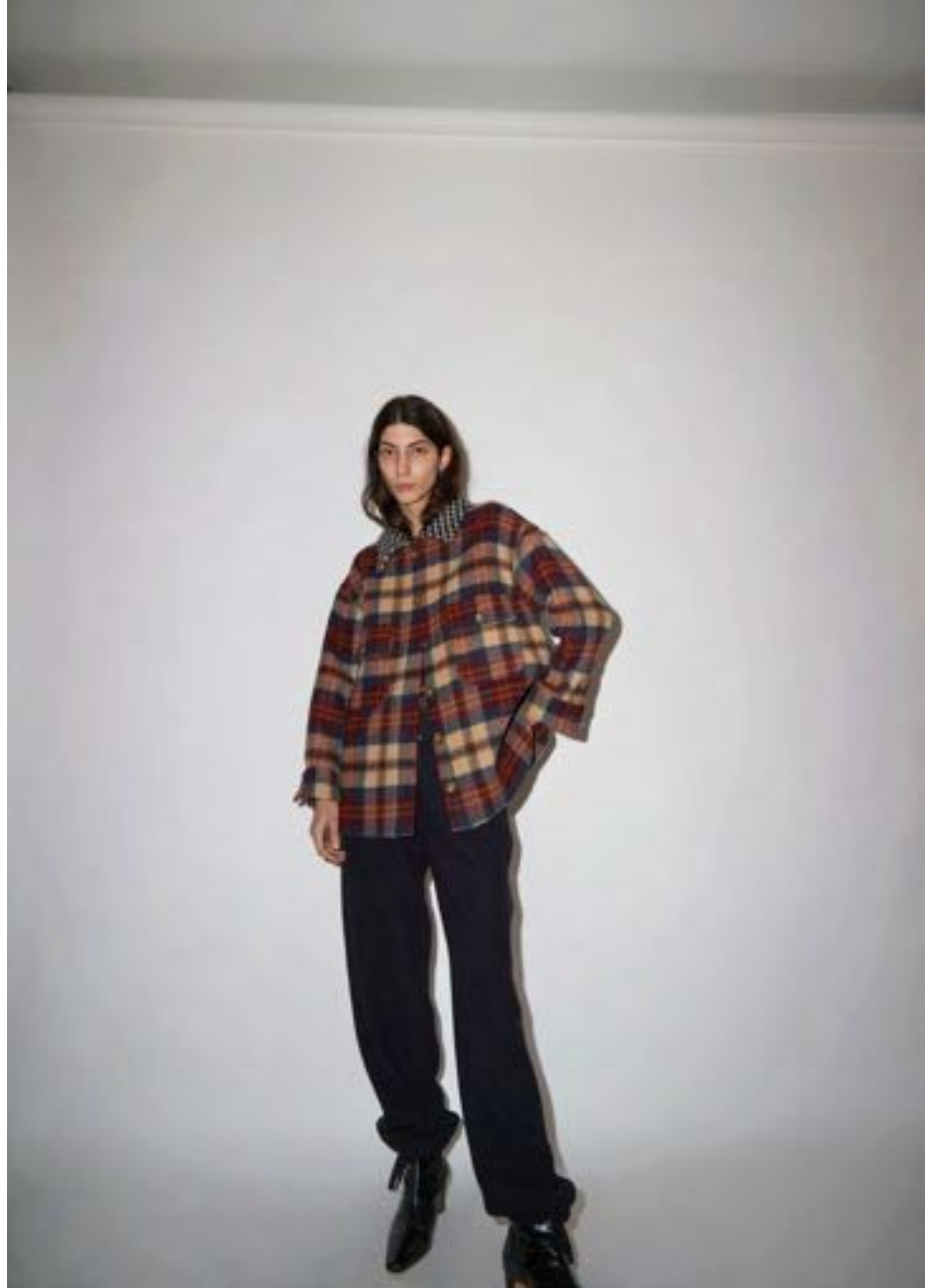
WILSON JACKET IN WINE / NAVY PLAID / BROOME PANT IN BLACK