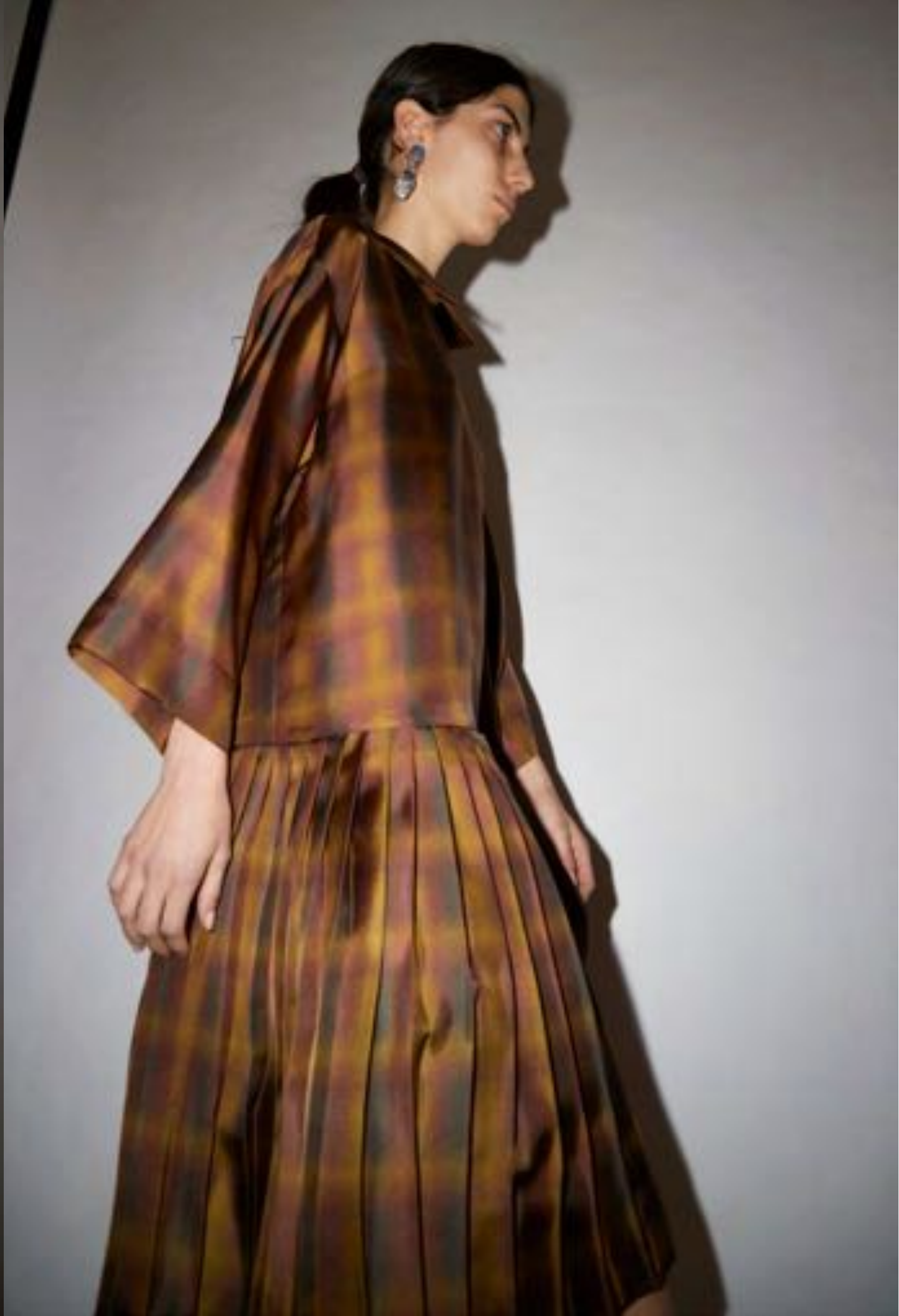
CORIN DRESS IN COPPER PLAID