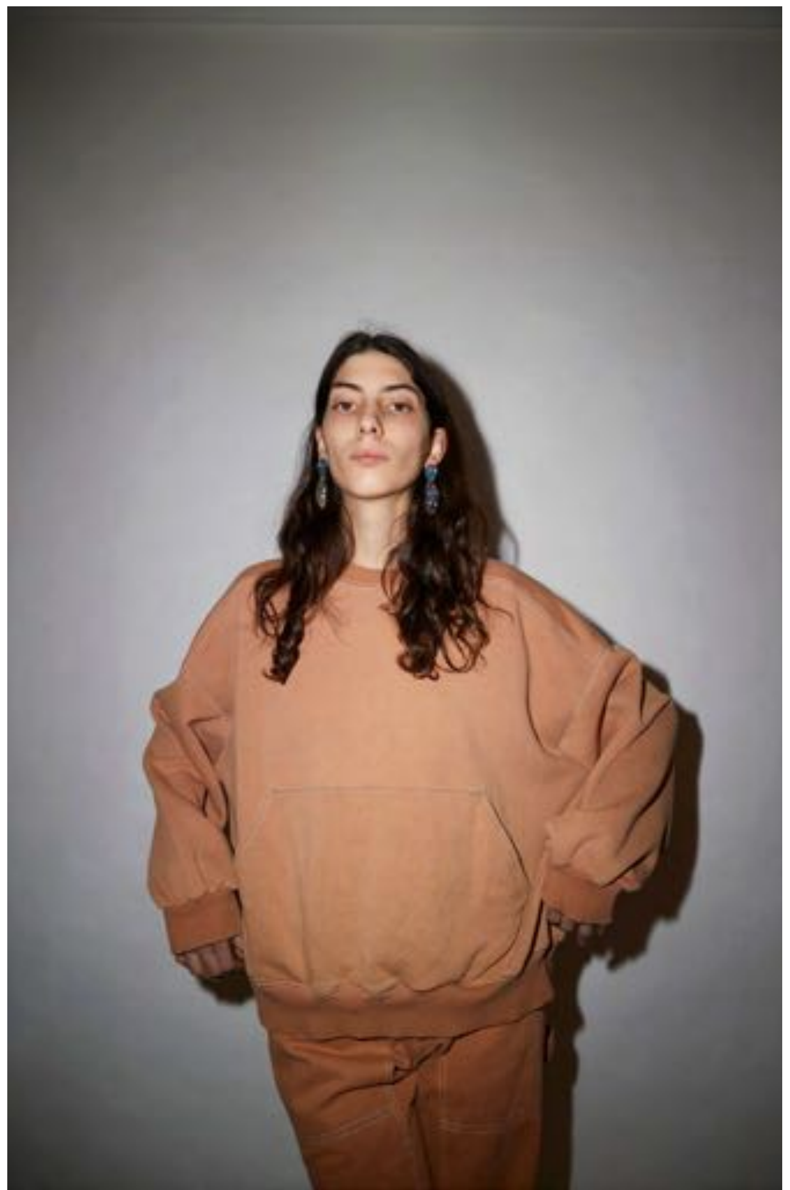
SMITH SWEATSHIRT IN DESERT / JACKSON PANT IN DESERT BULL DENIM