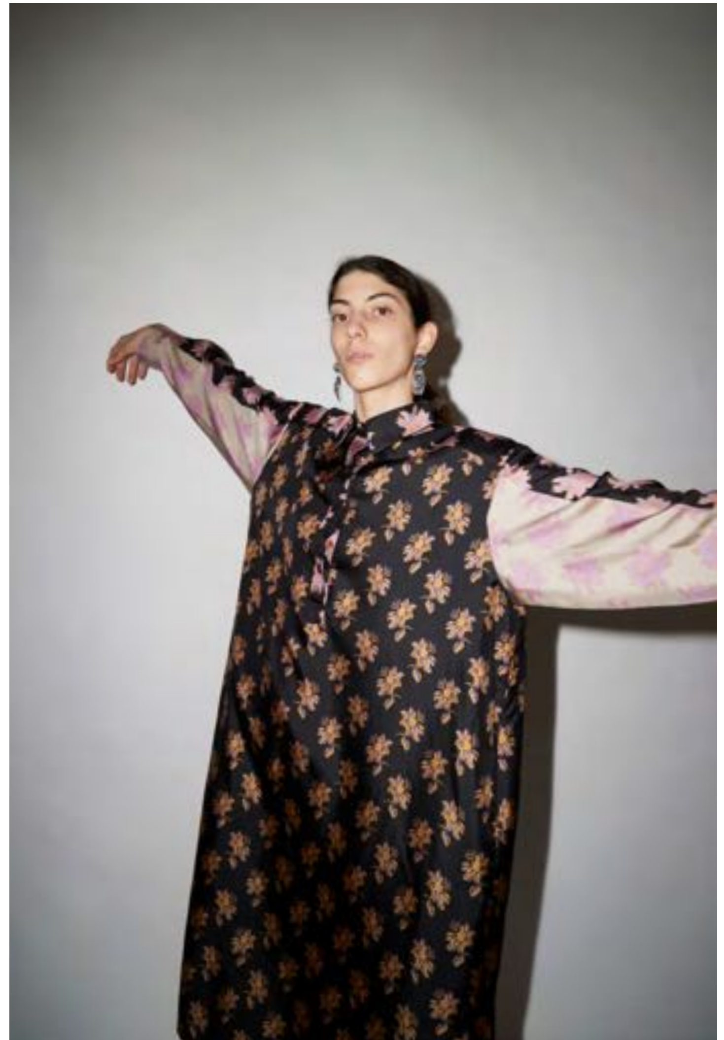
DEVON DRESS IN BLACK FLORAL COMBO