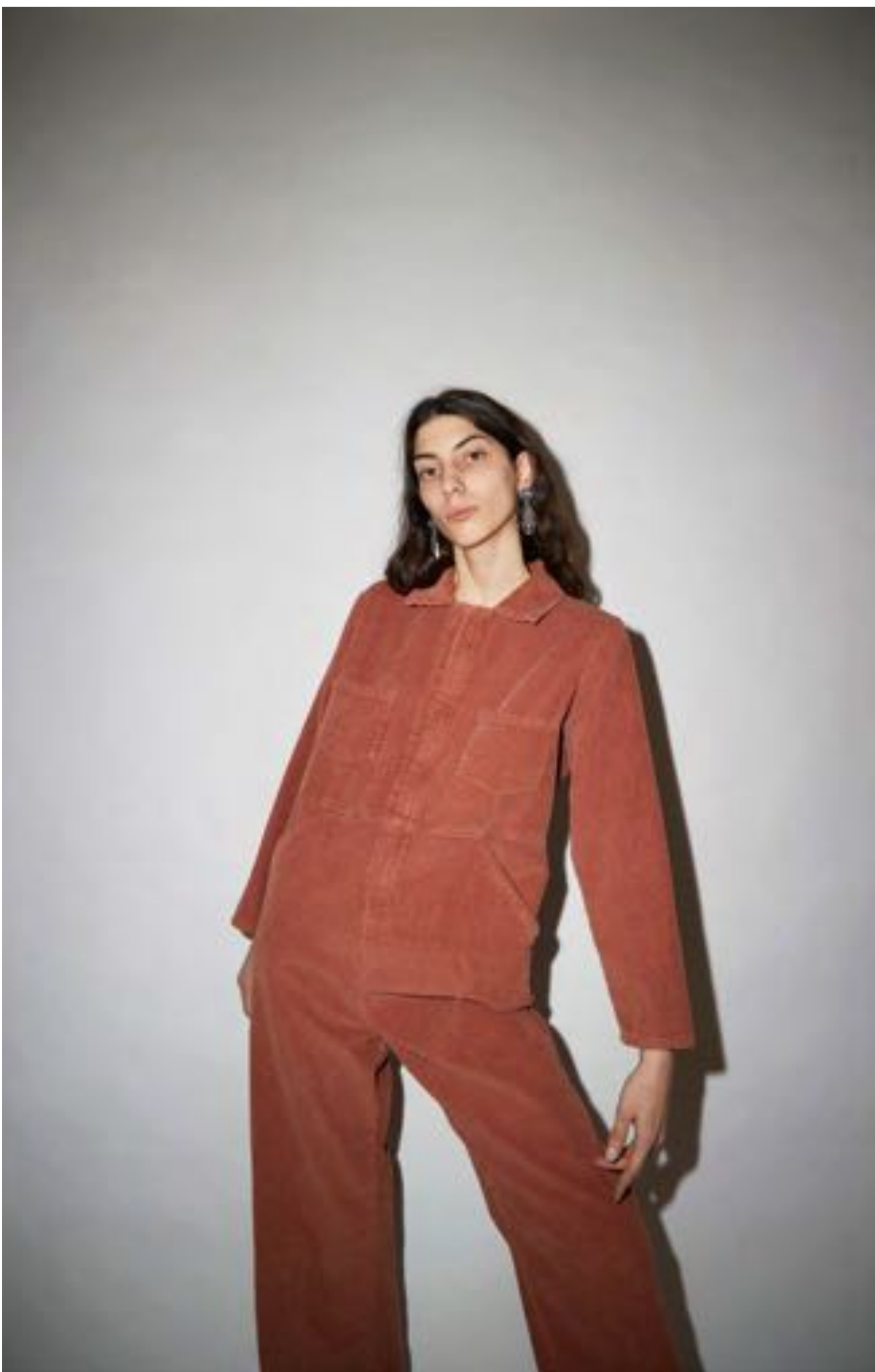
MARLON JUMPSUIT IN ROSE CORDUROY