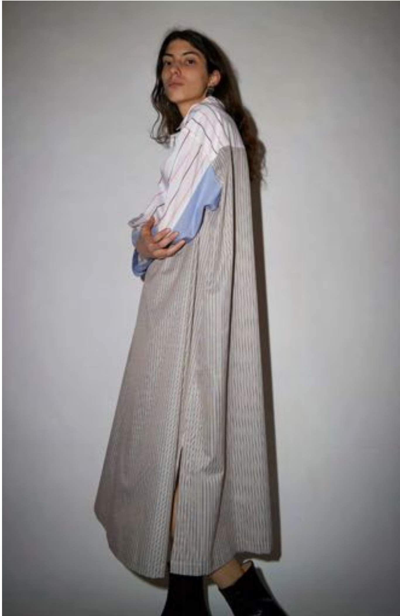
DEVON DRESS IN MULTISTRIPE