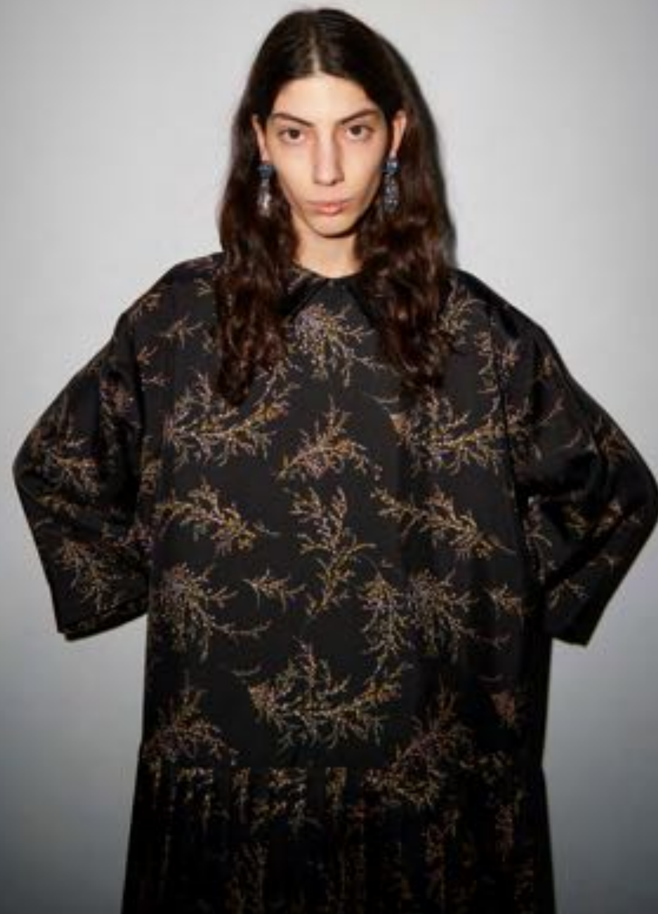
CORIN DRESS IN BLACK SPRAY FLORAL