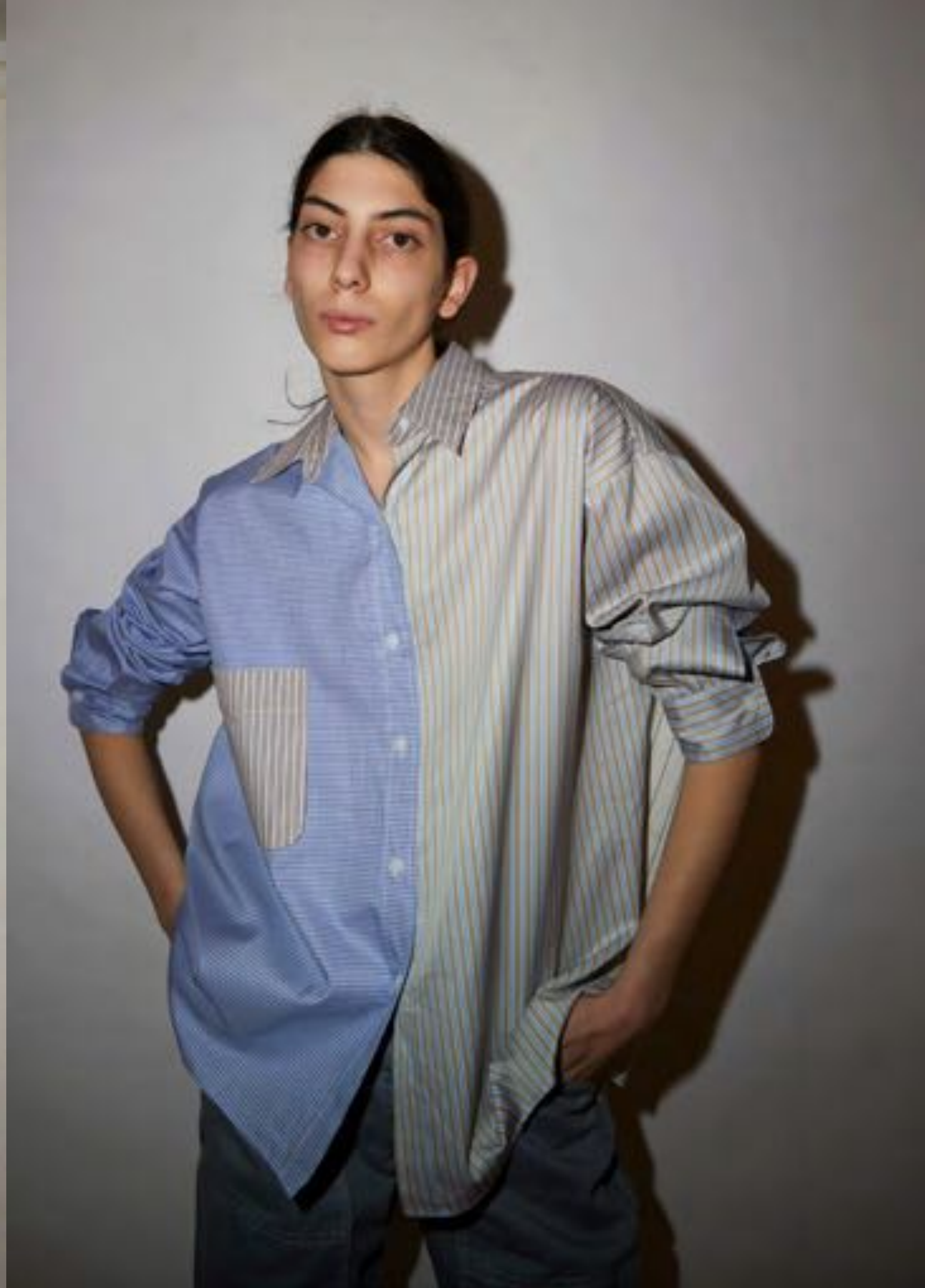
BASEL SHIRT IN MULTI STRIPE COMBO