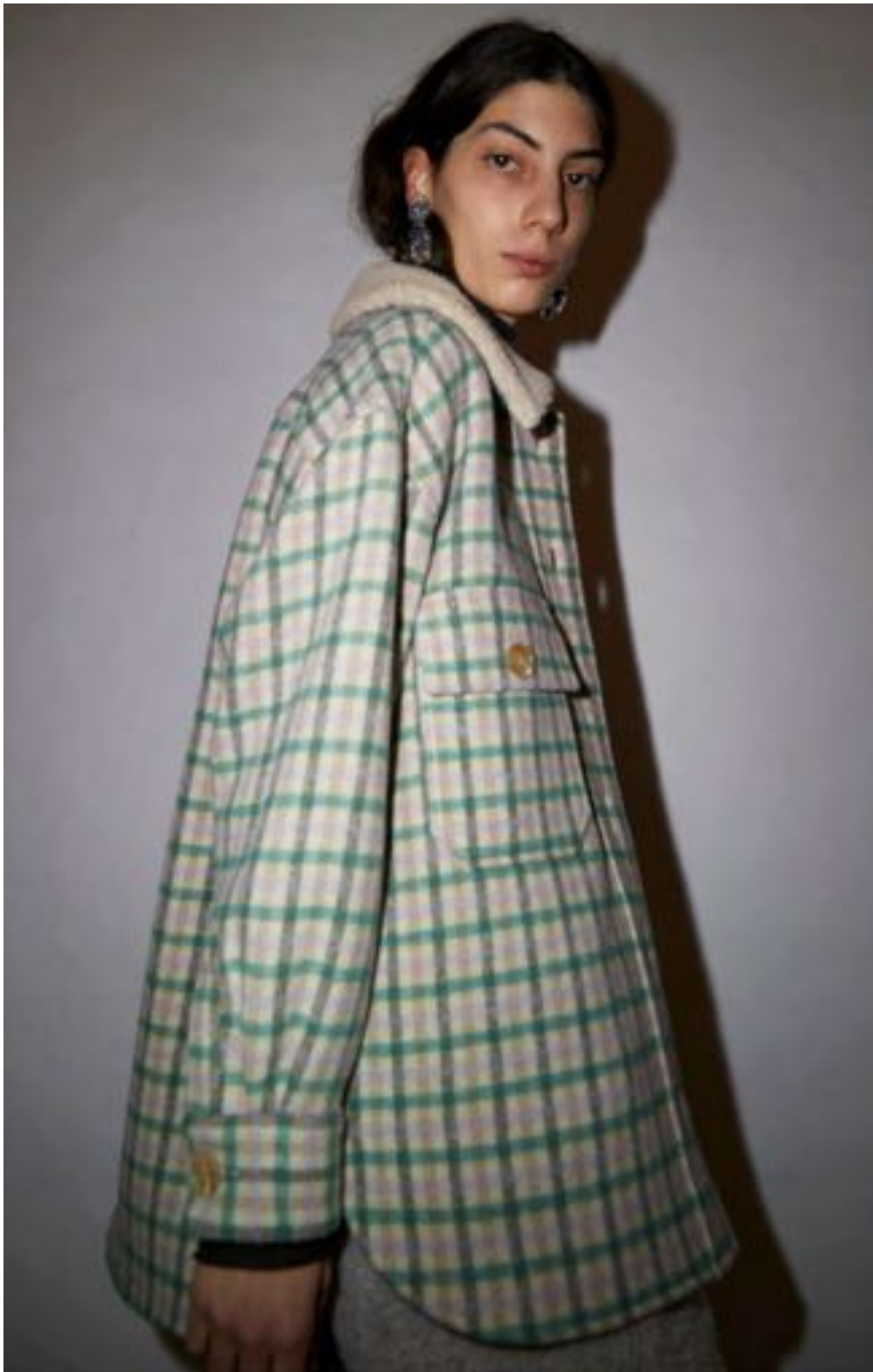
WILSON JACKET IN CREME / MINT PLAID