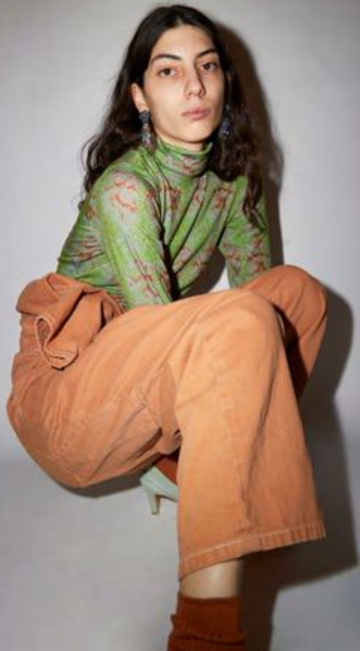
SCOUT TURTLENECK IN LIME PYTHON JERSEY / MARLON JUMPSUIT IN DESERT TWILL