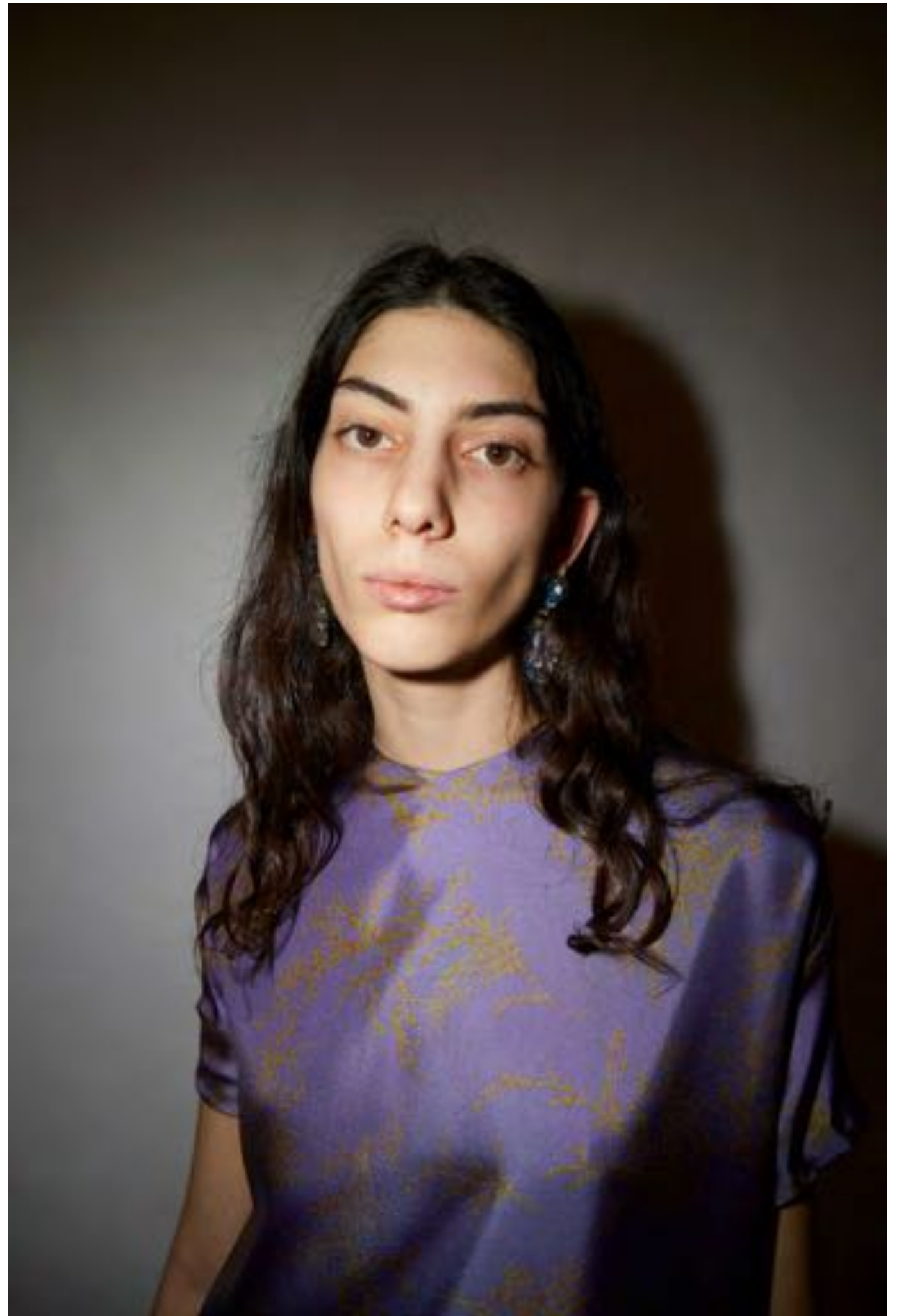
MAEVE DRESS IN VIOLET SPRAY FLORAL