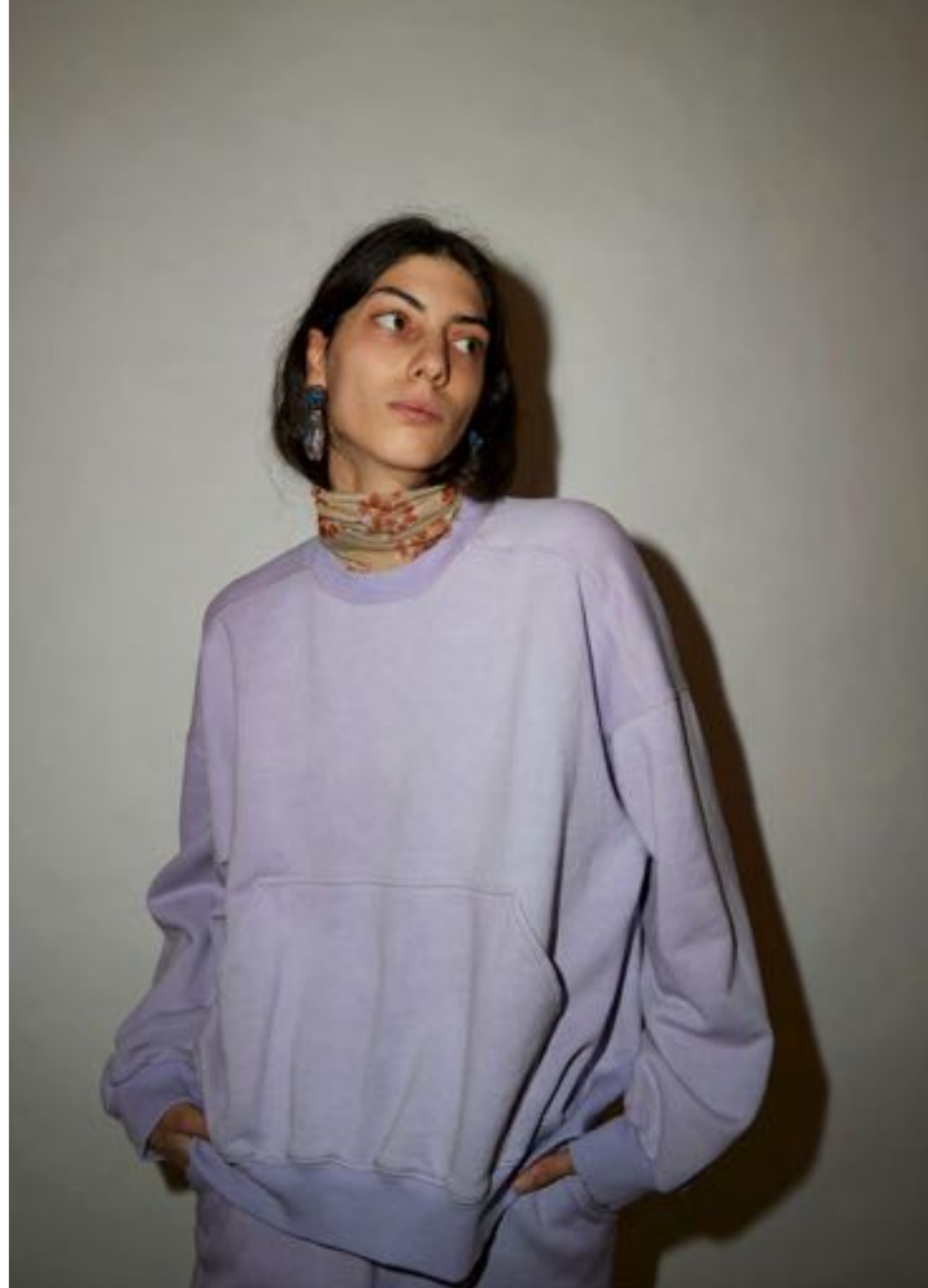
SMITH SWEATSHIRT IN LILAC