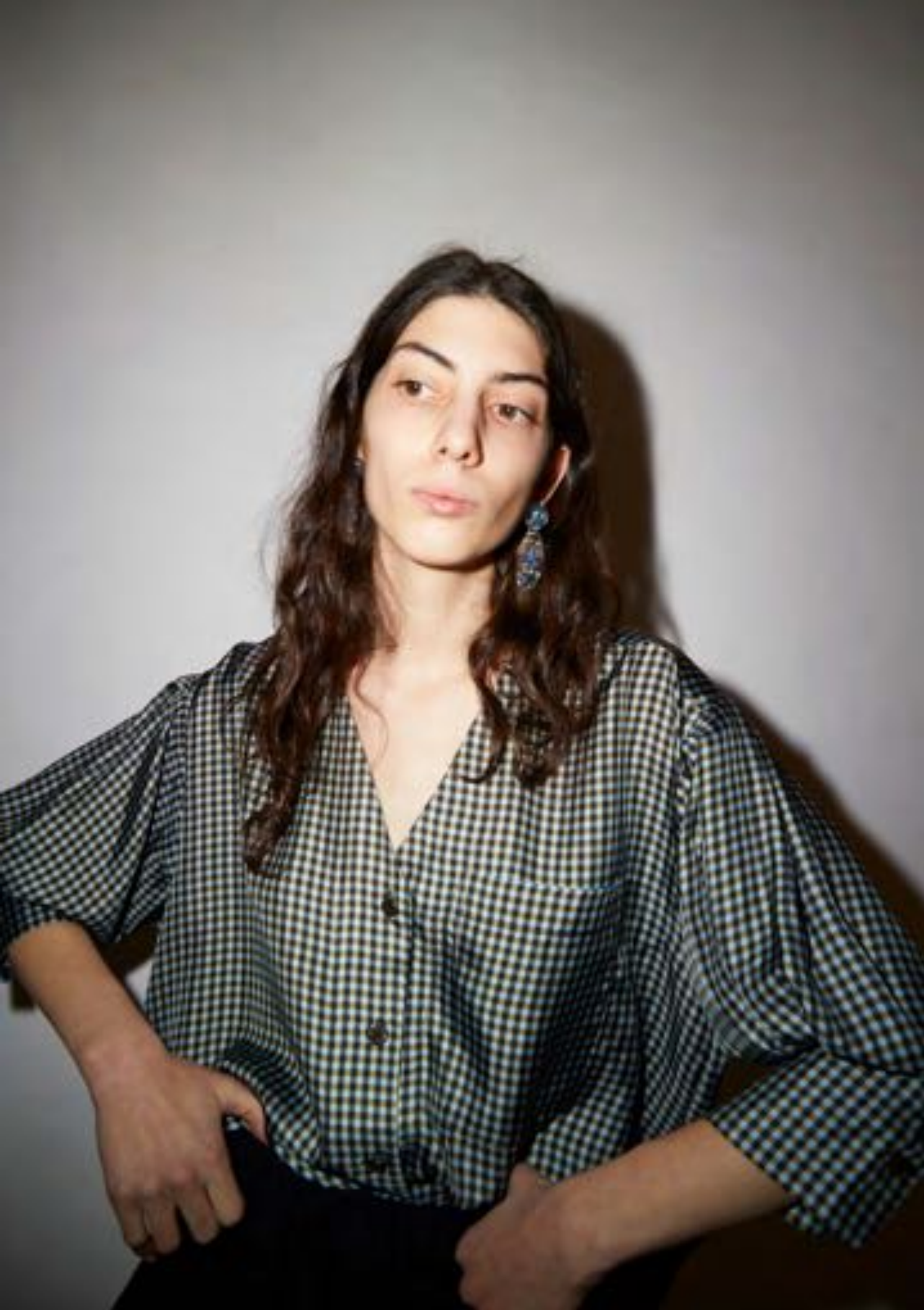
TURIN TOP IN AZURE MINI CHECK