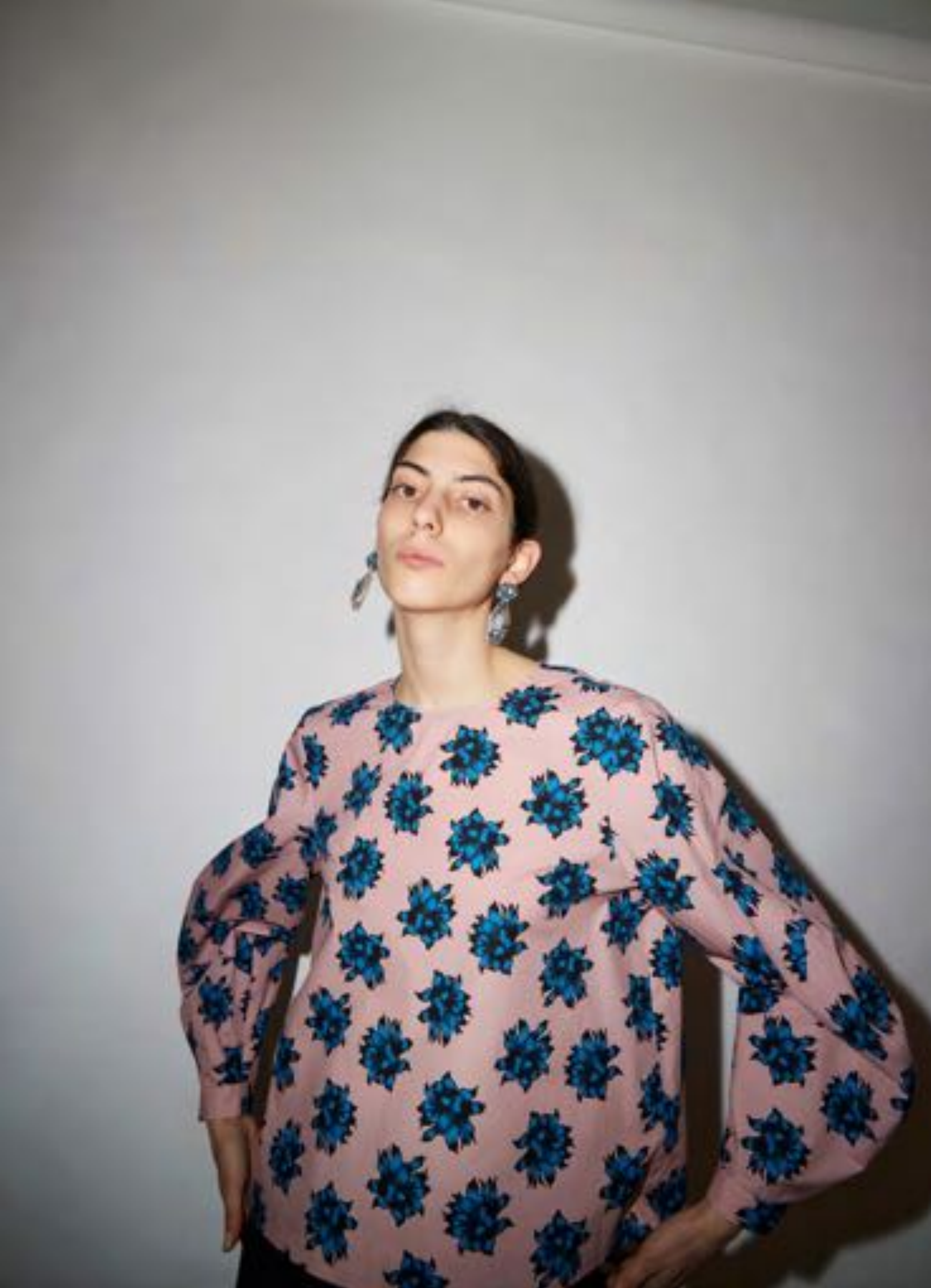
BERRY TOP IN PINK STARFLOWER POPLIN