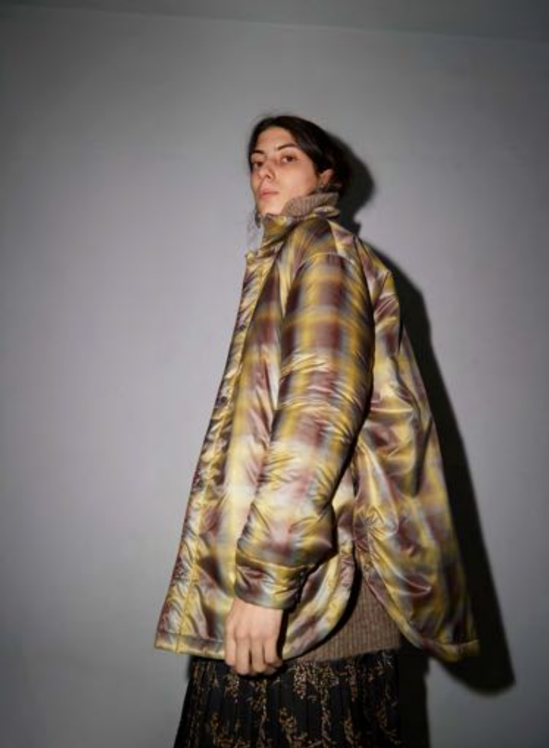
RYANN JACKET IN GOLD PLAID / KALEN SWEATER IN OAT ALPACA