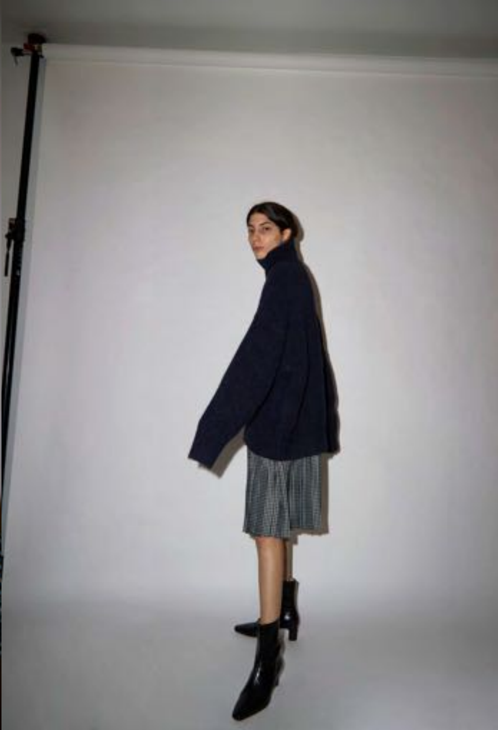
KALEN SWEATER IN NAVY ALPACA / CORIN DRESS IN AZURE MINI CHECK