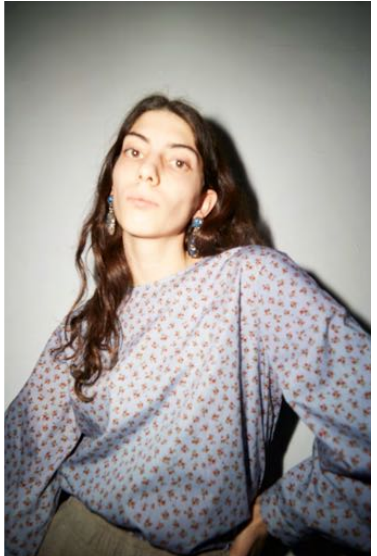
BERRY TOP IN BLUE COUNTRY FLORAL POPLIN