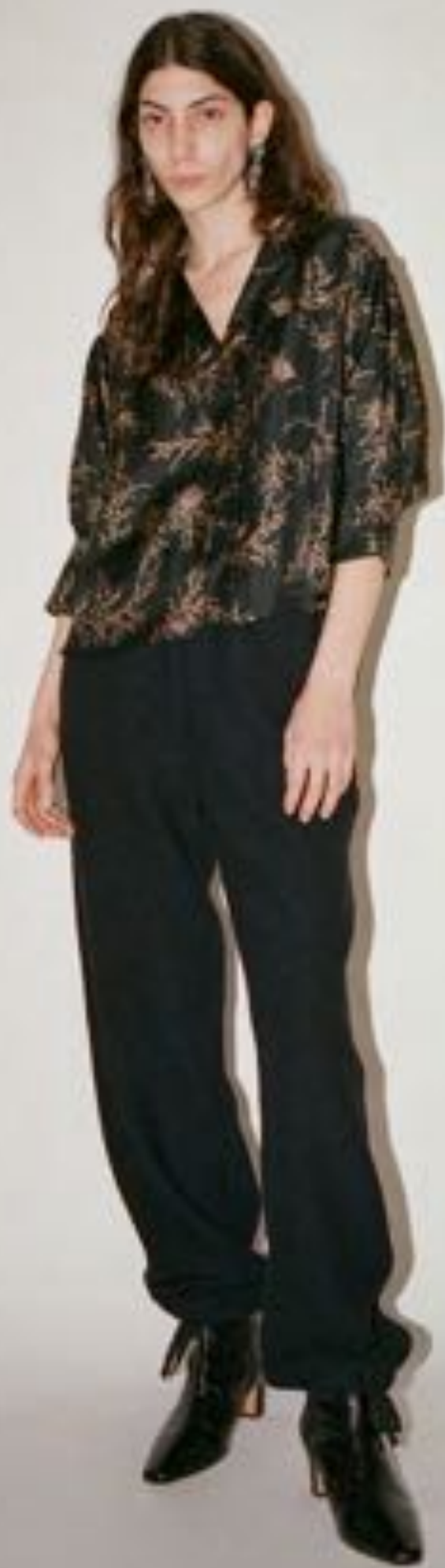
TURIN TOP IN BLACK SPRAY FLORAL / BROOME PANT IN BLACK WOOL