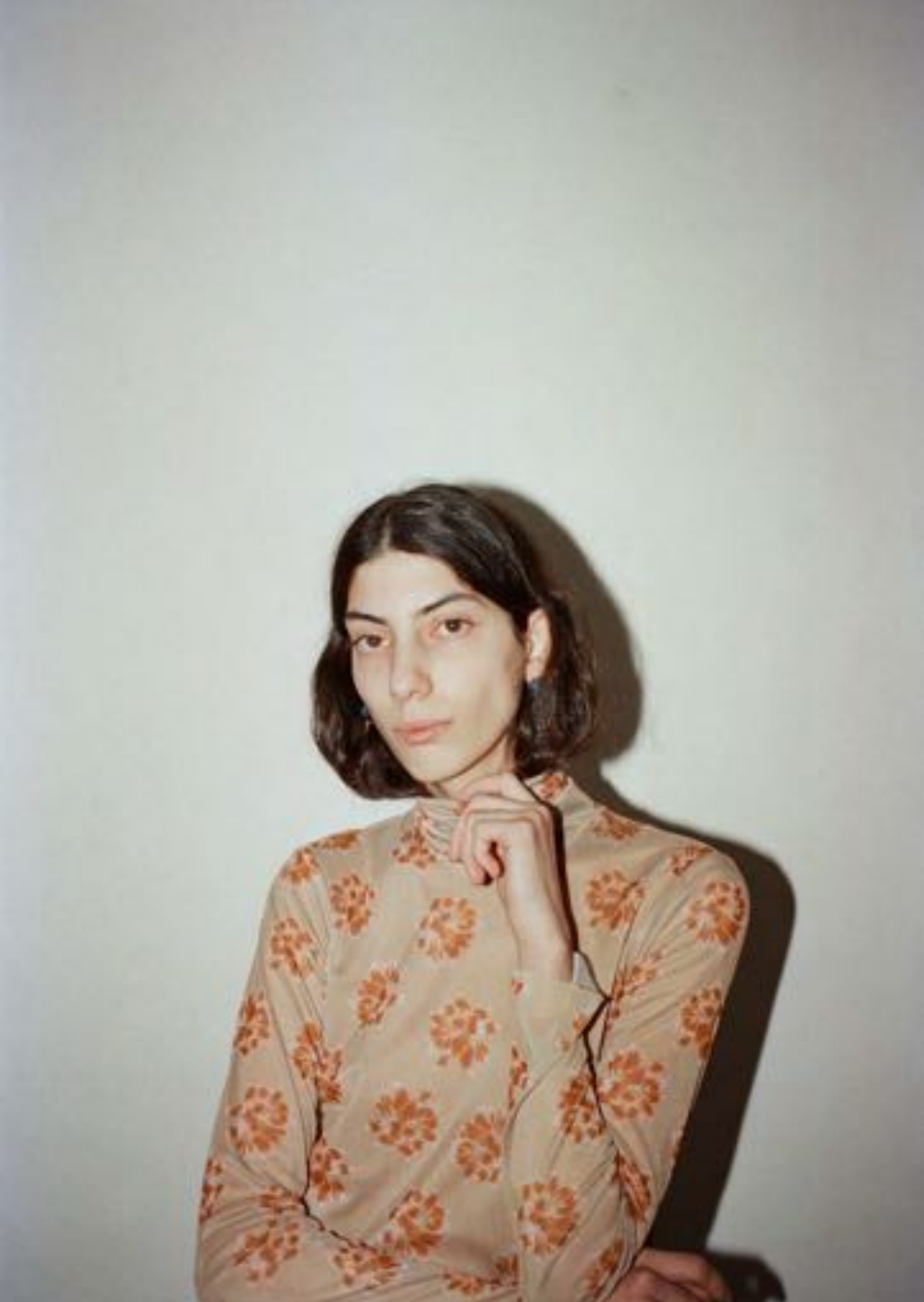
SCOUT TURTLENECK IN CAMEL STARFLOWER MESH