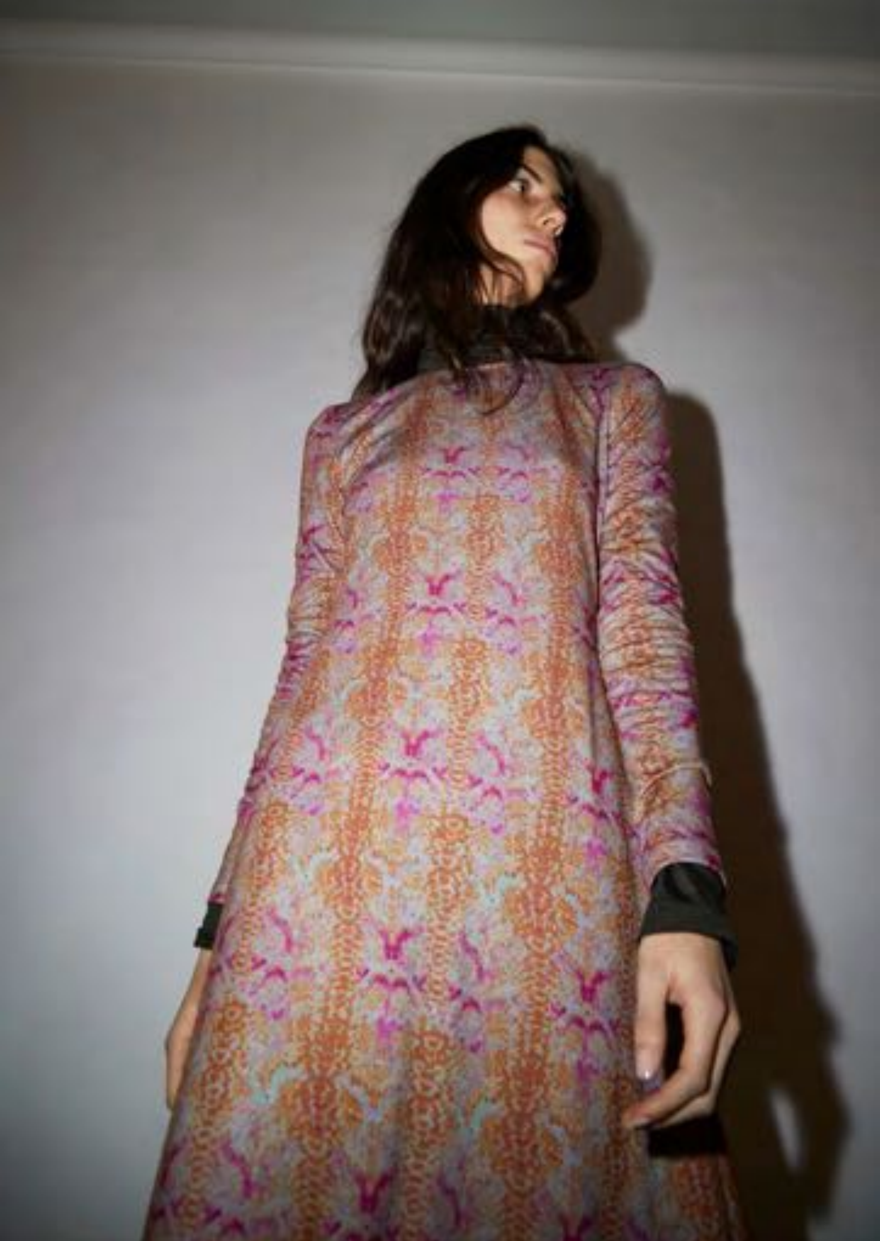
AKI DRESS IN ROUGE PYTHON JERSEY