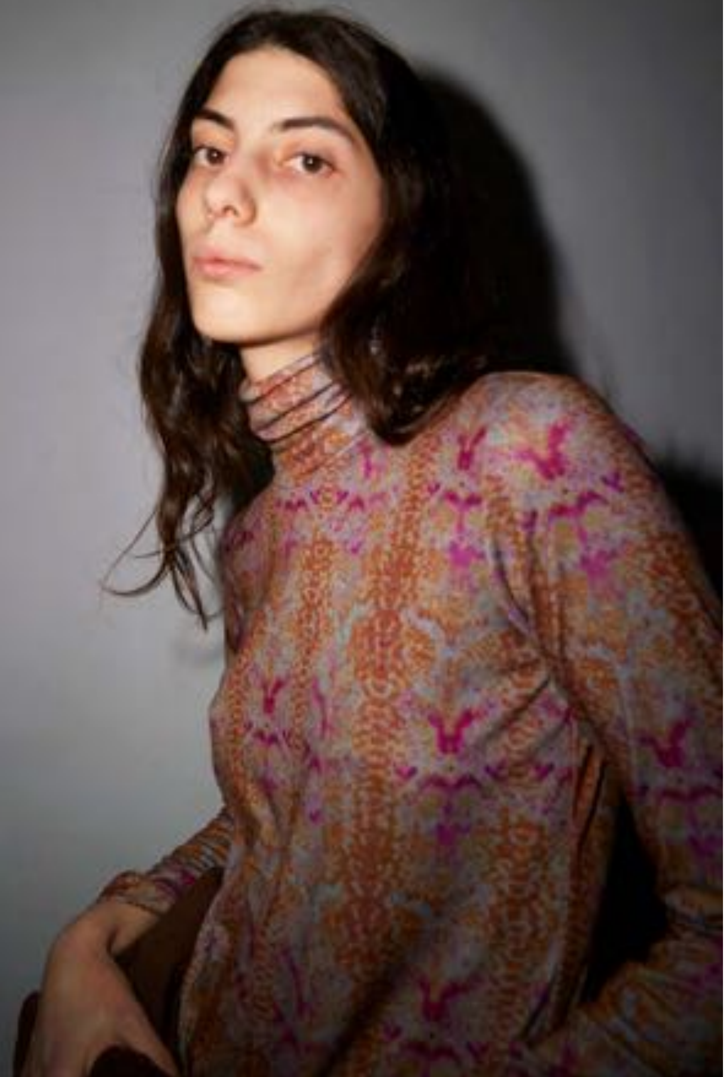
SCOUT TURTLENECK IN ROUGE PYTHON JERSEY