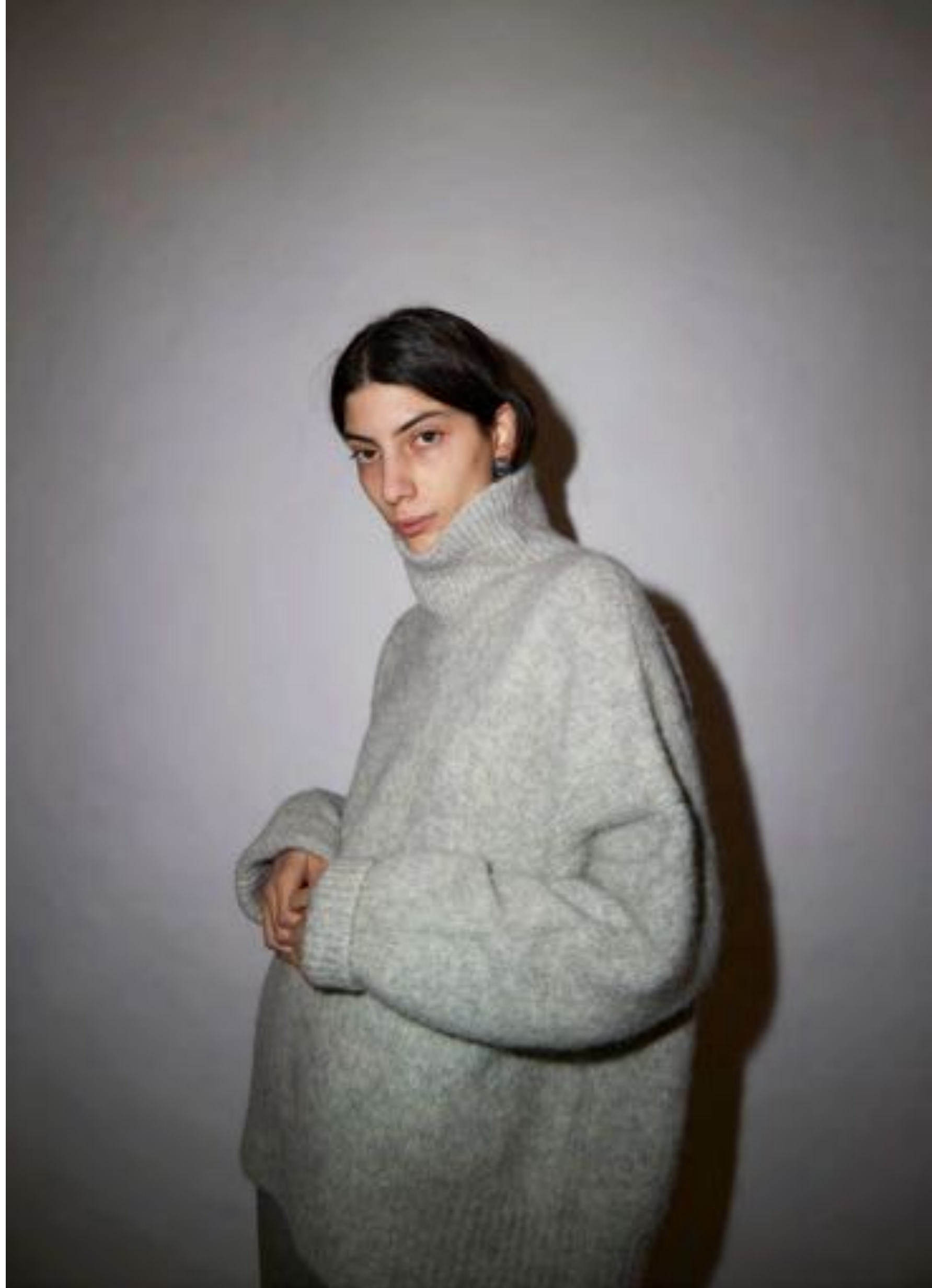
KALEN SWEATER IN SILVER ALPACA