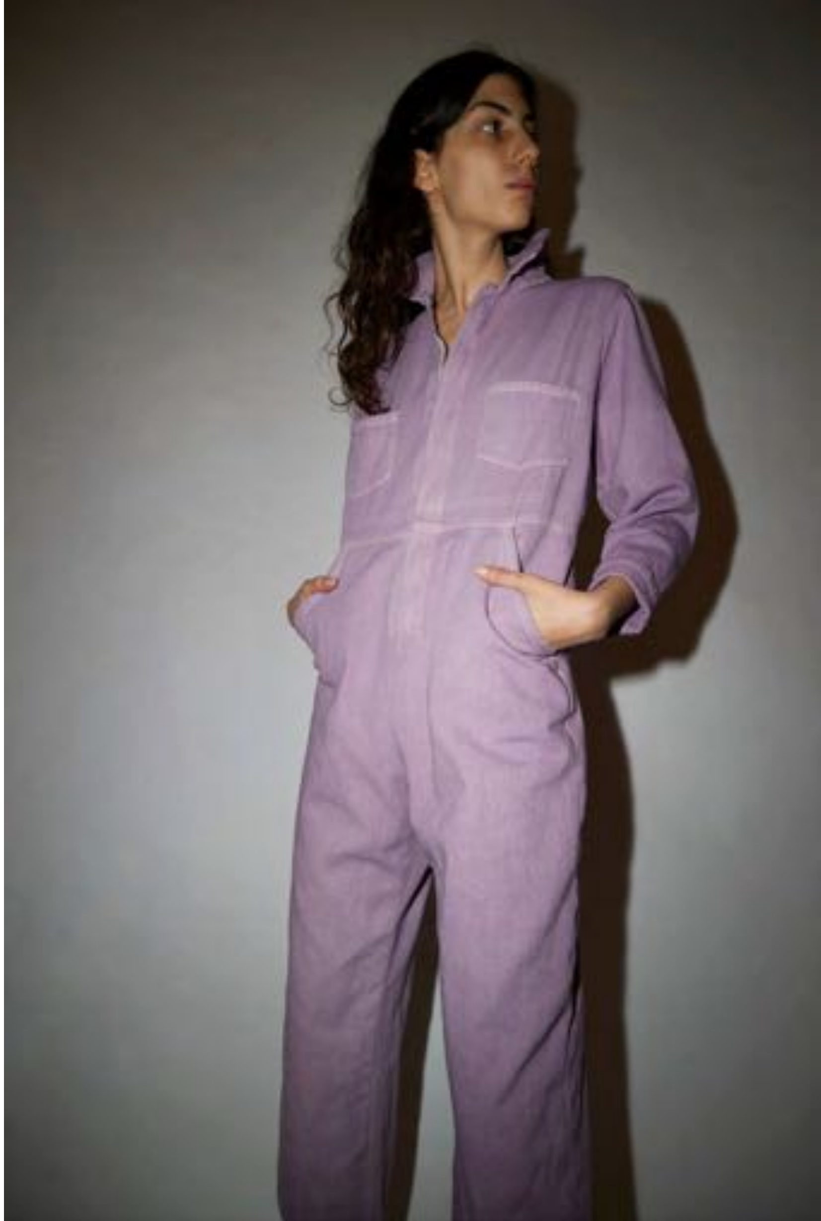
MARLON JUMPSUIT IN LILAC TWILL