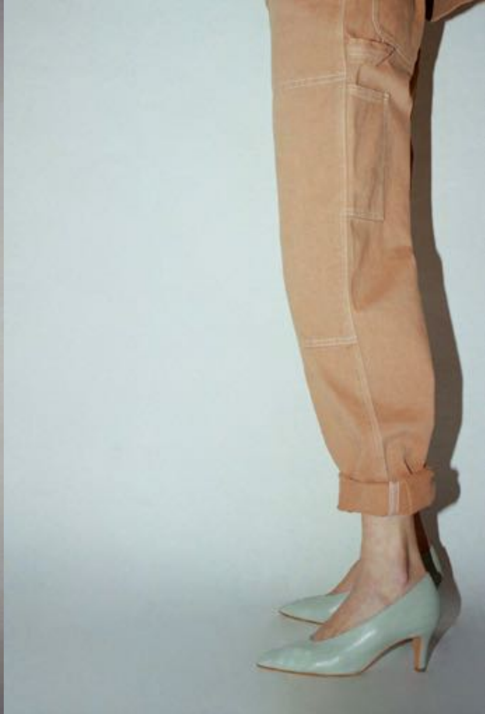
JACKSON PANT IN DESERT DENIM