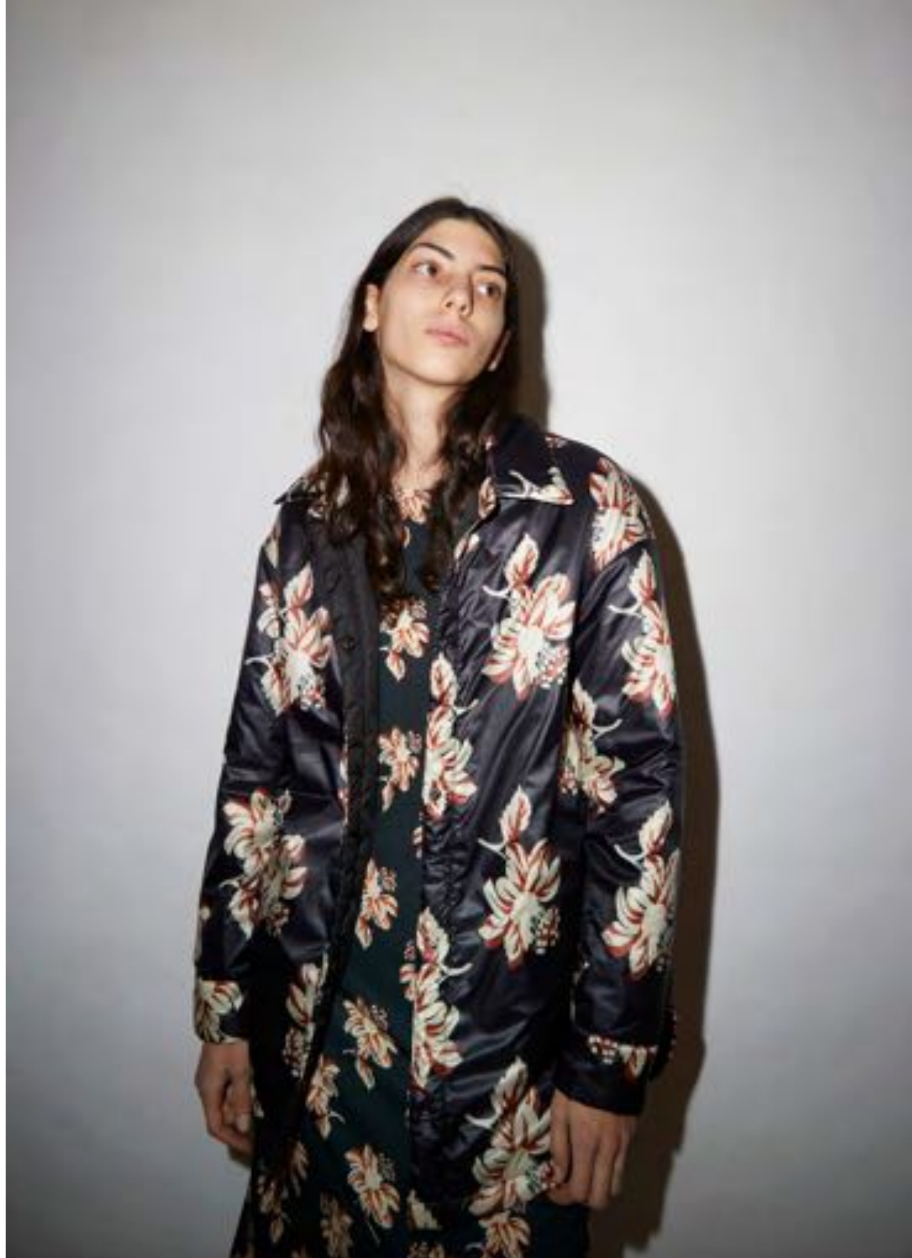
RYANN JACKET AND AKI DRESS IN BLACK CREME JACQUARD FLORAL