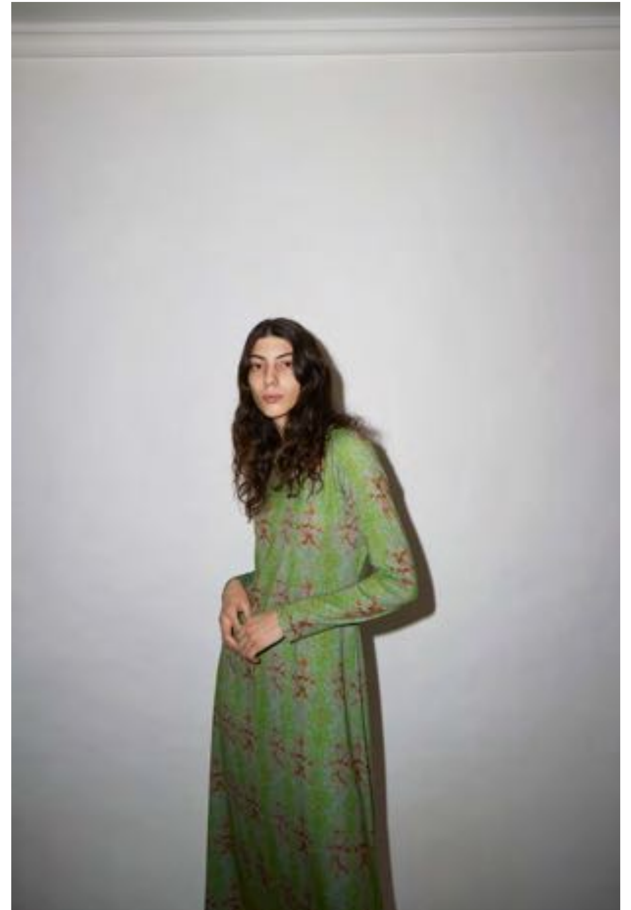
AKI DRESS IN LIME PYTHON JERSEY