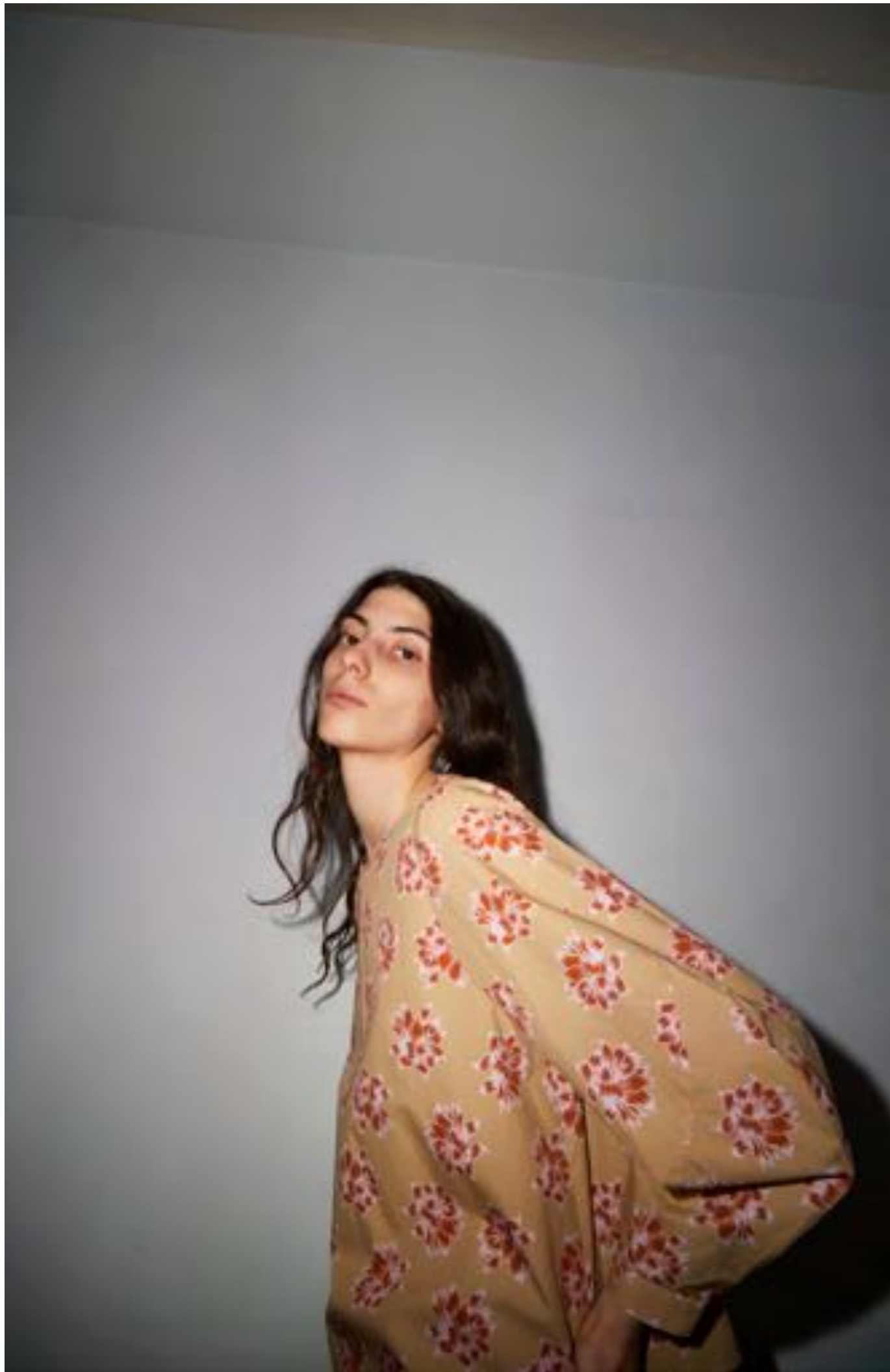
BERRY TOP IN CAMEL STARFLOWER POPLIN