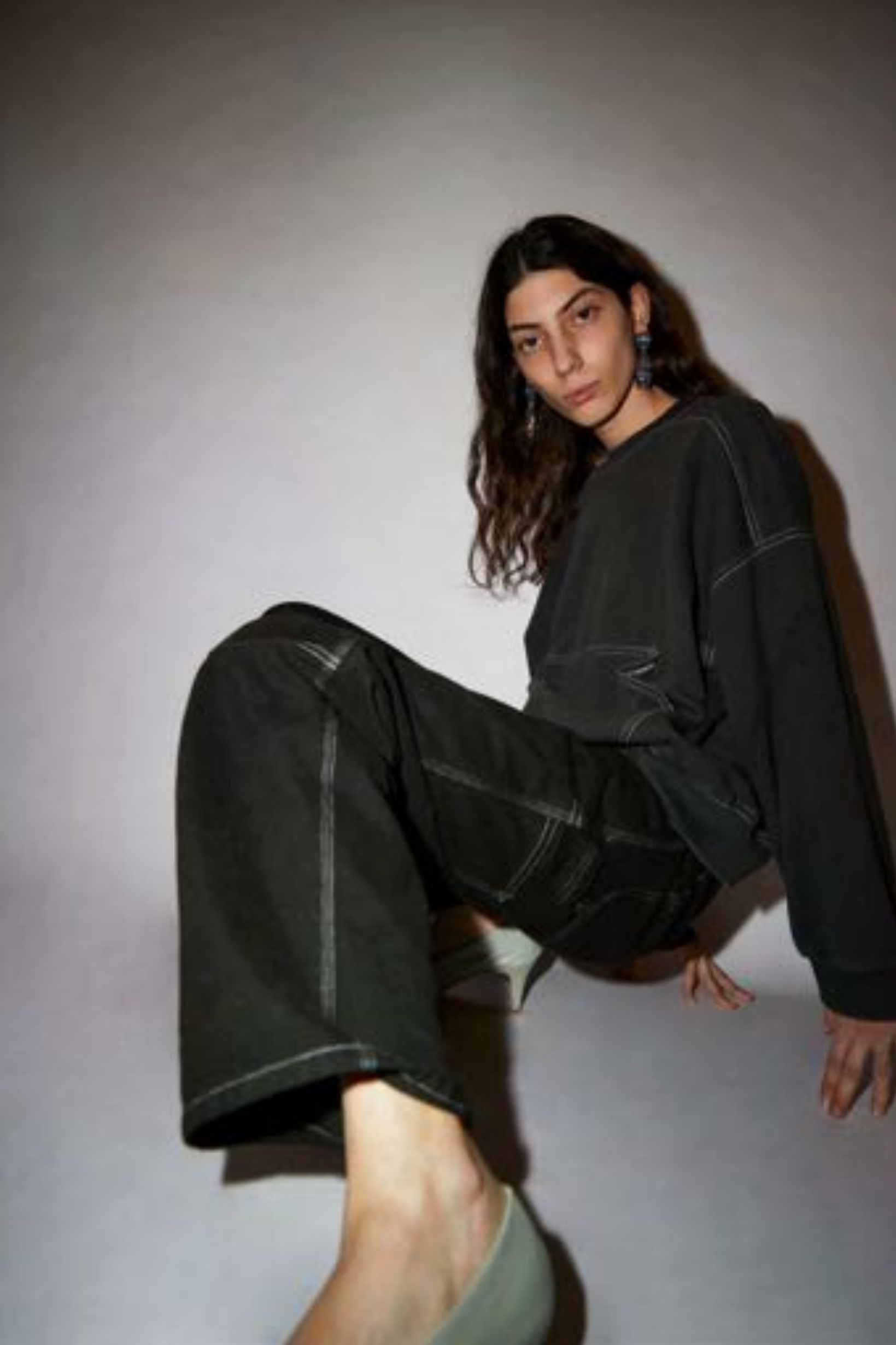
SMITH SWEATSHIRT IN OLIVE / JACKSON PANT IN OLIVE BULL DENIM