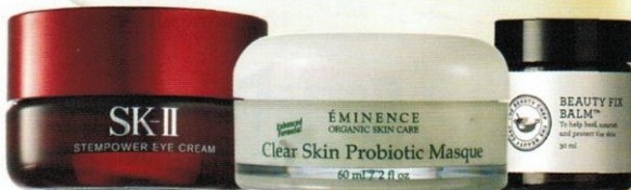
From left: SK-II Stempower Eye Cream, $149; Éminence Clear Skin Probiotic Masque, $92; The Beauty Chef Beauty Fix Balm, $24.95.

The ethereal beauty and all-round living legend is the newest face of Nars Cosmetics — joining the recent spate of fabulous women in the 40-plus bracket winning coveted beauty contracts. Swinton's predecessors at the brand include Charlotte Rampling, 68, and Daphne Guinness, 47, while Jessica Lange, 65, fronted a series of Marc Jacobs Beauty campaigns earlier this year. We love Swinton's slightly off-centre approach to fashion (pyjamas on the red-carpet, anyone?), plus her flawless porcelain skin makes a case for sunscreen everywhere. A total of four portraits were shot by the company's founder, François Nars, each portraying the 53-year-old actor in a different light, which will translate into character-driven makeup collections. Look out for the full range, available in early 2015.