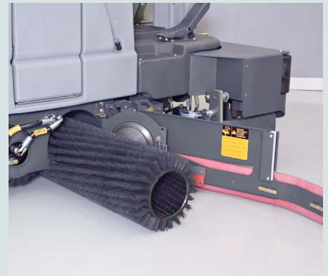
Maintenance is quick because replacement and adjustment of squeegee blades, side blades, and brushes require no tools.