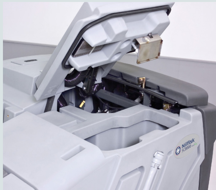
Cleaning of the machine is easy thanks to the tip out recovery tank opening with debris tray.