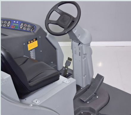
The new Kubota engine improves user comfort through reduced vibration.