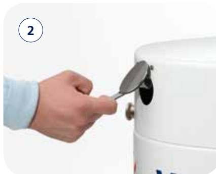
PULLCLEAN FILTER CLEANING SYSTEM