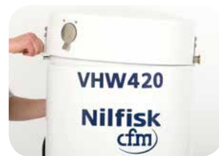
NEW HEAD LOCKING SYSTEM