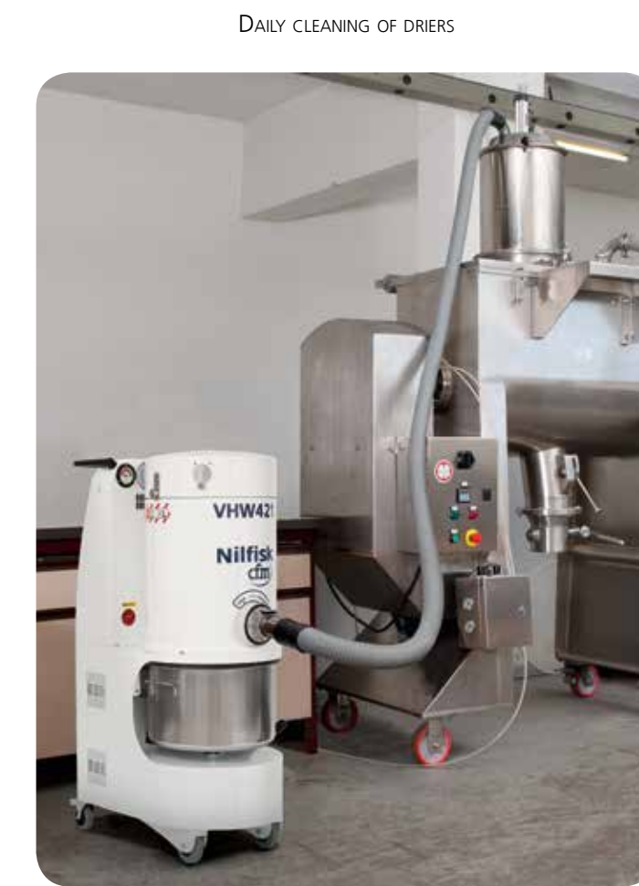
DAILY CLEANING OF DRIERS