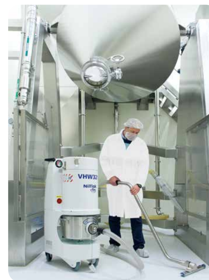
SANITIZING THE PRODUCTION AREA