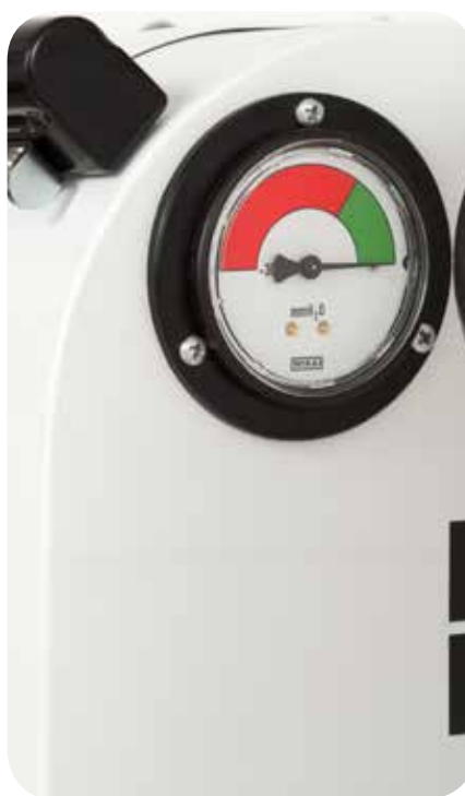
PERFORMANCE UNDER CONTROL