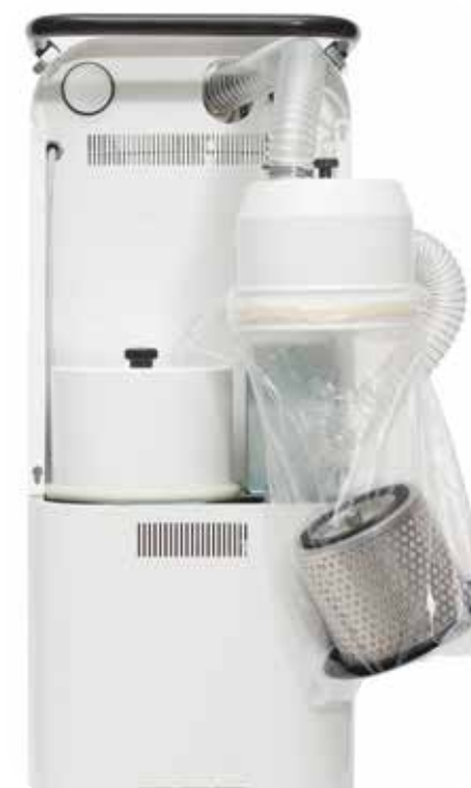
SAFE REPLACEMENT OF THE ABSOLUTE FILTER