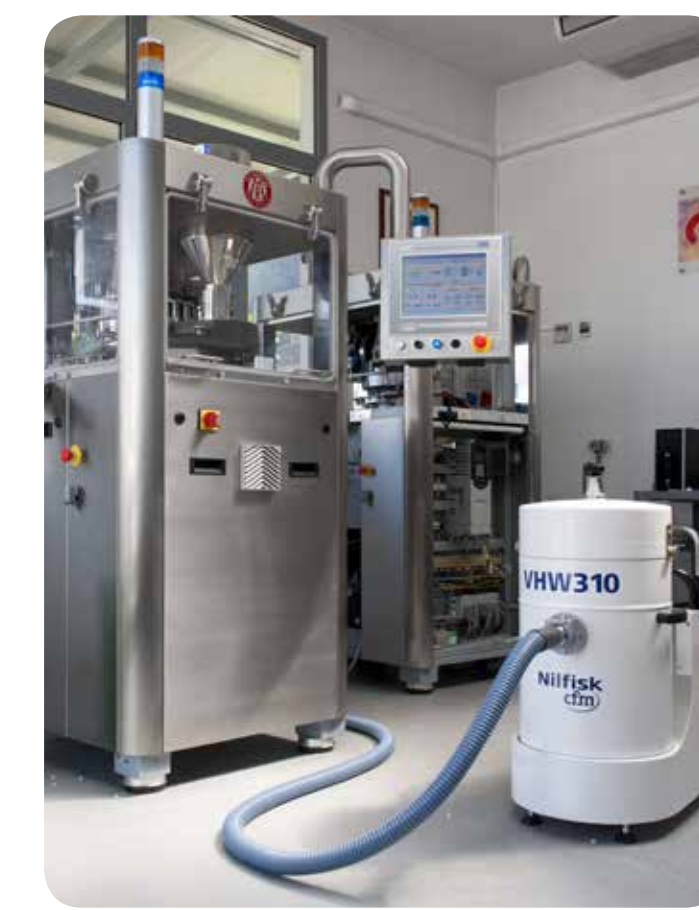
FIXED VACUUM ON PROCESSING MACHINE