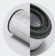
HEPA filter - optional (KVAC27L / KVAC10L)