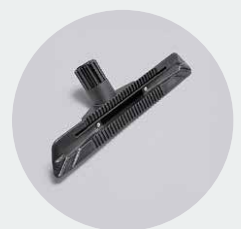
Carpet tool - optional (KVAC27L)

Kerrick Australia 1300 KERRICK (1300 537 742) sales@kerrick.com.au www.kerrick.com.au