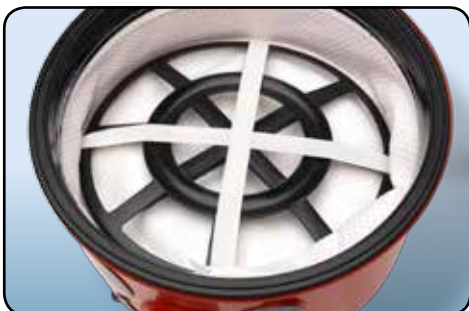
TriTex and HepaFlo high efficiency filtration system