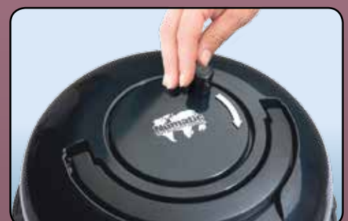
10m cable rewind and storage system