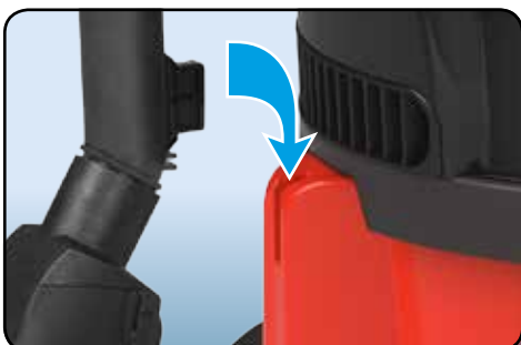
Wand docking system