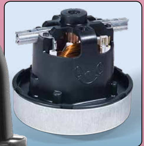
Numatic high efficiency long life motor