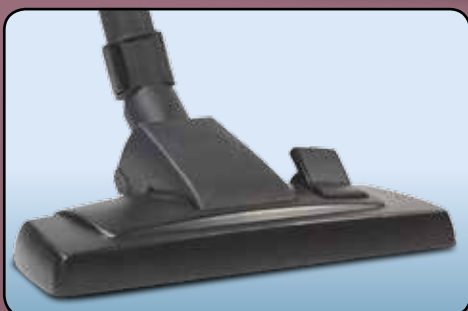
ProFlo high efficiency combination floor tool