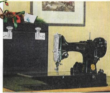
Featherweight marvel. This 11-pound Singer portable is another sewing wonder. It's about as big as a minute, yet it sews backward and forward, stitches over pins, has tension and stitch controls that eliminate guess work . . . just like the big de luxe machines. Comes in light luggage case.

Free with purchase of every Singer sewing machine or vacuum cleaner—a full personal course in dressmaking or home decorating at your Singer Sewing Center. Free check-ups and adjustments by your Singer Service Man.