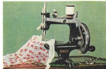
Thrill for Betsy. This Junior Singer makes perfect Singer stitches, just like a grown-up machine. It's safe even for tiny girls, with a needle guard to protect the fingers. Betsy can make real dolly clothes on it . . . and even things for herself!