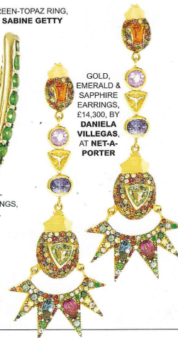
GOLD, EMERALD & SAPPHIRE EARRINGS, £14,300, BY DANIELA VILLEGAS, AT NET-A- PORTER