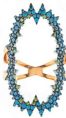
ROSE-GOLD, BLUE- & GREEN- DIAMOND RING, £3,550 BY DIANE KORDAS