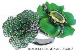
BLACK-RHODIUM-PLATED-GOLD, BROWN-DIAMOND, TSAVORITE, CHRYSOBERYL & TURQUOISE RING, POA, BY LYDIA COURTEILLE