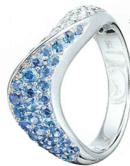
WHITE-GOLD, DIAMOND & SAPPHIRE RING, POA, BY ADLER