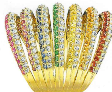
GOLD, DIAMOND, EMERALD & SAPPHIRE RING, £10,000, BY SYBARITE