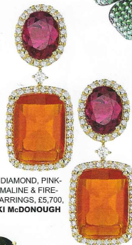
GOLD, DIAMOND, PINK- TOURMALINE & FIRE- OPAL EARRINGS, £5,700, BY KIKI McDONOUGH