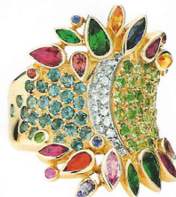
ROSE-GOLD, DIAMOND, RUBY, SAPPHIRE, TANZANITE, TSAVORITE, GARNET, TOPAZ, & FIRE-OPAL RING, POA, BY WEMPE