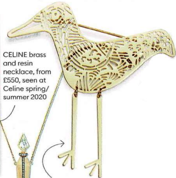
CELINE brass and resin necklace, from £550, seen at Celine spring/summer 2020