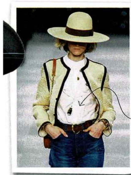
DIANE KORDAS rose-gold and diamond necklace, £15,380, net-a-porter.com

Designers are inventing new ways to wear scent. By Baya Simons