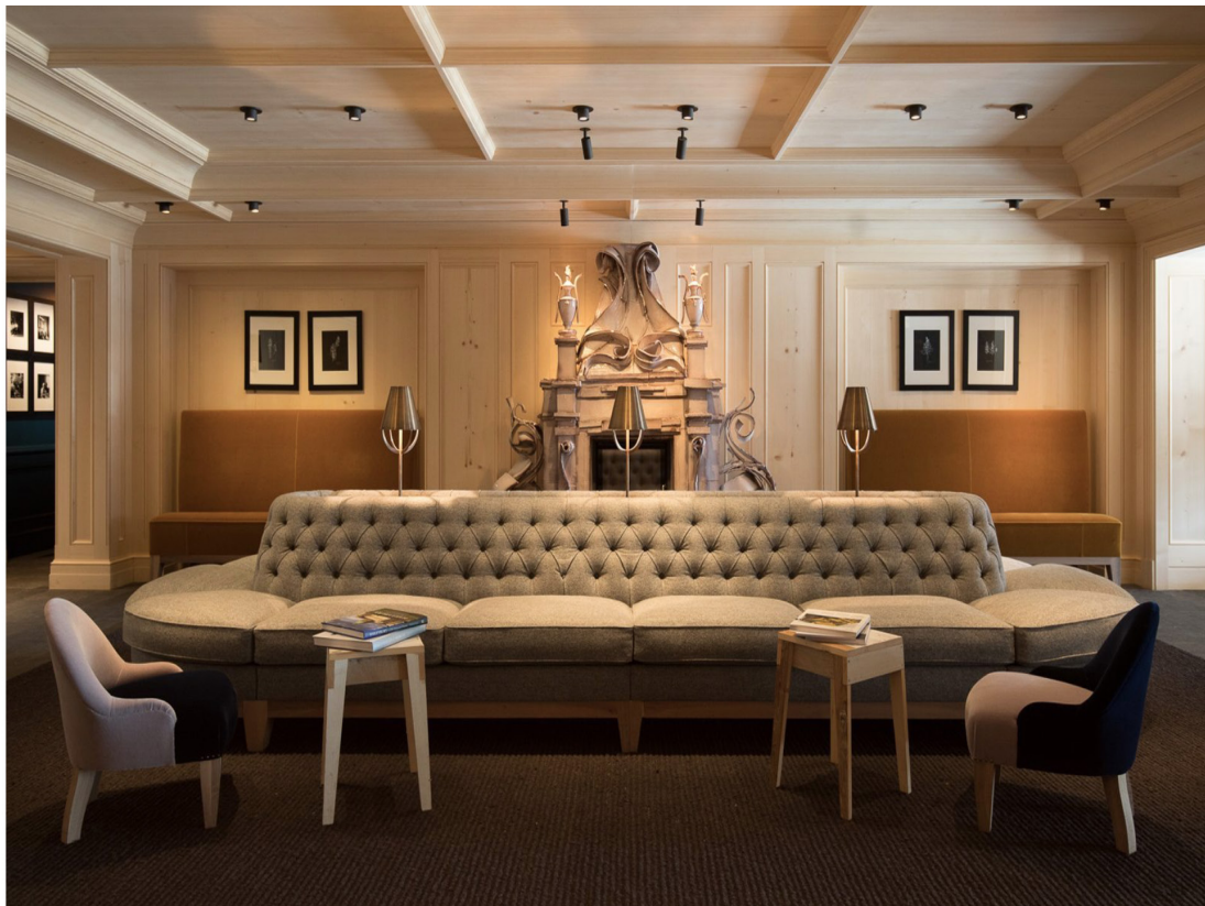
The Almhof Schneider in Lech, Austria.

That's a tough one! It fluctuates between my diamond perfume amulet, armour rings and Lady/Boss spinning ID tag... Sometimes even altogether.