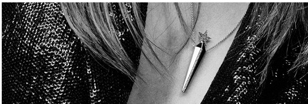
Diane Kordas' Amulette collection.