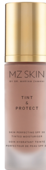
MZ Skin / Tint & Protect lightweight SPF 30, tinted daytime moisturiser