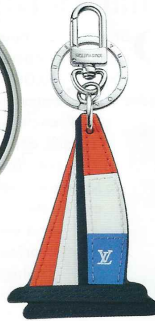
LOUIS VUITTON LV America's Cup boat-key holder, £190 uk.louisvuitton.com