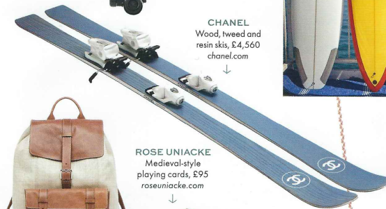
CHANEL Wood, tweed and resin skis, £4,560 chanel.com