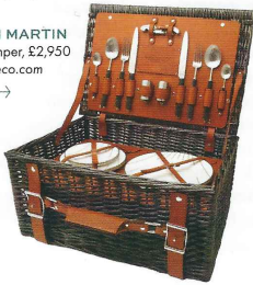
ASTON MARTIN Picnic hamper, £2,950 luxdeco.com