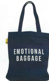
THE SCHOOL OF LIFE Canvas tote, £35 theschooloflife.com