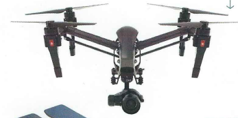
DJI DRONE Inspire 1 Pro Black Edition, £3,559 store.dji.com