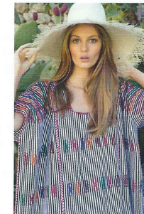
PIPPA HOLT Kafan no. 40, £795 matchesfashion.com

PIXELEVES PHOTOGRAPHY (LUGGAGE TAGS, SHOE CARE); PRICES CORRECT AT TIME OF GOING TO PRESS BUT MAY VARY