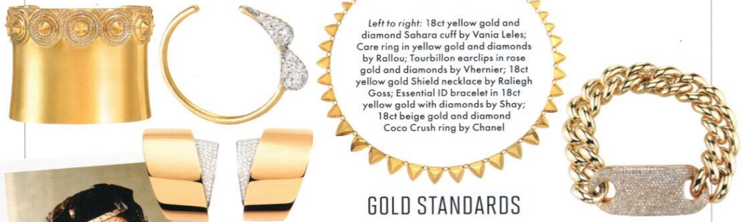
Left to right: 18ct yellow gold and diamond Sahara cuff by Vania Leles; Care ring in yellow gold and diamonds by Rallou; Tourbillon earclips in rose gold and diamonds by Vhernier; 18ct yellow gold Shield necklace by Raliegth Goss; Essential ID bracelet in 18ct yellow gold with diamonds by Shay; 18ct beige gold and diamond Coco Crush ring by Chanel