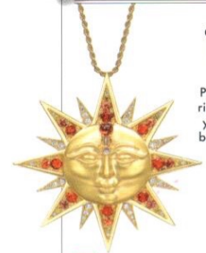
Clockwise from left: Surya pendant by Venyx; Possession open bangle by Piaget; Ice Cube Pure ring by Chopard; 18ct yellow gold five-row bead bracelet by Ilias Lalaounis; Serpent Bohème ring by Boucheron