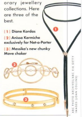
ABC PHOTO ARCHIVES/ABC VIA GETTY IMAGES (JOAN COLLINS)