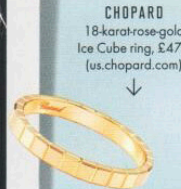
CHOPARD 18-karat-rose-gold Ice Cube ring, £471. (us.chopard.com)