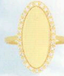
JENNIFER MEYER 18-karat-yellow-gold oval ring with diamond edge, £1,986. (net-a-porter.com)