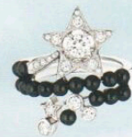
CHANEL Nuit de Diamant 18-karat-white-gold ring, £8,950. (chanel.com/en_GB)