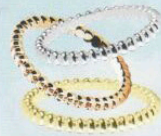
VAN CLEEF & ARPELS Perle rings featuring small beads (from top): 18-karat-white-gold, £625; 18-karat-rose-gold, £575; 18-karat-yellow-gold, £575. (vancleefarpels.com/eu/en)