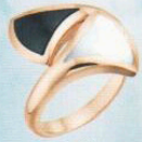
BULGARI Diva ring in pink gold and mother-of-pearl, £1,760. (bulgari.com)