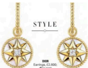
DIOR Earrings, £2,600; dior.com