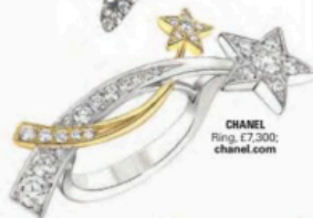
CHANEL Ring, £7,300; chanel.com