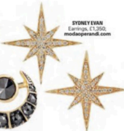
SYDNEY EVAN Earrings, £1,350; modaoperandi.com