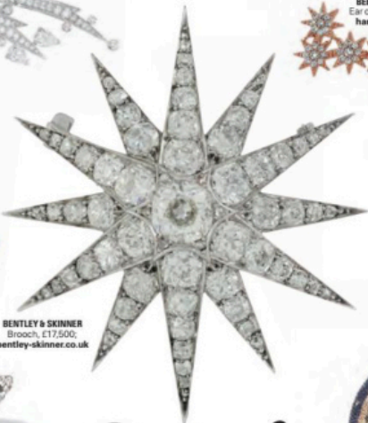
BENTLEY & SKINNER Brooch, £17,500; bentley-skinner.co.uk