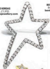
DIANE KORDAS Ring, £1,910; dianekordasjewellery.com