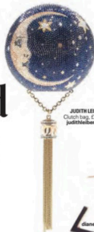
JUDITH LEIBER Clutch bag, £3,900; judithleiber.com