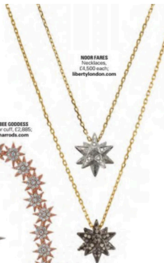
BEE GODDESS Ear cuff, £2,885; harrods.com