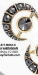
KATE MOSS X ARA VARTAMAN Earrings, £2,600; harveynichols.com