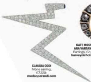
CLAUDIA ODDI Mono earring, £7,320; modaoperandi.com