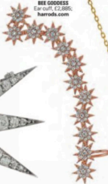
BEE GODDESS Ear cuff, £2,885; harrods.com