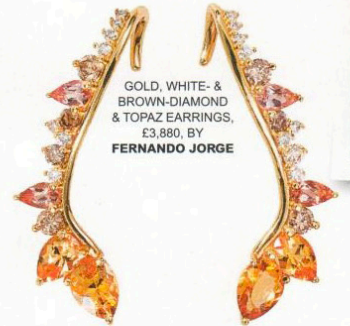
GOLD, WHITE- & BROWN-DIAMOND & TOPAZ EARRINGS, £3,880, BY FERNANDO JORGE