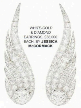
WHITE-GOLD & DIAMOND EARRINGS, £38,000 EACH, BY JESSICA McCORMACK