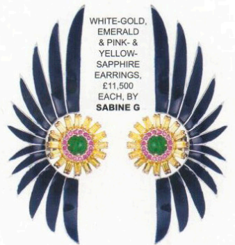
WHITE-GOLD, EMERALD & PINK- & YELLOW-SAPPHIRE EARRINGS, £11,500 EACH, BY SABINE G