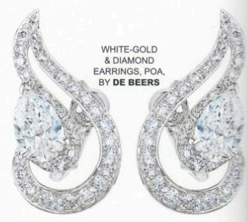
WHITE-GOLD & DIAMOND EARRINGS, POA, BY DE BEERS