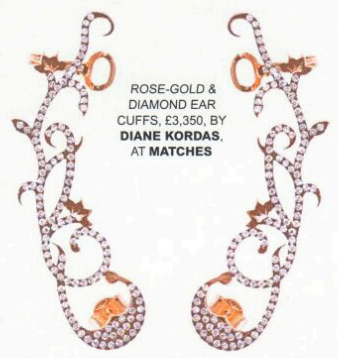
ROSE-GOLD & DIAMOND EAR CUFFS, £3,350, BY DIANE KORDAS , AT MATCHES