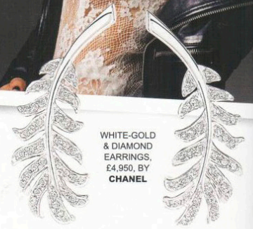
WHITE-GOLD & DIAMOND EARRINGS, £4,950, BY CHANEL