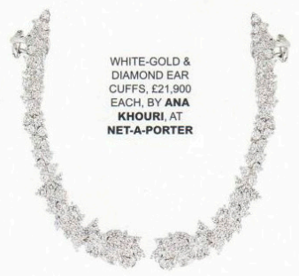
WHITE-GOLD & DIAMOND EAR CUFFS, £21,900 EACH, BY ANA KHOURI , AT NET-A-PORTER

Why must earrings dangle? Why can't they slither and entice? Why can't they suck on your earlobe and nibble the cartilage? Why can't they nestle into the shell like a curious, glittering tongue? Well, of course they can, and will, and do. More and more, the ear cuff and the snakingly intrepid earring are featuring on high-end ears. Risqué and edgy, they may shock – but they will also titillate. And you don't need big tits or great legs for this kind of sexy. It's the attitude kind of sexy. The best kind. AR