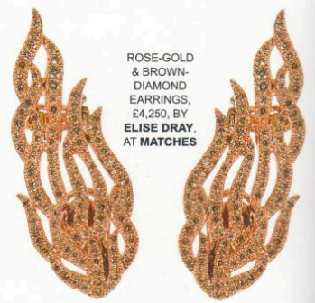
ROSE-GOLD & BROWN-DIAMOND EARRINGS, £4,250, BY ELISE DRAY , AT MATCHES