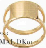
RING 172804 BY DINA KAMAL DKO1

The Lebanese architect launched her jewellery line in 2010. Beige gold has become a signature metal of her modern interpretations.