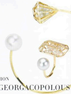
RING 165048 BY ALISON LOU

A trained sculptor, this Greek/French designer, who is based in London, exhibits an appreciation of simplicity and a respect for natural materials in her architectural pieces, using pearls and white gold.