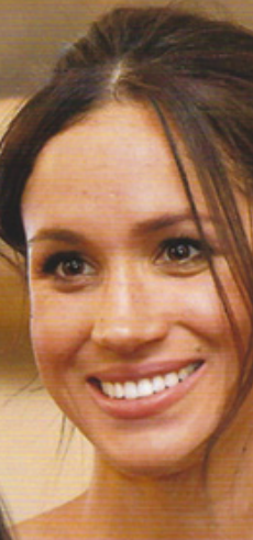
MEG ME CAMILLA WORDS BRID