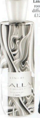
Linari room diffuser £129