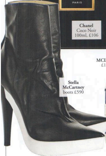
Stella McCartney boots £590