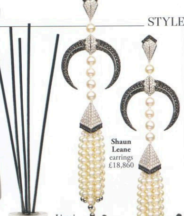
Shaun Leane earrings £18,860