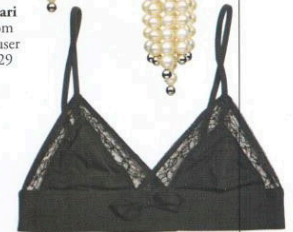
Princesse Tam Tam bra £42 and briefs £42