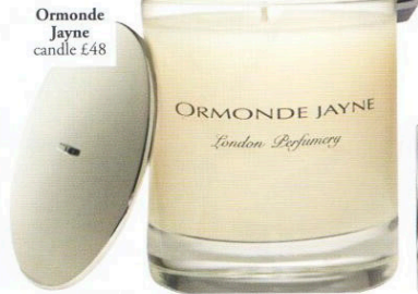
Ormonde Jayne candle £48