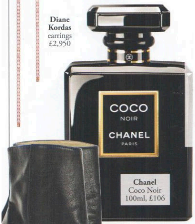
Diane Kordas earrings £2,950