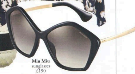
Miu Miu sunglasses £190

Available from Luxury Accessories, Lower Ground and Ground Floor; The Cosmetics and Perfumery Halls, Luxury Jewellery and Sunglasses, Ground Floor; Designer Studio, Lingerie and The Shoe Salon, First Floor; Entertaining at Home, Second Floor; and harrods.com. To discover more, download the December digital edition of Harrods Magazine from the App Store or visit harrods magazine.com