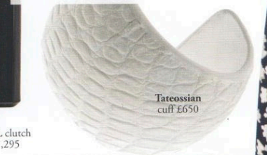
Tateossian cuff £650