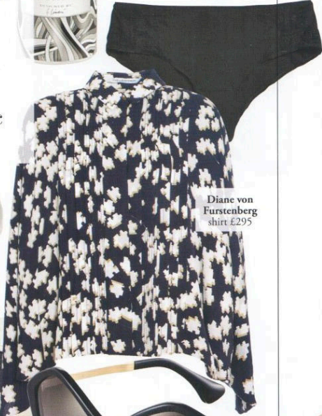
Diane von Furstenberg shirt £295

This season's dalliance with Deco puts a decorous spin on classic black and white