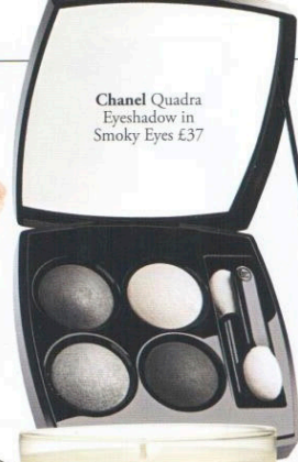
Chanel Quadra Eyeshadow in Smoky Eyes £37