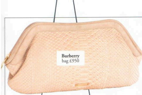
Burberry bag £950