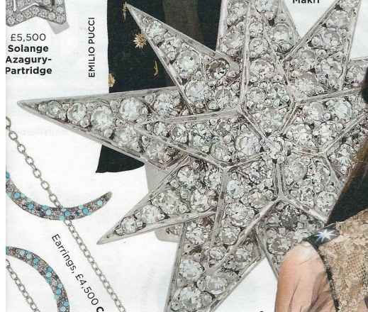
Ring, £7,080 Ileana Makri