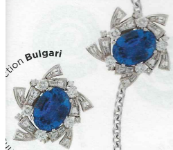
Collection Bulgari Earrings