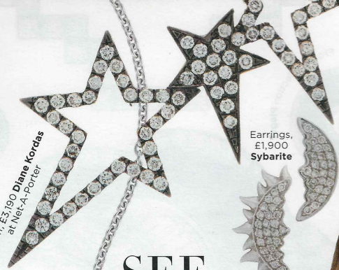
Earrings, £1,900 Sybarite