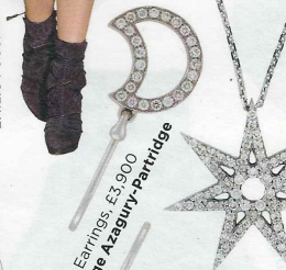
Earrings, £3,900 Solange Azagury- Partridge