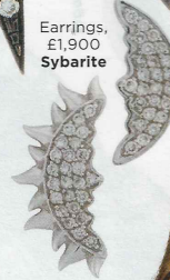
Earrings, £1,900 Sybarite