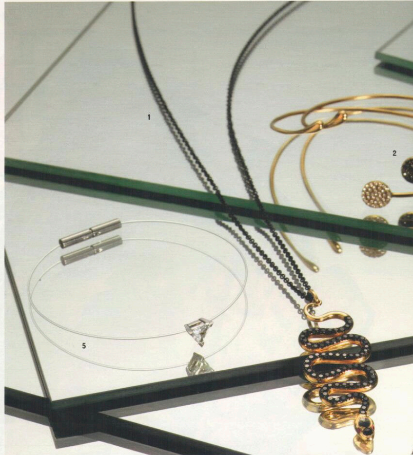
1. Snake pendant necklace, £2,788, Ileana Makri at Net-A-Porter. 2. Bangle with black diamonds, £441, and bangle with white diamonds, £510, both Diane Kordas at Harrods. 3. Gatsby necklace, £1,650, Messika at Frost of London. 4. Ava earrings, £890, Monica Vinader. 5. Bracelet, £1,470, Alexander Fuchs at Kabiri