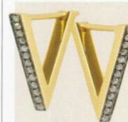
Triangle earrings in diamonds, yellow gold and black rhodium, £950. noorfans.com