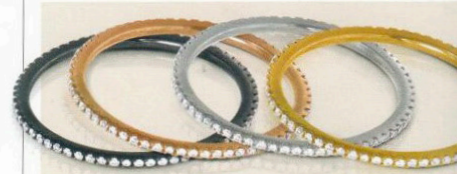
Vogue rings in rose, white, yellow and black gold, platinum and diamonds, from £440. 77diamonds.com