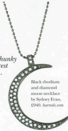
Black rhodium and diamond moon necklace by Sydney Evan, £940. harrods.com