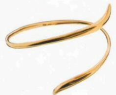
TUSK CUFF IN ROSE GOLD VERMEIL, £220. dinnyhall.co.uk