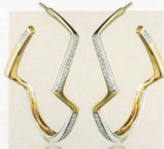
Contour hoop earrings in yellow gold and diamonds, £3,060. karavossny.com