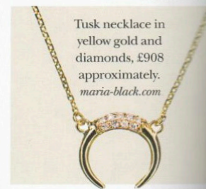
Tusk necklace in yellow gold and diamonds, £908 approximately. maria-black.com