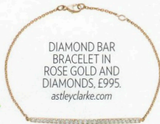
DIAMOND BAR BRACELET IN ROSE GOLD AND DIAMONDS, £995. astleyclarke.com