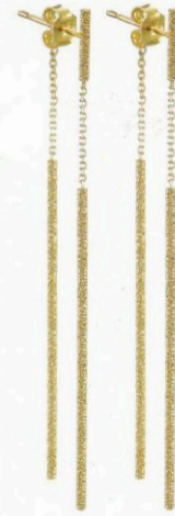
Gitane gold earrings, £525. carolinabucci.com