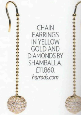
CHAIN EARRINGS IN YELLOW GOLD AND DIAMONDS BY SHAMBALLA, £11,860. harrods.com