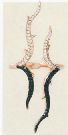
Horn ring in rose gold, white and black diamonds by Diane Kordas, £3,450. net-a-porter.com