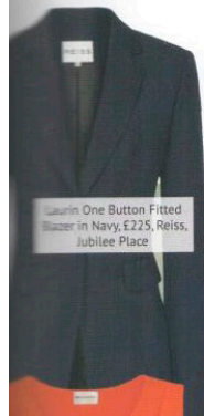
Lauren One Button Fitted Blazer in Navy, £225, Reiss, Jubilee Place

It is both cheerful and cool, and a loose fitting top paired with a slim-fit navy suit will keep the bold hue sophisticated. Keep accessories minimal and enjoy the excuse to wear flats – they complement a more laid-back look.