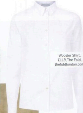
Wooster Shirt, £119, The Fold, thefoldlondon.com