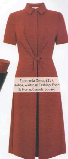
Euphemia Dress, £127, Hobbs, Waitrose Fashion, Food & Home, Canada Square