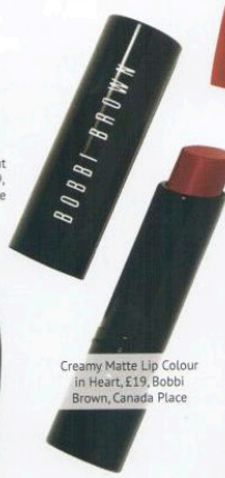
Creamy Matte Lip Colour in Heart, £19, Bobbi Brown, Canada Place