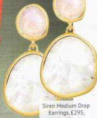
Siren Medium Drop Earrings, £295, Monica Vinader, Jubilee Place