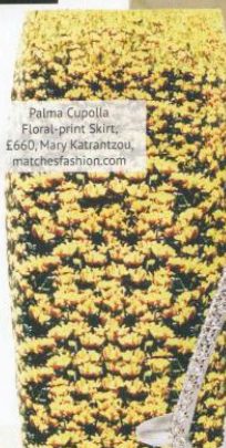
Palma Cupolla Floral-print Skirt, £660, Mary Katrantzou, matchesfashion.com