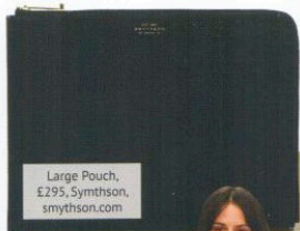
Large Pouch, £295, Smythson, smythson.com