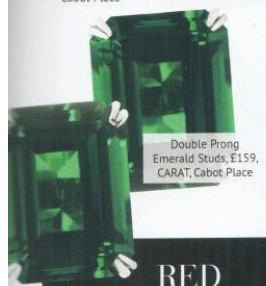
Double Prong Emerald Studs, £159, CARAT, Cabot Place