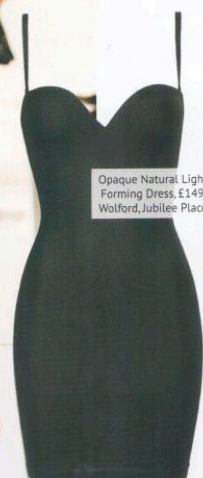
Opaque Natural Light Forming Dress, £149, Wolford, Jubilee Place