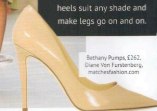
Bethany Pumps, £262, Diane Von Furstenberg, matchesfashion.com