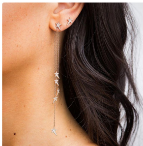
"Twinkle Twinkle" @dianekordasjewellery