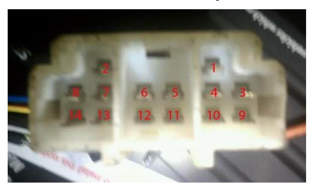
Z32 Underdash Connector Wiring