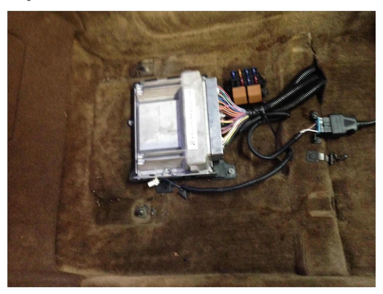
**NOTE: Installing the ECU in the space located above using the available ECU bracket will require drilling into the floorboard of the car. THE BRAKE LINES ARE UNDER THE SCREWS! TAKE EXTREME CAUTION WHEN DRILLING THESE HOLES!! Clearance between the top of the ECU and the underside of the seat is tight. This can make sliding the seat front/back difficult due to cables under the seat catching on the ECU.