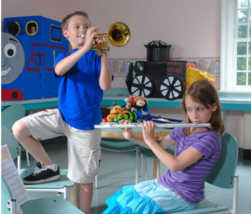
Example of the ALZO PORTA-FLASH 2 LIGHT LOCATION KIT used with an ALZO FLIP FLASH® BRACKET SOFTBOX KIT