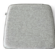
INDOOR, LIGHT GREY 9575130