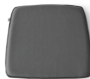
OUTDOOR, DARK GREY 9585150