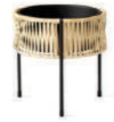
BLACK / RATTAN 5710539