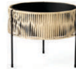
BLACK / RATTAN 5711539