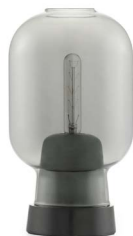
Amp Table Lamp H: 26,5 x Ø14 cm