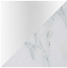
White glass / White marble