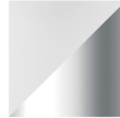
Matt/White / Zinc