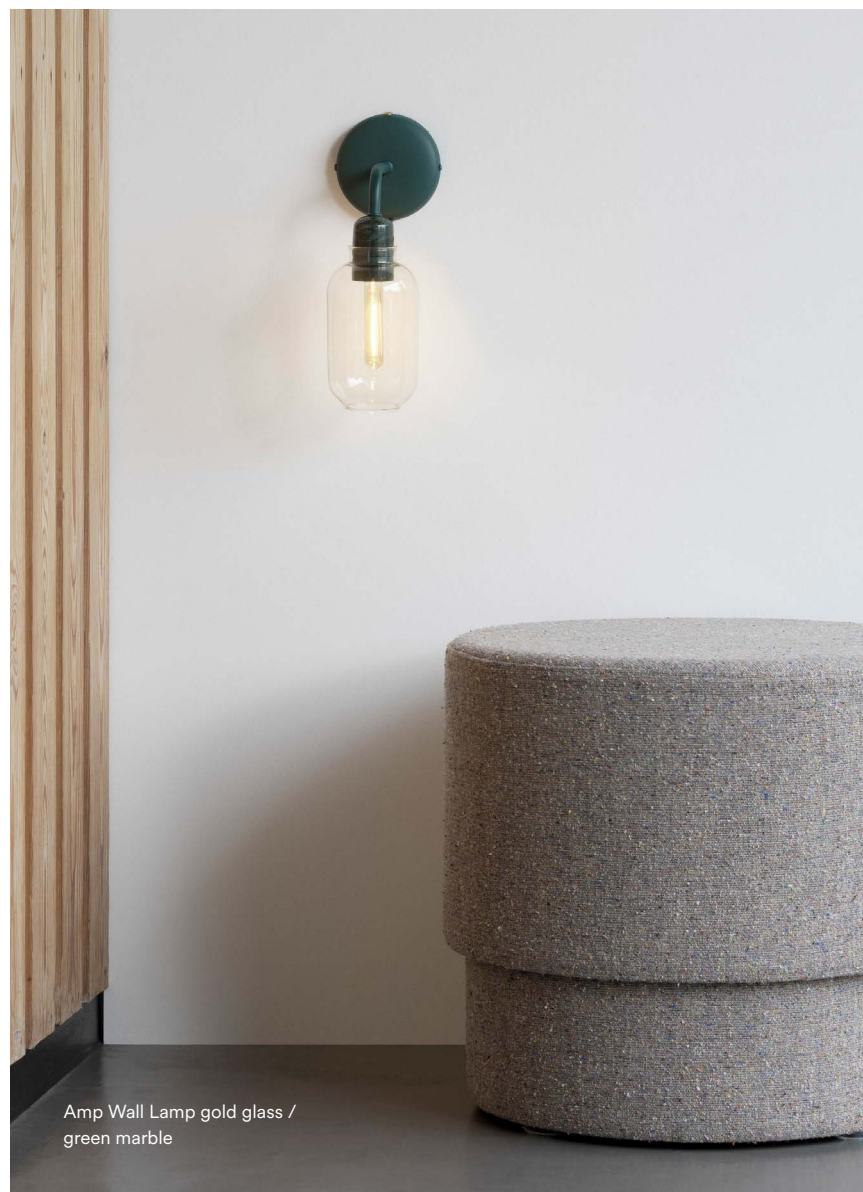
Amp Wall Lamp gold glass / green marble