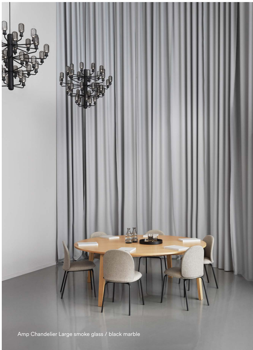
Amp Chandelier Large smoke glass / black marble