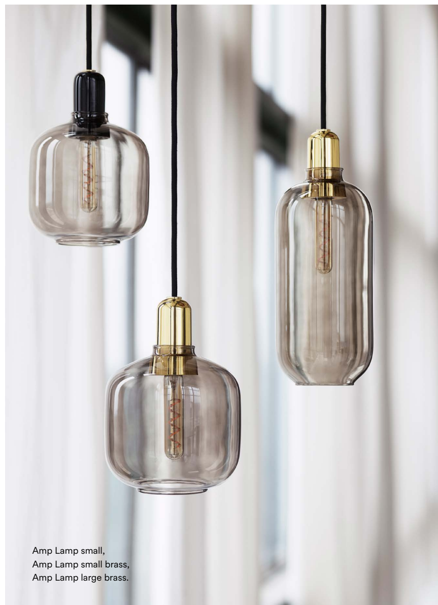
Amp Lamp small, Amp Lamp small brass, Amp Lamp large brass.