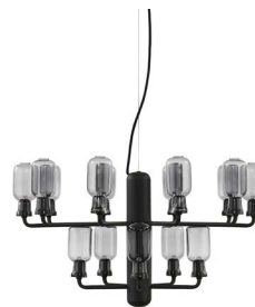
Amp Chandelier small H: 32,5 x Ø62,5 cm