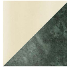
Gold glass / Green marble