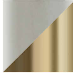
Smoke glass / Brass