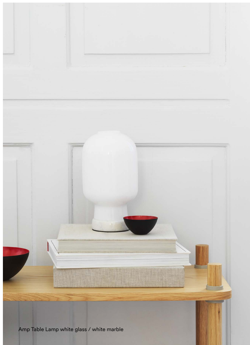
Amp Table Lamp white glass / white marble