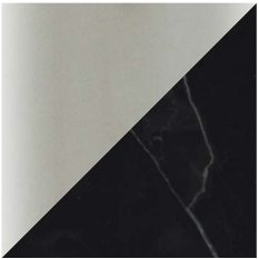
Smoke glass / Black marble