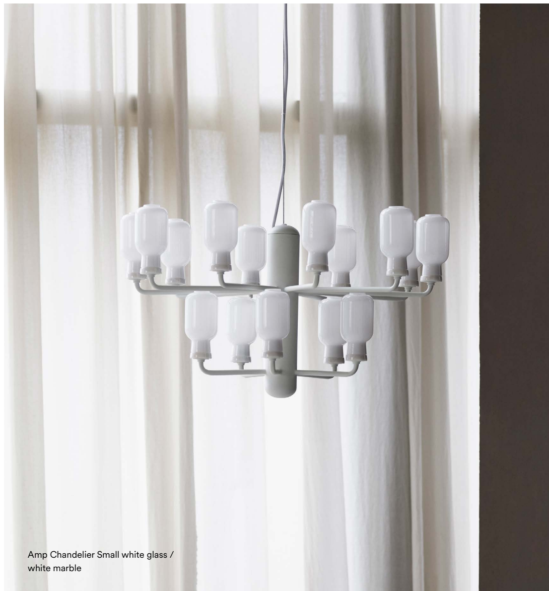
Amp Chandelier Small white glass / white marble