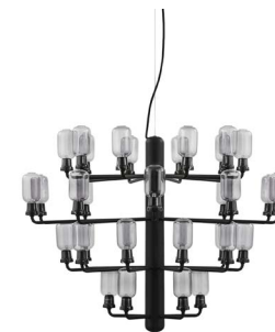
Amp Chandelier large H: 62,5 x Ø85 cm