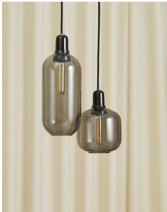
Amp Pendant Large and small smoke glass / black marble