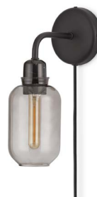
Amp Wall Lamp H: 30,5 x L: 11 x D: 17 cm