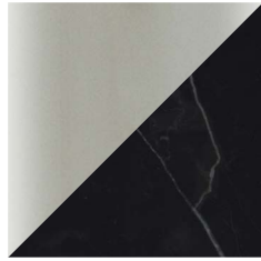
Smoke glass / Black marble