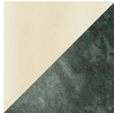
Gold glass / Green marble