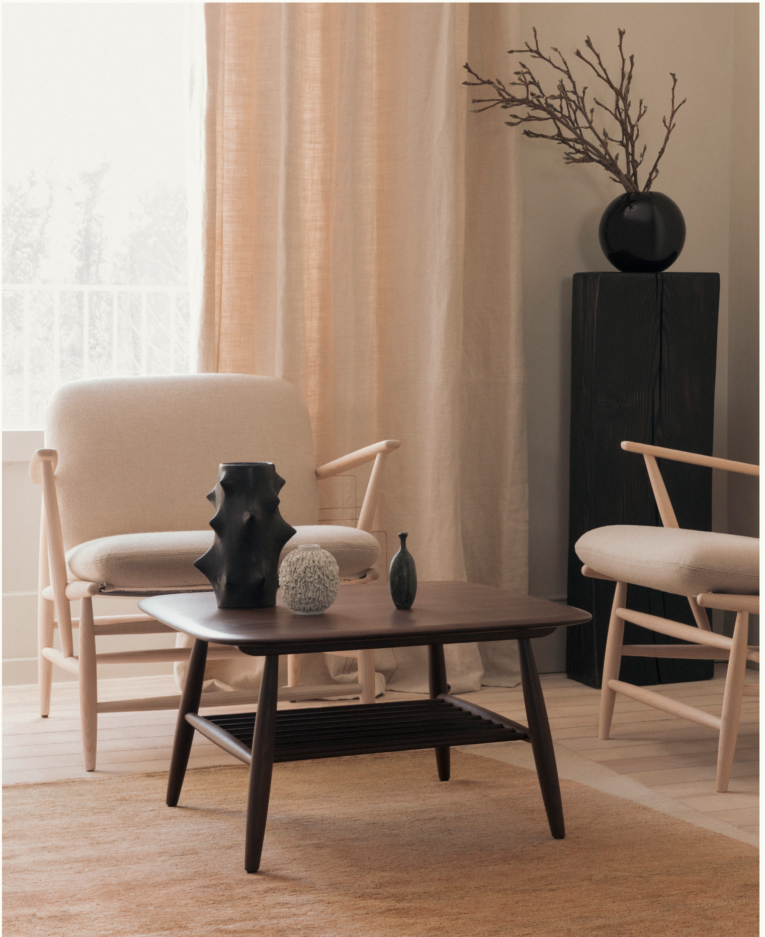
Product Sheet Von Magazine Table