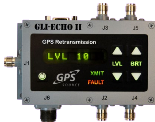
Figure 4. GLI-ECHO II LRU by GPS Source, Inc.

Further examples of successful implementation of GPS retransmission systems in ground vehicle applications include USASOC. In support ongoing activities in Afghanistan, a USASOC unit outfitted their GMV and RG-31 vehicles with GPS retransmission in 2010 to enable Land Warrior equipped Soldiers to continuously report accurate positional information. Additionally, the with system installed to the vehicles, commercial and military grade GPS receivers, such as Garmin 60 or DAGR, no longer require RF cable connection to function and receive a live GPS signal. This added capability enables soldiers to eliminate cables and splitters from their vehicle's RF signal distribution system making for a lighter and more optimized vehicle setup. The system eliminates TFFF when a squad dismounts from the vehicle to perform a mission on foot. This becomes significant during assault operations, especially at night, when quick positional updates are important. Most importantly, it eliminates the need for a team leader to open a door to achieve GPS lock, drastically reducing survivability and increasing the deadly effects of IEDs and sniper fire, as shown in Figure 1.