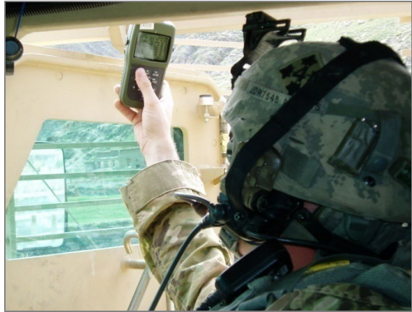
Figure 1. US Soldier Holding DAGR Through an Open Door to Acquire GPS Signal. Practices Such as This Dramatically Reduce Survivability Against a Range of Threats

With a GPS retransmission system installed in the crew compartment of a military ground vehicle and providing