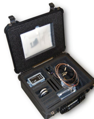
Figure 5. GPS Source's GLI Line of GPS Retransmission Kits

Examples of primary applications for kits are military Airborne units who may deploy from an aircraft and require GPS retransmission aboard vehicles acquired in the field. Units seeking an immediate solution to GPS denied locations in theater are also prime candidates for a GPS retransmission kit where optimization for a single vehicle is a lower priority than maintaining operational tempo. GPS Source provides a line of man-portable GPS retransmission kits, GPS LIVE INSIDE, or GLI, which offer an immediate solution to GPS denied vehicle applications. GLI kits are installed in the field by the Warfighter or supporting maintenance or CLS organizations. They are available with single or dual retransmit antenna capability for vehicles large or small and offer the unique features of GLI-ECHO II, including output power control, oscillation detection, BIT, and fault isolation.