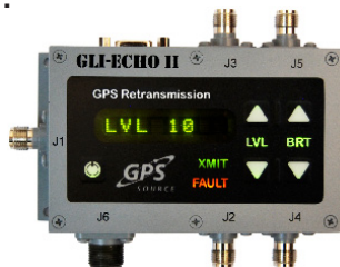
GLI-Echo II LRU