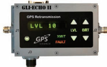
GLI-Echo II LRU