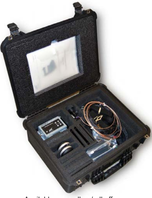
Available as a roll on/roll off or permanent install