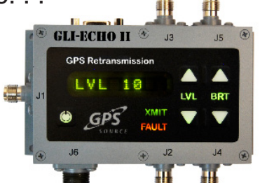
GLI-Echo II LRU