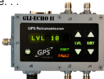
GLI-Echo II LRU