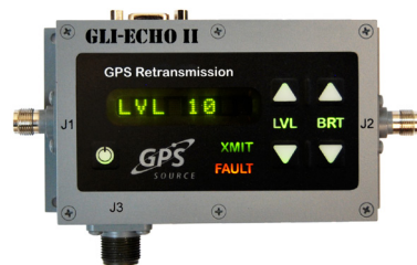
GLI-Echo II LRU