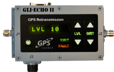
GLI-Echo II LRU