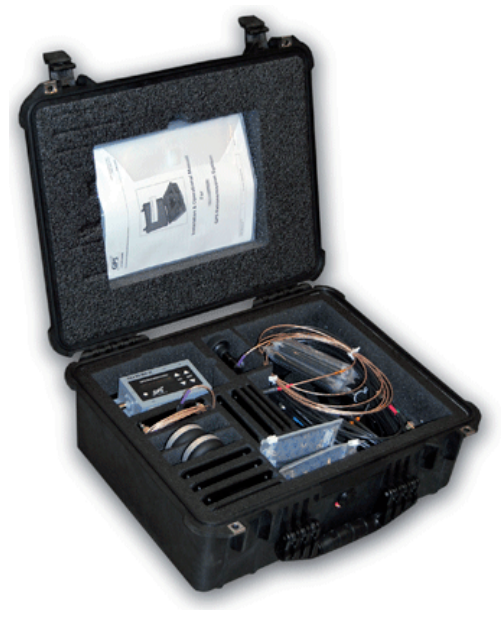
Available as a roll on/roll off or permanent install