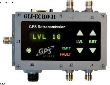
GLI-Echo II LRU