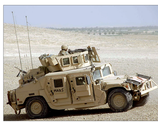
GPS Live Inside (GLI) is made by GPS Source, Inc. GPS Source helps support situational awareness by designing and building solutions that bring GPS Live Inside, eliminating costly delays and saving lives.

AS9100 & ISO 9001:2008 Certified Veteran Owned Small Business