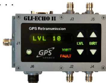
GLI-Echo II LRU