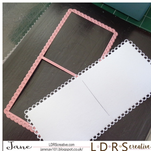
Jane LDRScreative.com janesav101.blogspot.co.uk/ L·D·R·S creative

To make the card base I cut one of the larger dies from the JUBILEE MAGICAL SLIDER SET, and as the die embosses a crease line in the center it was very easy to fold in half.