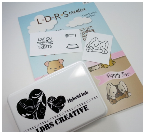
Jane LDRScreative.com janesav101.blogspot.co.uk/ L·D·R·S creative

Firstly, I stamped the images I needed from the adorable stamp and die set PUPPY TIME (I'm totally in love with this set as I'm a bit dog mad) using the RAVEN HYBRID INK PAD.