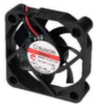
Sunon fan 60,000 Hour Rating Excellent Maglev Power Fan