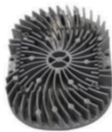
Aluminum Heat sink