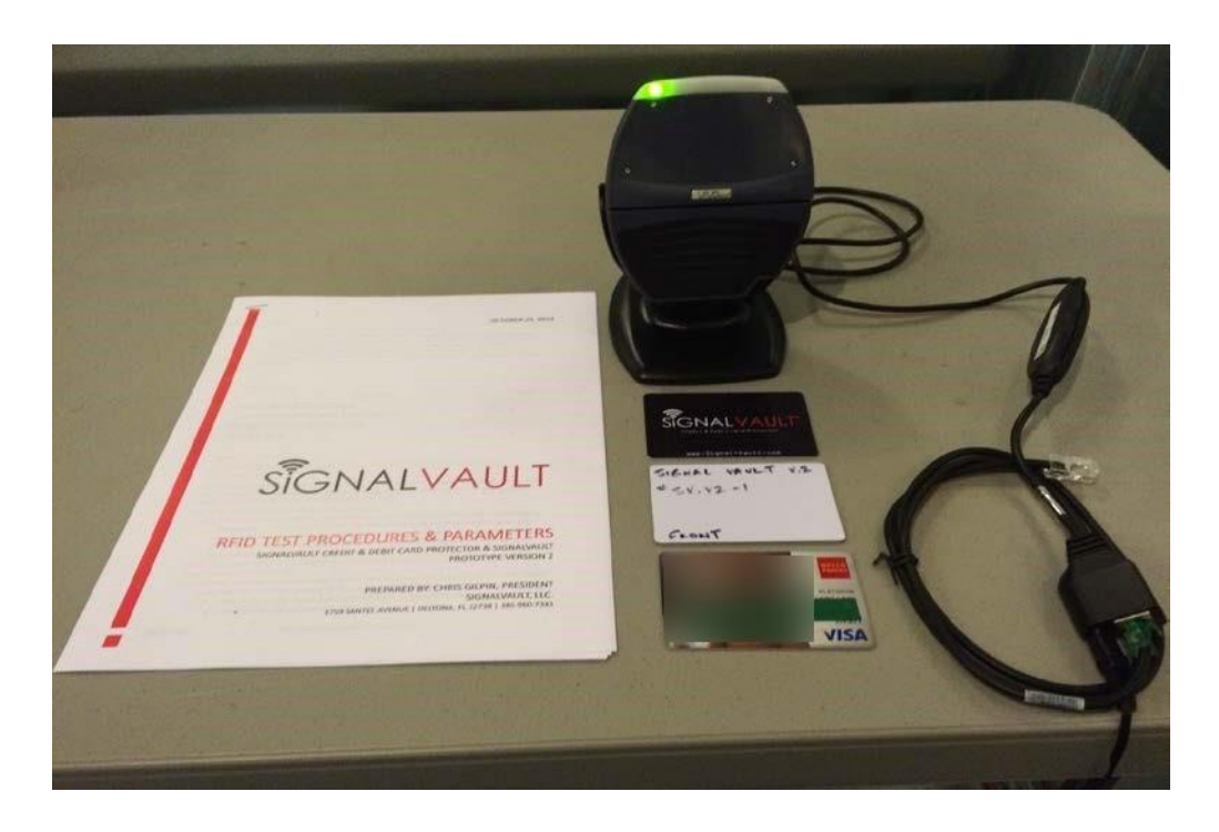
Figure 1: Overall Setup Photo