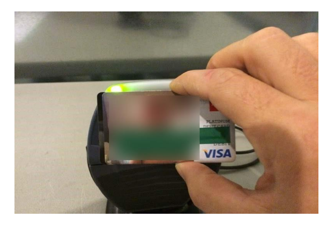
Figure 3: Step 2 (SignalVault V.1, Back Side Scan)