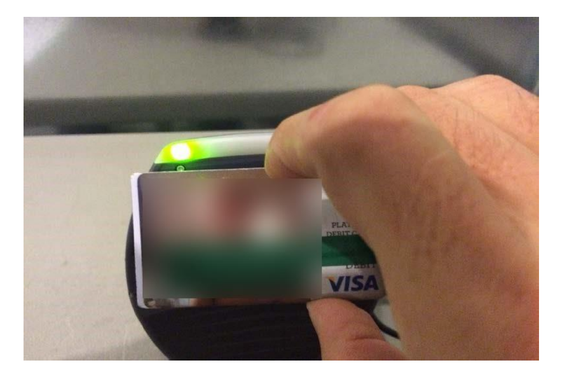
Figure 4: Step 2 (SignalVault V.2, Back Side Scan)