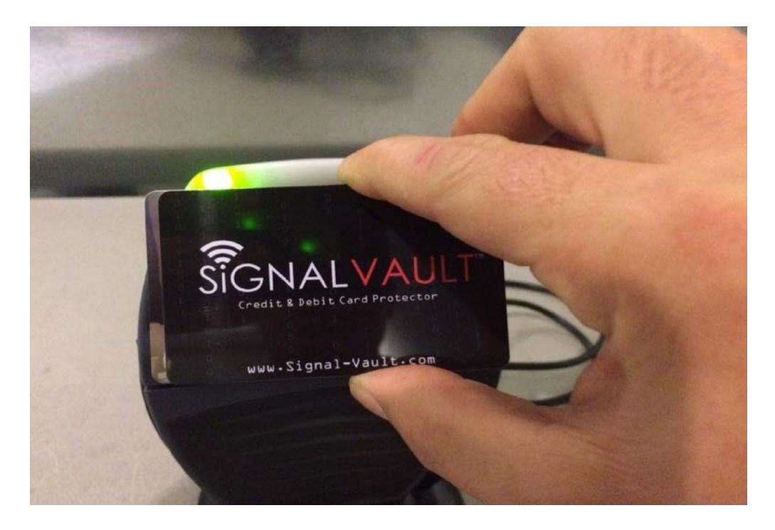
Figure 5: Step 2 (SignalVault V.1, Front Side Scan)