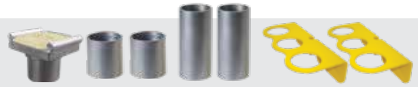
Stack adapter set and single screw footpad with engineered frame engagement included

Challenger's E Series lifts provide symmetric lifting capability with adjustable height to accommodate higher profile vehicles. The E12 model features a pulley-less jacketed single-point lock release system designed to last. All necessary adapters are included. Available in red or blue. ALI/ETL certified.