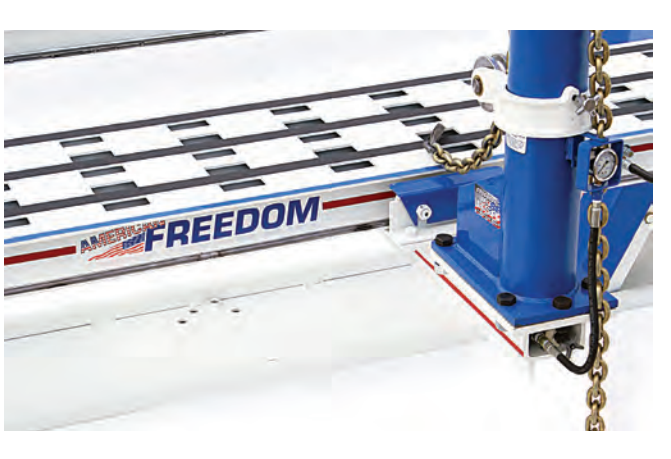
Movable towers that ride on a track. Choose 2, 3 or 4 towers

Specifications are subject to change without notice.