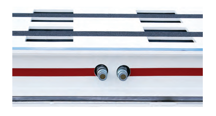
Quick connect no-drip hydraulic couplers, four each side, eight total.