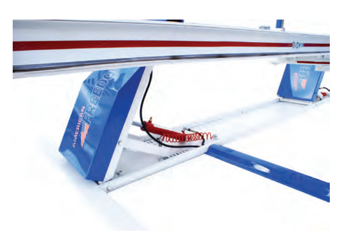
Working height, 14 in. up to 41 in.. Lowers to a loading height of 12 in.