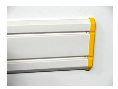
Step 5: If you have purchased the End Caps, they simply slide on.

Step 4: Using the stud locations found in step 2, insert the screws through the FlexiTrack and into the wall. You should use one screw in each of the grooves for stability and at each stud location.