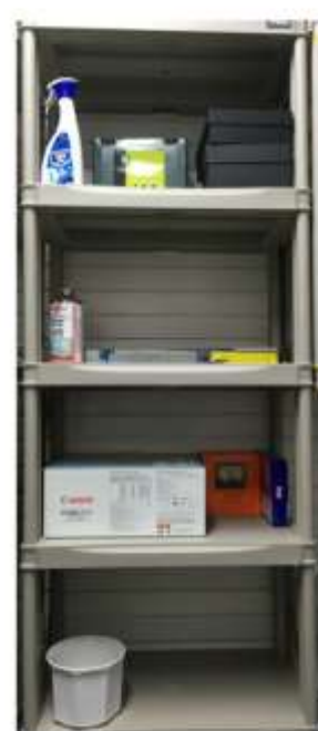
5 Shelf Unit