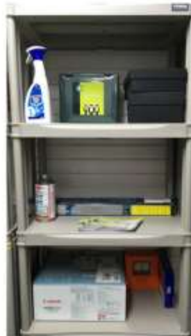
4 Shelf Unit