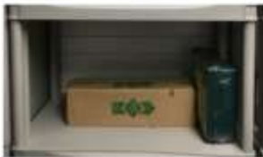
2 Shelf Unit