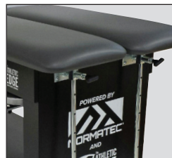
Multi-functional split leg