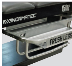
Dual extension boot rack and trays

NormaTec and the Athletic Edge have partnered to provide a comprehensive solution for all your training and recovery room needs. Welcome the newest innovation from NormaTec and the Athletic Edge. This new table will take your training room to the next level.